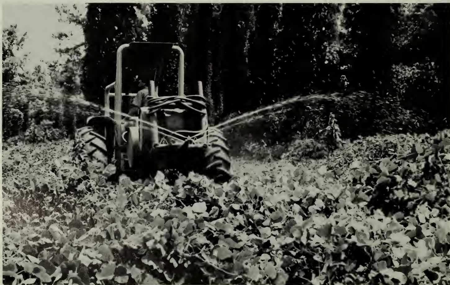
Figure 1. The tractor-sprayer treating the large research plots.