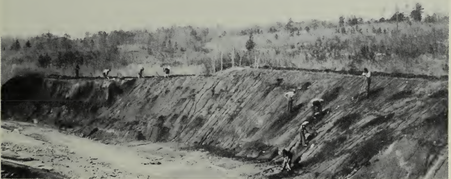
Kudzu was first introduced into this country to stabilize eroding slopes.