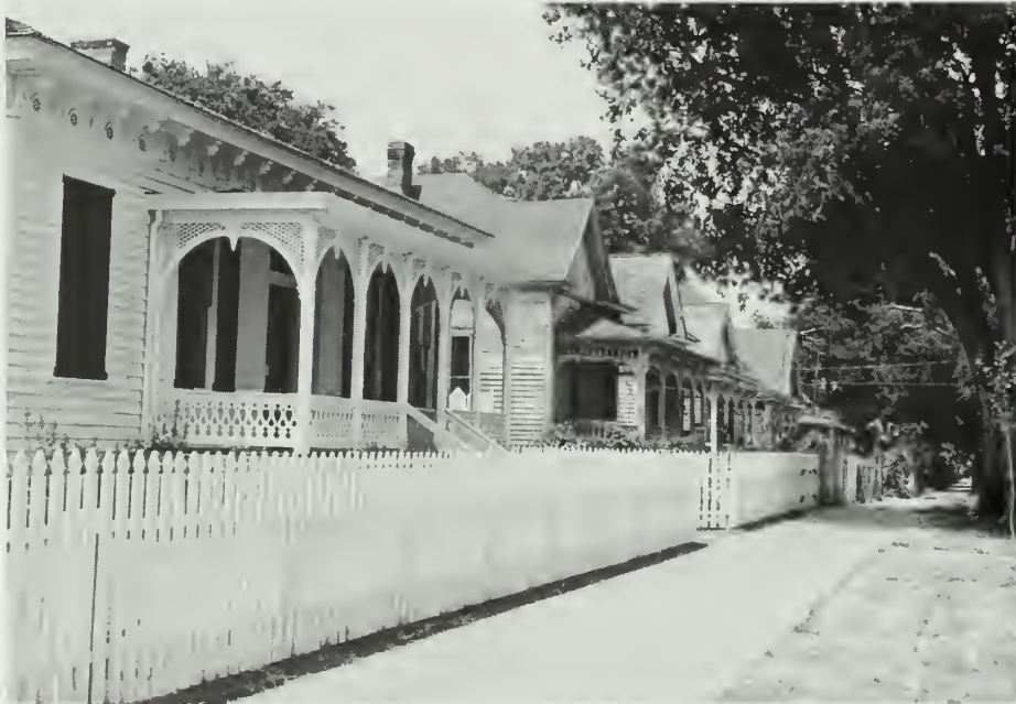
Ordeman-Shaw Historic District, Montgomery, Montgomery County, Alabama. Historic districts derive their identity from the interrelationship of their resources. Part of the defining characteristics of this 19th century residential district in Montgomery, Alabama, is found in the rhythmic pattern of the rows of decorative porches.

business districts canal systems groups of habitation sites college campuses estates and farms with large acreage/ numerous properties industrial complexes irrigation systems residential areas rural villages transportation networks rural historic districts