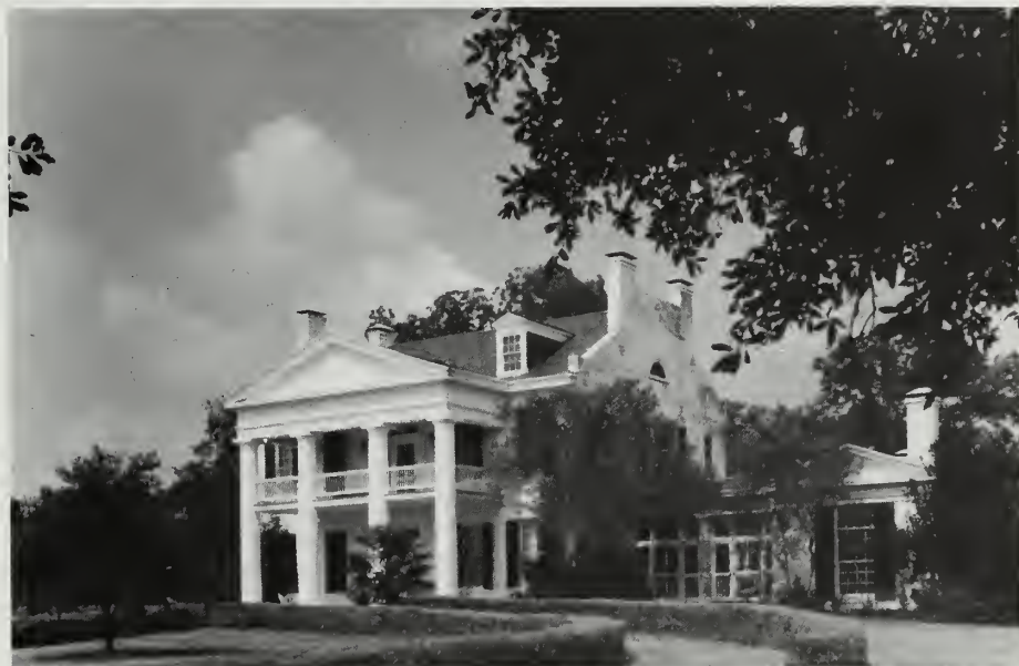
Richland Plantation, East Feliciana Parish, Louisiana. Properties can qualify under Criterion C as examples of high style architecture. Built in the 1830s, Richland is a fine example of a Federal style residence with a Greek Revival style portico.

Properties may be eligible for the National Register if they embody the distinctive characteristics of a type, period, or method of construction, or that represent the work of a master, or that possess high artistic values, or that represent a significant and distinguishable entity whose components may lack individual distinction.