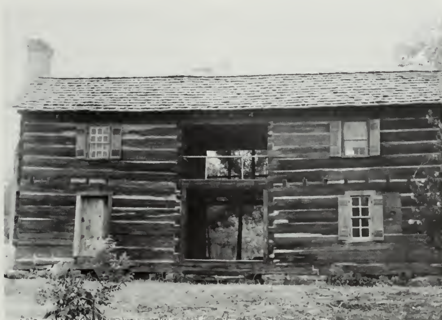
Looney House, Asheville vicinity, St. Clair County, Alabama. Examples of vernacular styles of architecture can qualify under Criterion C. Built ca. 1818, the Looney House is significant as possibly the State's oldest extant two-story dogtrot type of dwelling. The defining open center passage of the dogtrot was a regional building response to the southern climate.