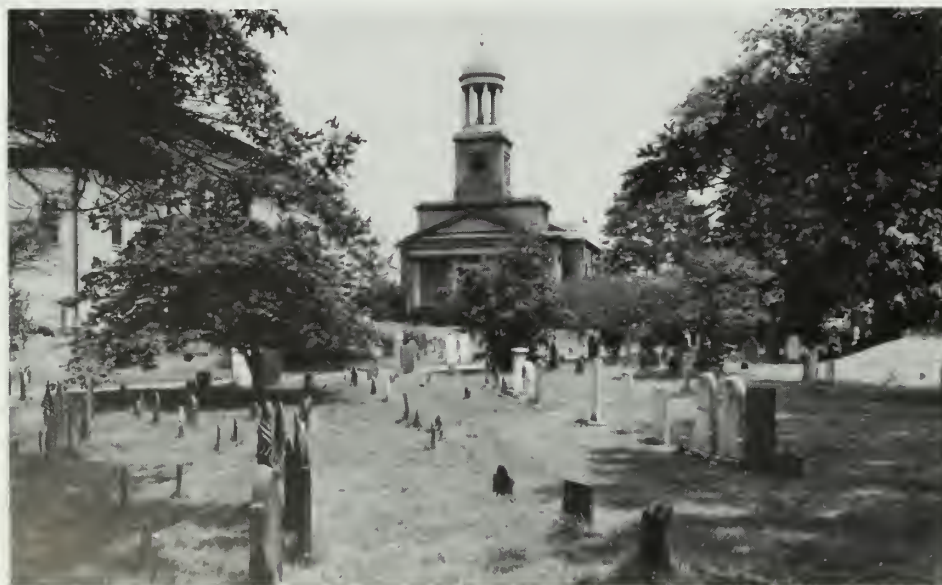
Criteria Consideration D - Cemeteries. The Hancock Cemetery, Quincy, Norfolk County, Massachusetts meets the exception to the Criteria because it derives its primary significance from its great age (the earliest burials date from 1640) and from the distinctive design features found in its rich collection of late 17th and early 18th century funerary art. (N. Hobart Holly)

A cemetery containing the graves of persons of transcendent importance may be eligible. To be of transcendent importance the persons must have been of great eminence in their fields of endeavor or had a great impact upon the history of their community, State, or nation. (A single grave that is the burial place of an important person and is located in a larger cemetery that does not qualify under this Criteria Consideration should be treated under Criteria Consideration C: Birthplaces and Graves.)