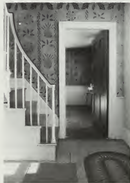
Grant Family House, Saco vicinity, York County, Maine. Properties possessing high artistic value meet Criterion C through the expression of aesthetic ideals or preferences. The Grant Family House, a modest Federal style residence, is significant for its remarkably well-preserved stenciled wall decorative treatment in the entry hall and parlor. Painted by an unknown artist ca. 1825, this is a fine example of 19th century New England regional artistic expression.

defined within the context of Criterion C. Districts, however, can be considered for eligibility under all the Criteria, individually or in any combination, as is appropriate. For this reason, the full discussion of districts is contained in Part IV: How to Define Categories of Historic Properties. Throughout the bulletin, however, districts are mentioned within the context of a specific subject, such as an individual Criterion.