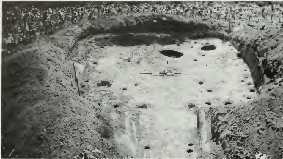
Criterion D - Champe-Fremont 1 Archeological Site, Omaha vicinity, Douglas County, Nebraska. This archeological site, dating from ca. 1100-1450 A.D., consists of pit houses and storage pits which have the potential to yield important information concerning the subsistence patterns, religious and mortuary practices, and social organization of the prehistoric residents of eastern Nebraska.