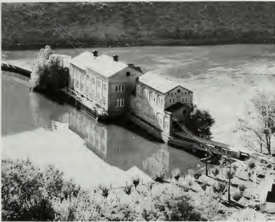
Swan Falls Dam and Power Plant, Murphy vicinity, Ada County, Idaho. Significant works of engineering can qualify under Criterion C. Built between 1900-1907 the Swan Falls Dam and Power Plant across the Snake River is one of the early hydroelectric plants in the State of Idaho.