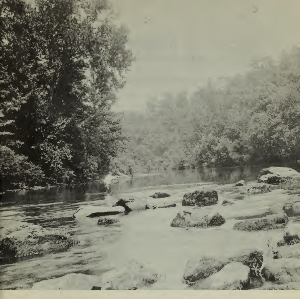
FISHING IN ADJACENT OUACHITA RIVER

United States and Canada. In addition, convenient side trips and stopover privileges may be arranged on bus tickets to or via most points in Arkansas, allowing passengers to include a side trip to the park.