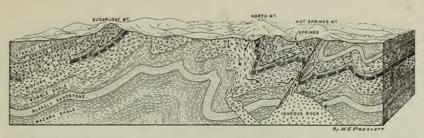
BLOCK DIAGRAM OF THE AREA ABOUT HOT SPRINGS, ARK., SHOWING THE PROB-ABLE ORIGIN OF THE SPRINGS AND THE INFLUENCE OF THE ROCKS AND THEIR STRUCTURE ON THE UNDERGROUND ROUTE OF THE WATER

known, several theories have been advanced. Perhaps the most favored is the meteoric theory which supposes that the rain water which sinks into the Bigfork chert in the valley between West and Sugarloaf Mountains finally emerges in the hot springs. The rain water follows the slope of the chert downward under North Mountain to the southeastward, being confined between the impervious Womble shale below and the Polk Creek shale above. Somewhere on its downward path the water is believed to be heated either by passing close to a mass of hot rock or by absorbing heated gases rising from such a mass. Since the overlying Polk Creek and Missouri Mountain shale and Arkansas novaculite also are impervious, a hidden crack or fault must be the medium of escape for the heated waters from the chert to the porous Hot Springs sandstone at a higher level. Reaching this sandstone, the heated waters are confined to it until they reach the surface.