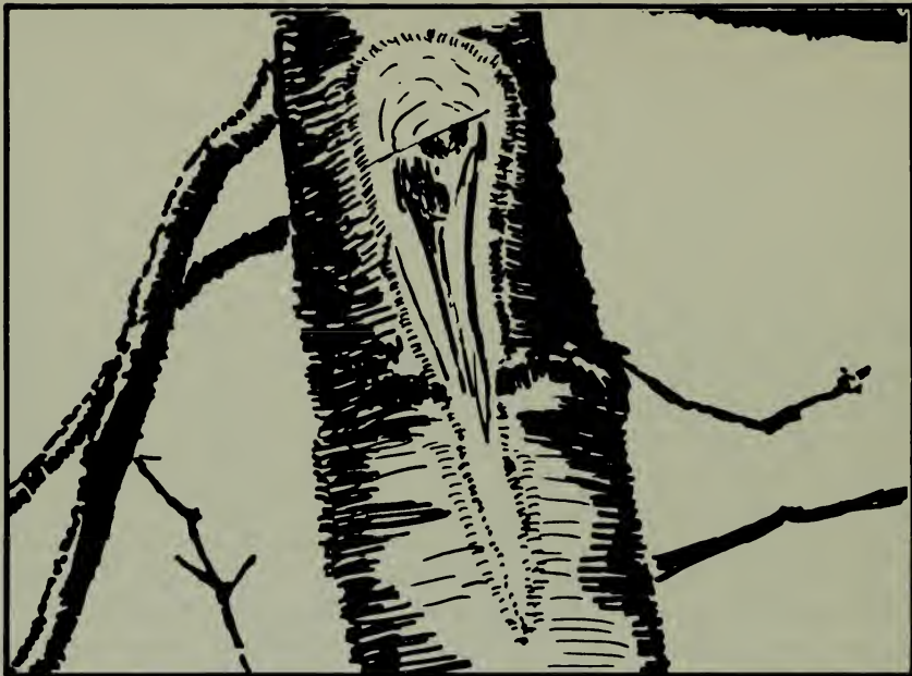
FIGURE 2A. Represents an incorrect pruning cut that resulted in the stripping of the bark, leaving a jagged, deep wound.