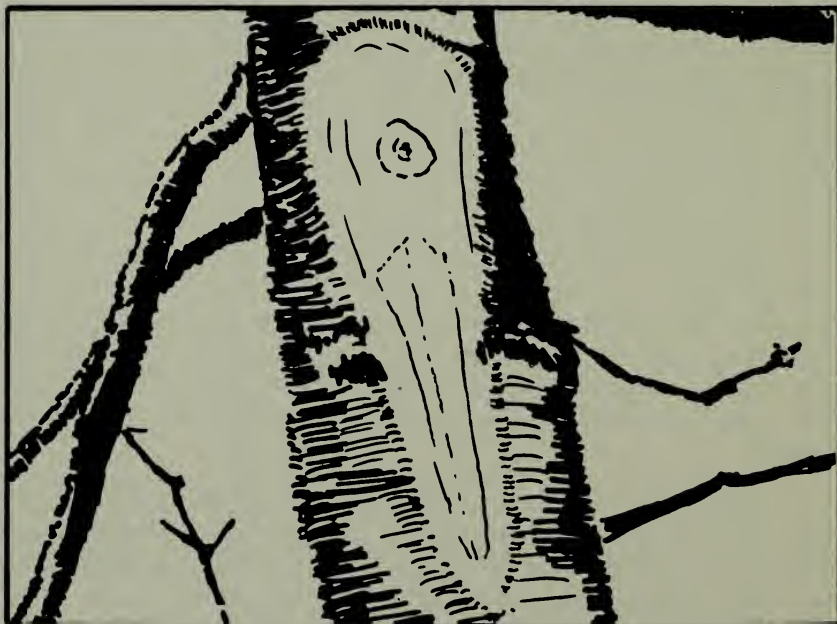
FIGURE 2B. Represents the necessary shaping of the wound to allow continuous drainage and rapid healing.