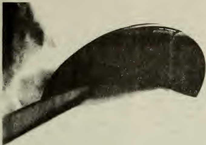
Separation of layers of a laminated Edison Diamond Disc record. Sound modulated layer also shows cracking.

butes simply yet effectively to the preservation of sound quality. In addition, cylindrical recordings should be stored on end in individual cylindrical cardboard boxes with lids and bottoms--either original or custom manufactured to slip-fit the outside diameter of the record. Partitioning a single layered box into 50 slots to hold these cardboard containers will further enhance their life expectancy. Storage of this 50-record box on open shelving makes for easy retrieval through clear, concise labeling on the box exterior. This method of storage keeps records free of dirt and dust and provides even temperature and humidity conditions throughout.