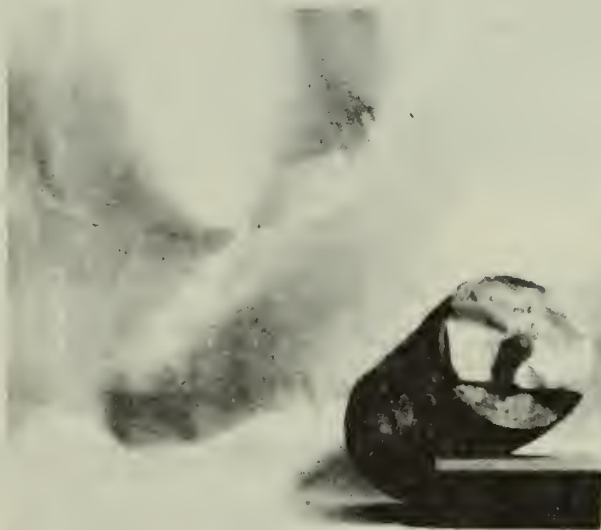
Original shipping can for an Edison cylinder wax master. Label handwritten in pencil, secured with thumb screw.

Heavy duty shelving is a must; the accumulated weight of an audio collection can be considerable. Furthermore, no disc should extend beyond the shelf margin.