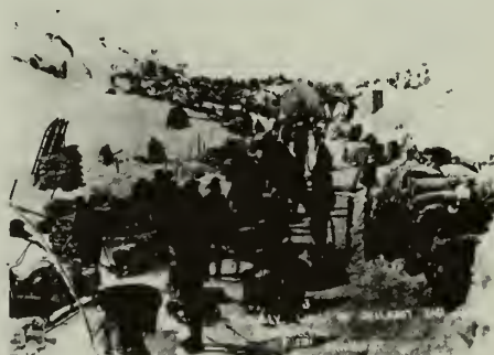
Boundary line between the U.S. and Canada, Chilkoot Pass, Alaska, 1898.

The author was an Interpretive Spe-cialist at the Klondike Gold Rush National Historical Park.