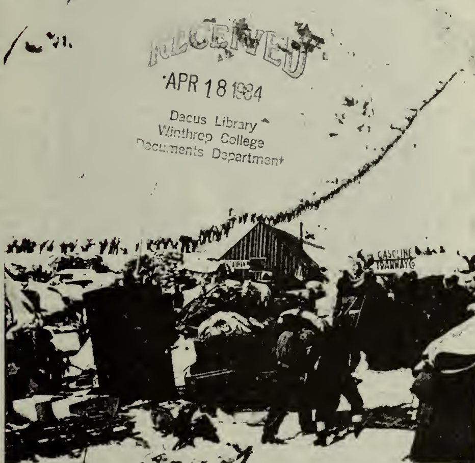
Going to gold fields via the Chilkoot Pass.

With cries of "Gold! Gold in the Klondike!" there unfolded in the Yukon and Alaska an incredible historic adventure, one in which human endeavor in the face of adversity captured the imagination of people all over the world. The fascinating story of the Klondike Gold Rush of 1897-98 is commemorated by a ribbon of historical parks that stretches from Seattle, Washington, to Skagway, Alaska, through Dawson City, Yukon Territory, and beyond.