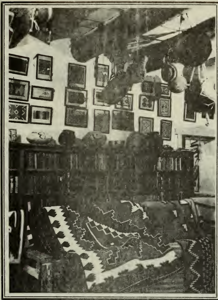
Part of the Hubbell Trading Post collection. Note objects displayed from ceiling.

ing exhibited, using damaging techniques. More than 400 baskets in these two buildings were originally attached to the ceiling with a nail through their centers. In the Trading Post, pitch-covered Apache water jars are hung from original hair handles; and items such as dance anklets, Anasazi saddles, World War I helmets, saddles, and saddle bags are hung from nails. Ways must be devised for exhibiting these items in their historical context without damaging them or visually interfering with them.