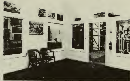
Visitors' Gallery, Golden Gate NRA. On the left, collections displayed through a series of windows.

On October 15, 1982, formal dedication for the Museum Storage Visitor Gallery was held at the Golden Gate National Recreation Area. The Gallery is a new concept in visitor access for the National Park Service, although several museums around the country have been experimenting with the concept, that of visible storage. This dedication marks the culmination of three years of work in making the park's collections accessible to the public.