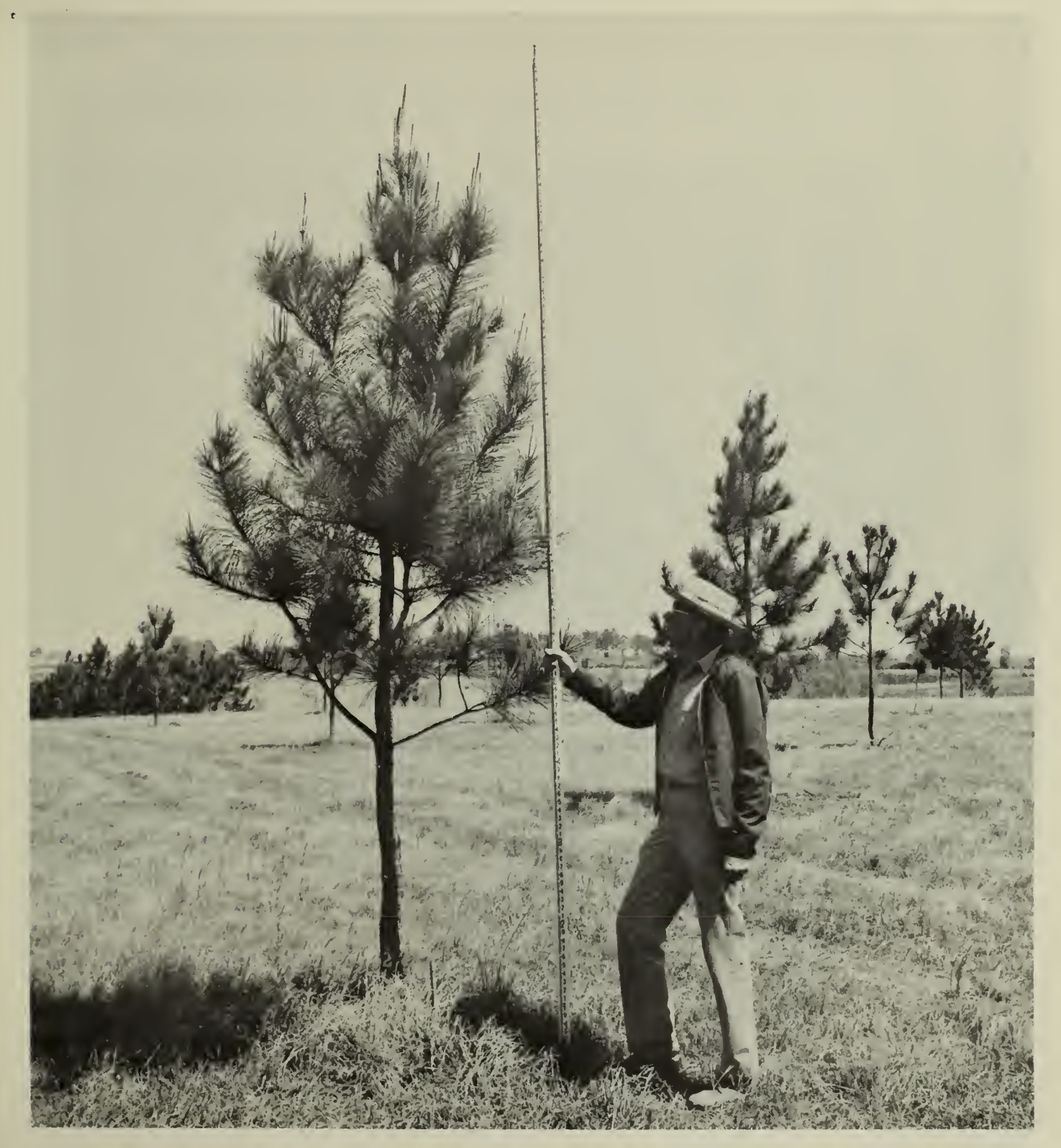
FIGURE 3 Four-year-old loblolly pine grafts in rust resistance seed orchard

To get some idea of field performance, for each species, we collected cones from the trees that were originally selected for inclu-