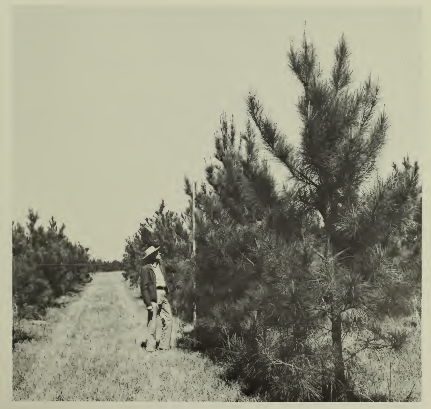
FIGURE 4 Rows of four-year-old loblolly pines in rust resistance seedling seed orchard.

seedlings that will have 55-60% the infection of current stock. We feel that these estimated gains are reasonable, and that by using these rust resistant seedlings in high disease hazard areas, a sizeable gain in pine production can be achieved.