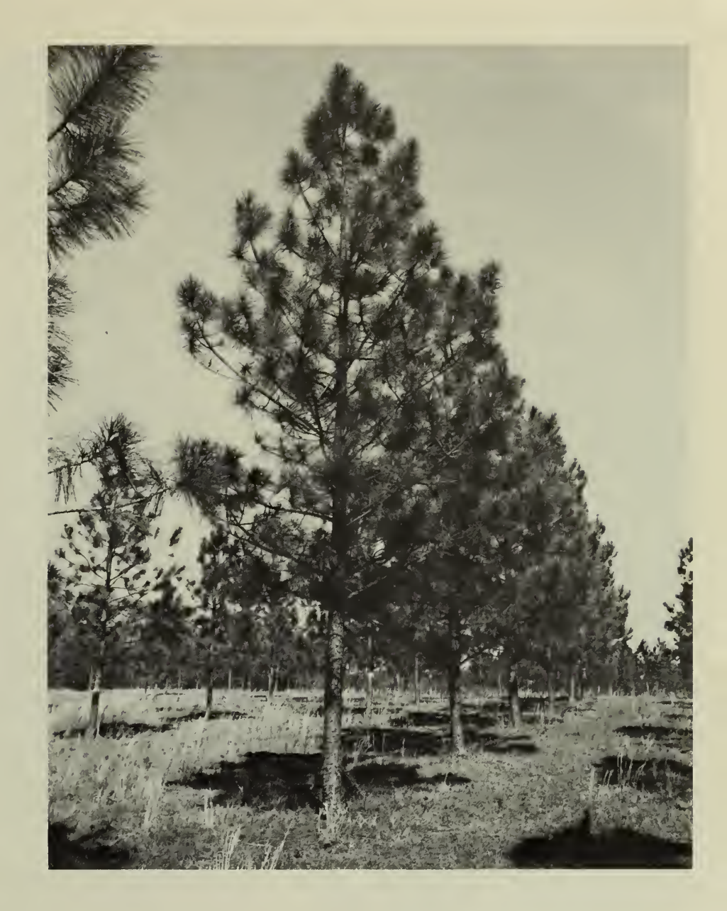
FIGURE 1 Rust resistance slash pine clone bank in Houston County, Georgia

is, the scions of the selected trees are grafted onto root-stocks of nursery seedlings to form the seed-producing trees. In addition to this standard approach, we used the seedling seed orchard technique (7). The basic concept is to plant seedlings from either open or controlled pollinations of the best pine families. We planted them at a 15- by 5-foot spacing, much closer than the standard 30by 30-feet in the grafted orchard. Since the trees are planted so close together, thinning must be ruthless to reach a final spacing of approzimately 30' x 30'. In our seedling seed orchard, 9 of every 10 trees will eventually be removed. We will leave as final crop trees only the very best of each tamily, in terms of rust resistance, and