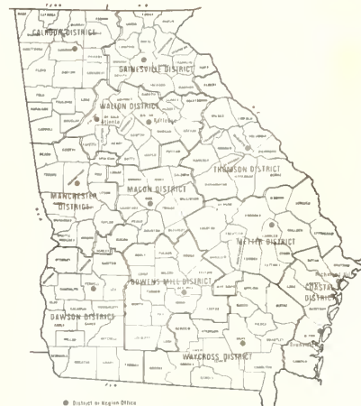
LAW ENFORCEMENT DISTRICTS State Game and Fish Commission