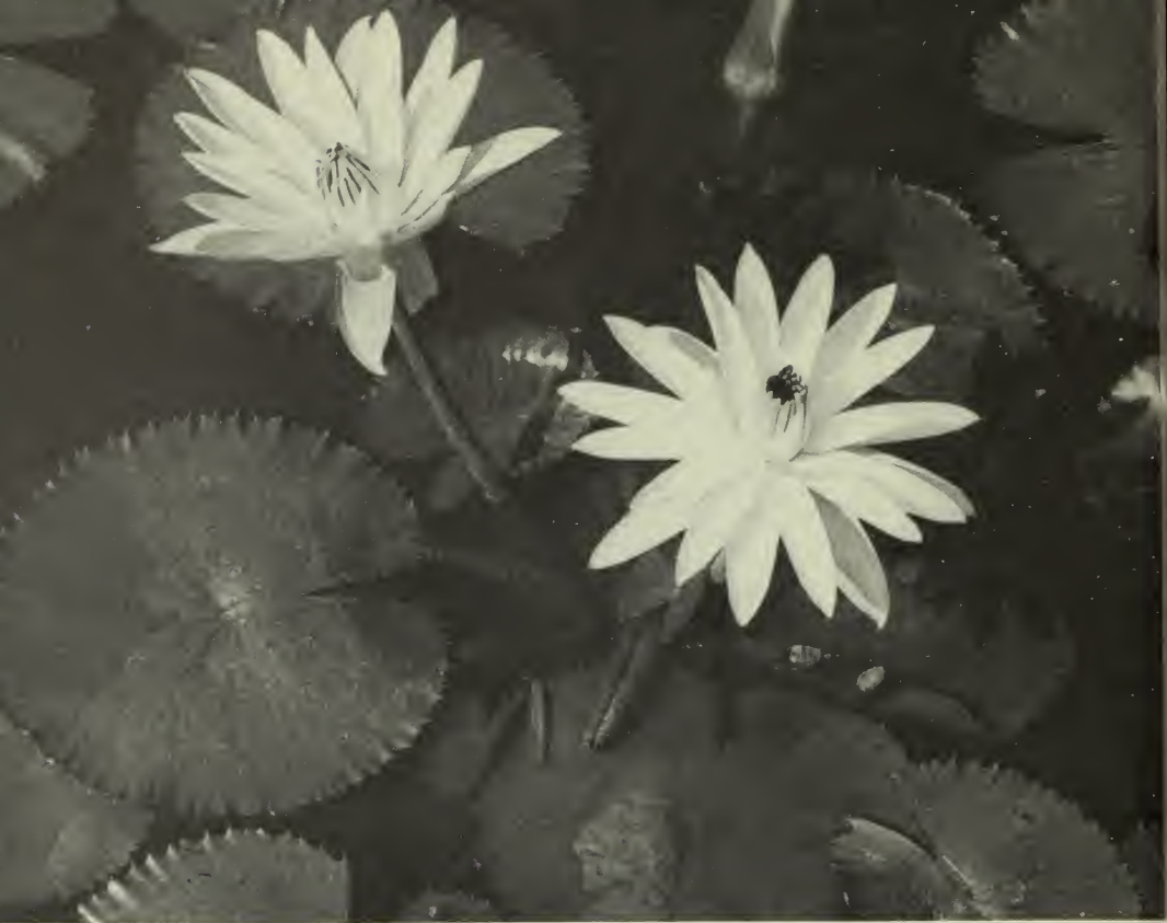
EXOTIC WATERLILIES AT KENILWORTH AQUATIC GARDENS

was acquired by the United States Government in 1938. It extends 185 miles northwesterly from Washington to Cumberland, Md. A total of 75 locks raise the elevation of the canal bed from 5 feet at Georgetown to 610 feet at Cumberland. The part of the canal west of Seneca, Md., is administered as the Chesapeake and Ohio Canal National Monument, with headquarters at Hagerstown, Md. The 22-mile section between Washington and Seneca, Md., has been reconstructed as a recreational and historical unit of National Capital Parks. At Great Falls, Md., a museum portrays graphically the story of the old canal, and a park historian is on duty to answer your questions. Here, also, a natural history trailside exhibit is open during summer.