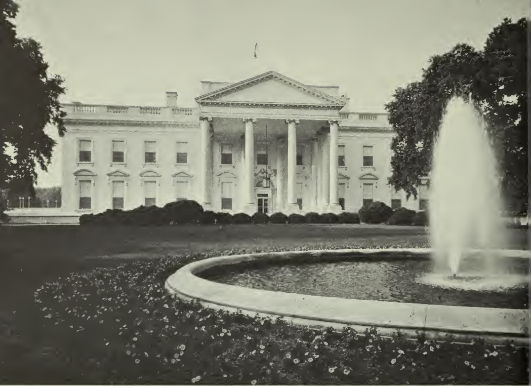
THE WHITE HOUSE

buildings of the “Federal Triangle” face the formal parkway. They are the Departments of Commerce, Labor, and Justice, the Internal Revenue Service, the National Archives, and the Federal Trade Commission. On the south side of Constitution Avenue, between 6th and 12th Streets, are the National Gallery of Art, the National History Museum, and the Museum of History and Technology. Along Independence Avenue, between 7th and 14th Streets, are the Army Medical Museum, the Smithsonian Institution, the Freer Gallery of Art, and the Department of Agriculture group. West of 14th Street are the Washington Monument Grounds.