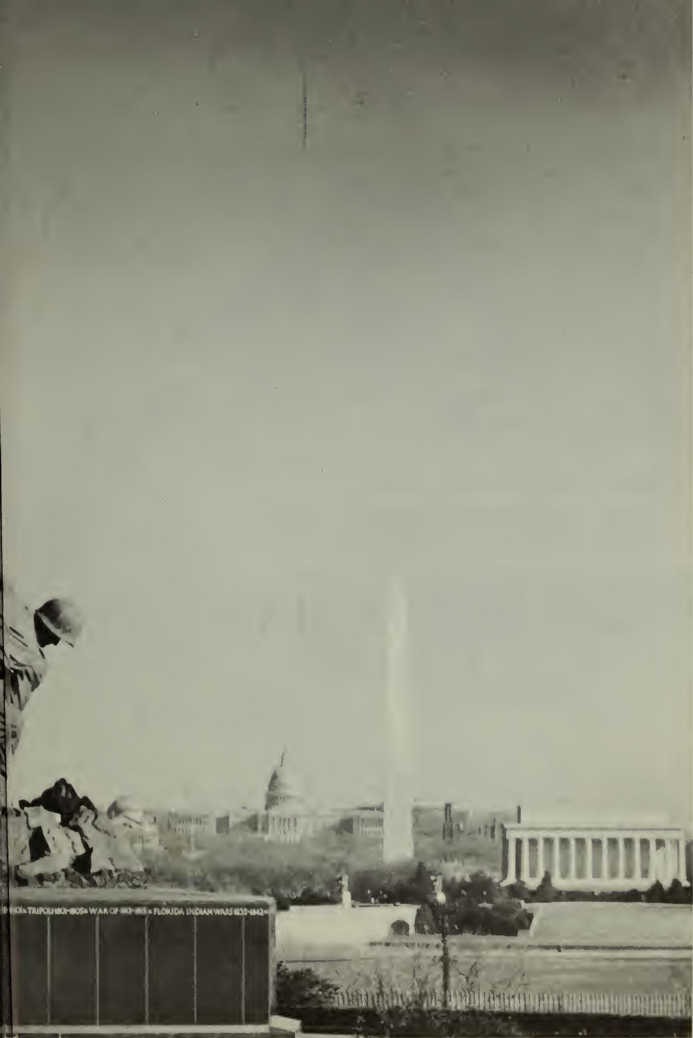
FLORIDA INDIAN WARS 1813-1815 - WAR OF 1812-1815 - TRUFOL 1801-1805 - FLORIDA INDIAN WARS 1813-1815