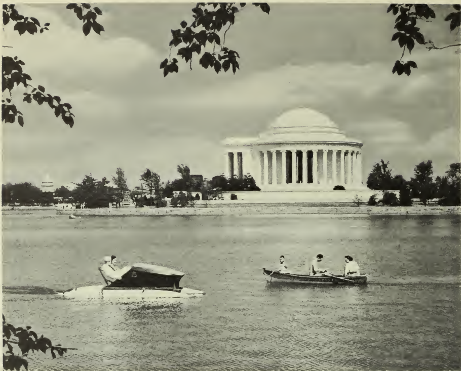
BOATING ON THE TIDAL BASIN. IN THE BACKGROUND IS THE JEFFERSON MEMORIAL