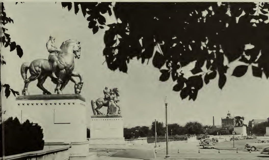
EQUESTRIAN STATUES, ARLINGTON MEMORIAL BRIDGE PLAZA

At the western extremity of West Potomac Park is the memorial to John Ericsson, inventor of the screw propeller. To the east is the Tidal Basin, surrounded by the famous Japanese cherry trees presented by the city of Tokyo. The first two trees in the gift shipment were