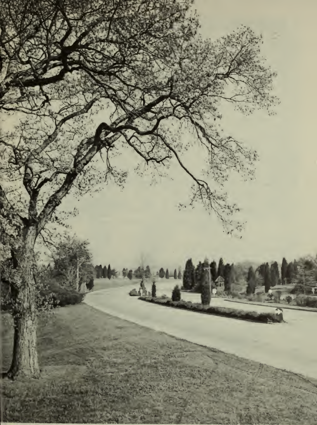
MOUNT VERNON MEMORIAL HIGHWAY