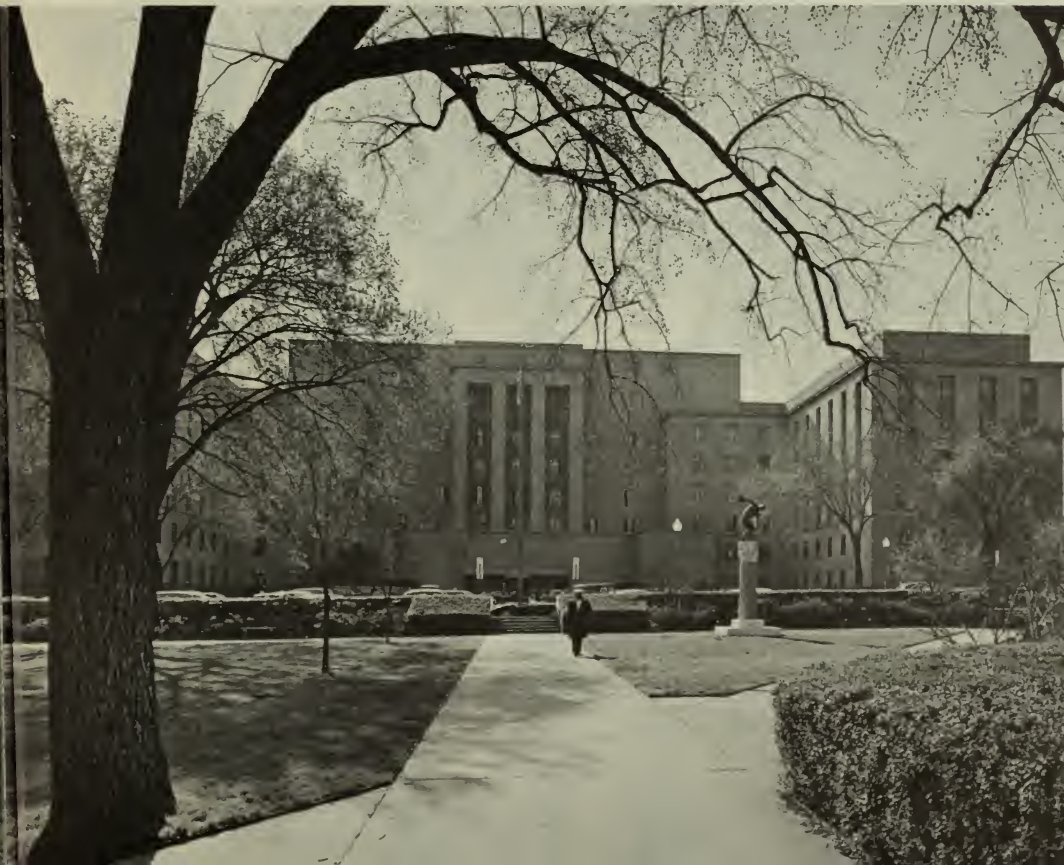
EDWARD J. KELLY PARK, WITH STATE DEPARTMENT IN BACKGROUND

Anacostia Park, bordering the Anacostia River in southeast Washington, was developed through reclamation of the Anacostia Flats. There are sports facilities and a swimming pool. Flowering crabapple trees border the driveway