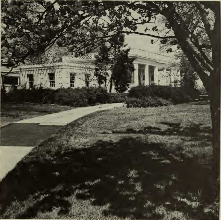
HAINS POINT VISITOR CENTER

There are about 150 hotels and many first-class roominghouses in Washington. Information about rates and reservations can be obtained by writing the Hotel Association of Washington, 1025 Connecticut Avenue NW., Washington 6, D.C.