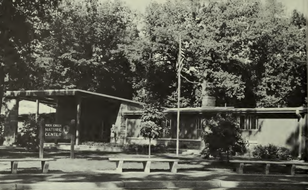
ROCK CREEK NATURE CENTER