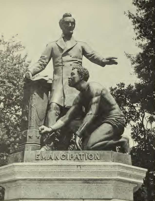
EMANCIPATION STATUE IN LINCOLN PARK