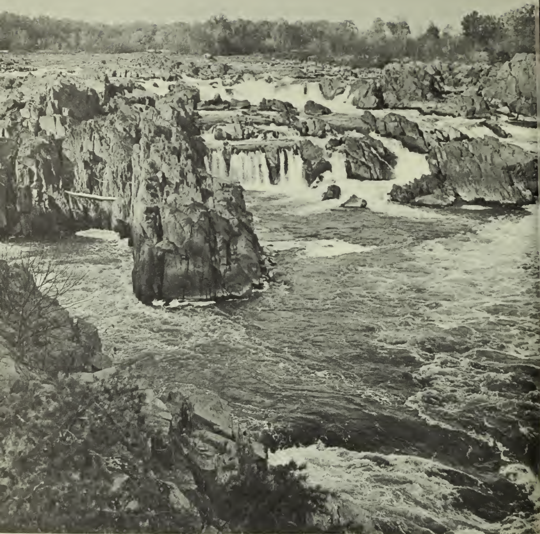
GREAT FALLS OF THE POTOMAC

Custis-Lee Mansion with the purpose of creating a better understanding and appreciation of men of character in the minds of our children. By studying the lives of Abraham Lincoln and Thomas Jefferson, young citizens are instilled with the desire to emulate these builders of America.