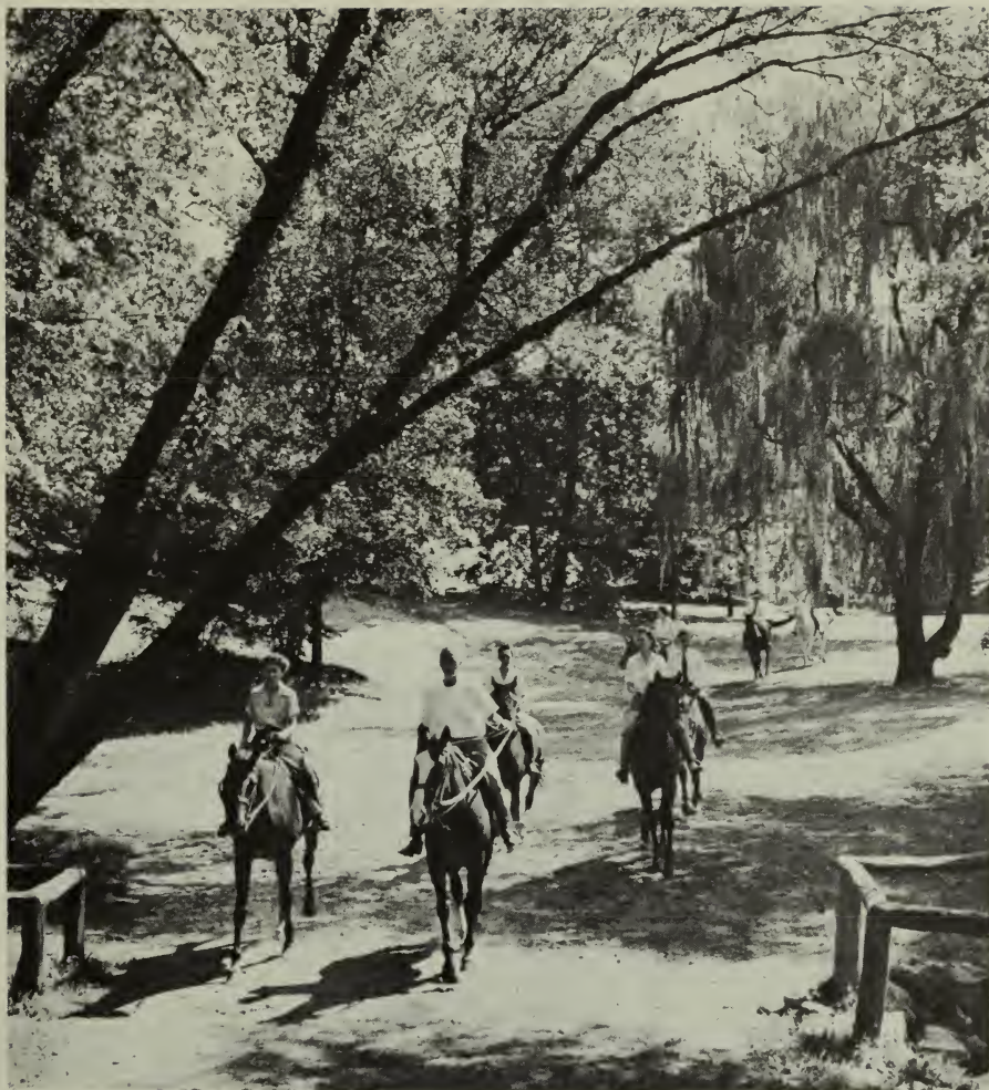
RIDING IN ROCK CREEK PARK