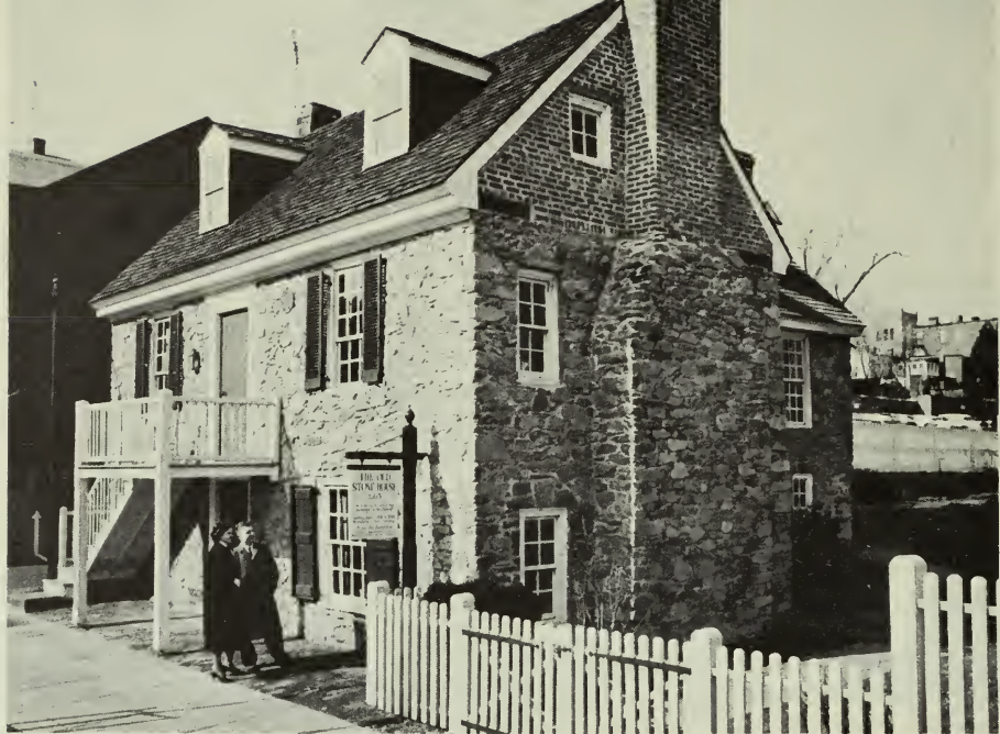
OLD STONE HOUSE

his tragic death. Across the street from the museum is the House Where Lincoln Died, which is furnished in the period of the Civil War.