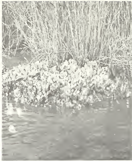
Part of the oyster study of the Game and Fish Commission to be conducted by the Sapelo Island research facility will include an inventory of the size and extent of Georgia's existing oyster beds, many of which are not closed by pollution.