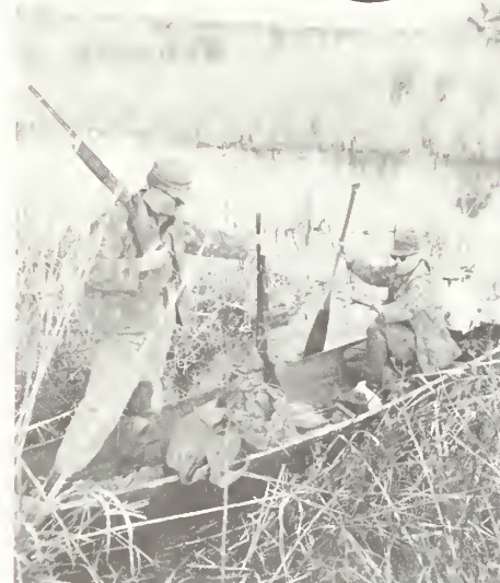
Scenes like the one above are frequent during duck season. This year hunters will have a 40 day season.

An entirely new type of hunt for Continued on Page 2