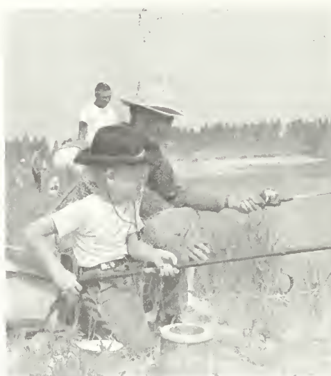
Bath the young and old came to fish at the new ponds. They fished on the banks and in boats. During the first three days of the opening, a total of 1,841 fishermen caught 19,281 fish weighing 5,181 pounds.