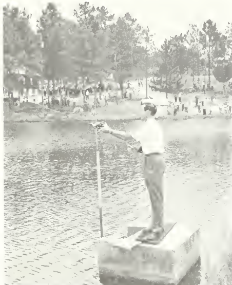
Georgia's Governor Carl Sanders was on hand to dedicate the new area and also to see how the fishing was. After only several casts the governor landed a bass.