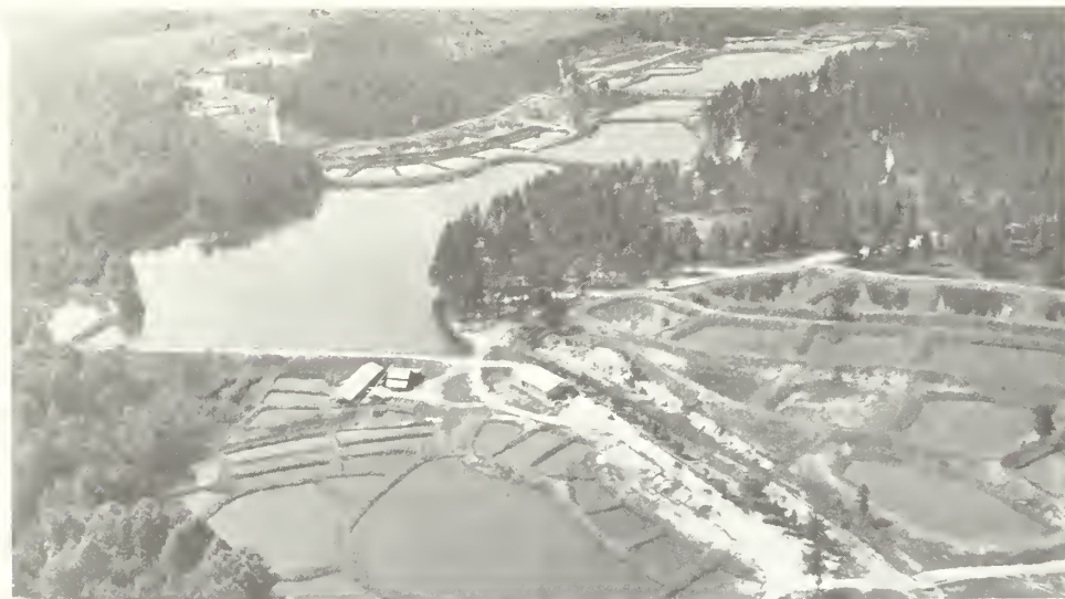
The 14 ponds, stacked with largemouth bass, bluegill, shellcracker, and channel catfish were opened to the public July 23.