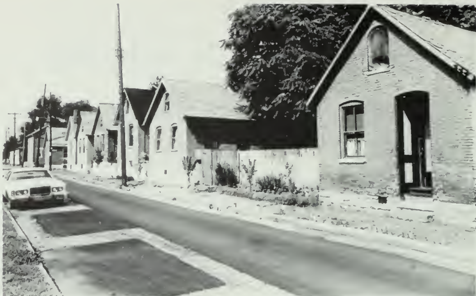
The German Village Historic District in Columbus, Ohio, reflects the ethnic heritage of 19th century German immigrants. The neighborhood includes many simple vernacular brick cottages with gable roofs. (Christopher Cline)

preserving and conserving the intangible elements of our cultural heritage such as arts, skills, folklife, and folkways. . .