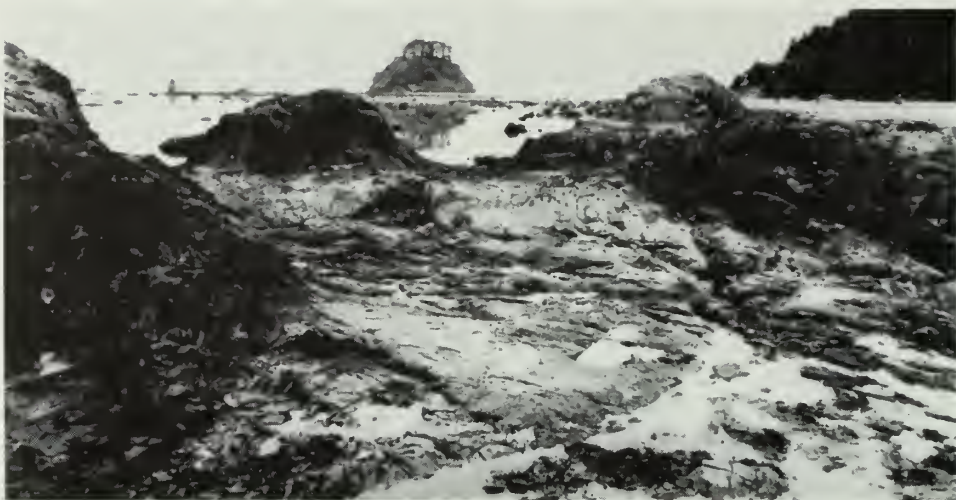
Cannonball Island, off Cape Alava on the coast of Washington State, is a traditional cultural property of importance to the Makah Indian people. It was used in the past, and is still used today, as a navigation marker for Makah fishermen, who established locations at sea by triangulation from this and other landmarks. It also was a lookout point for seal and whale hunters and for war parties, a burial site, and a kennel for dogs raised for their fur.

Some kinds of traditional cultural significance also may be retained regardless of how the surroundings of a