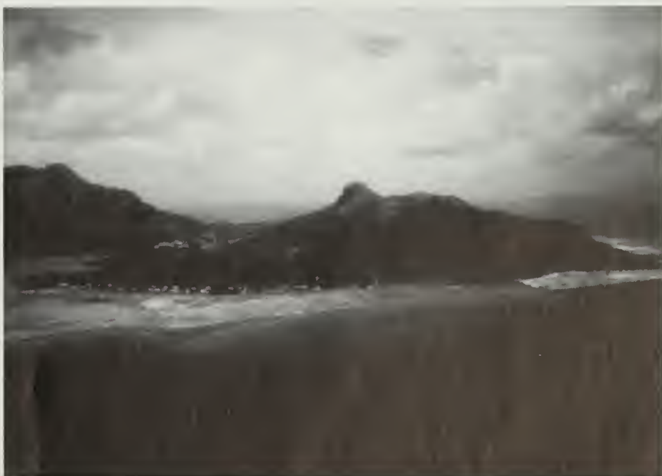
In Trukese tradition, the Tonaachaw Historic District was the location to which Sowukachaw, founder of the Trukese society, came and established his meetinghouse at the beginning of Trukese history. The mountain, in what is now the Federated States of Micronesia, is a powerful landmark in the traditions of the area. (Lawrence E. Aten)

A property made up of or containing art work valued by a group for traditional cultural reasons, for example a petroglyph or pictograph site venerated by an Indian group, or a building whose decorative elements reflect a local ethnic groups distinctive modes of expression, may be viewed as having high artistic value from the standpoint of the group.