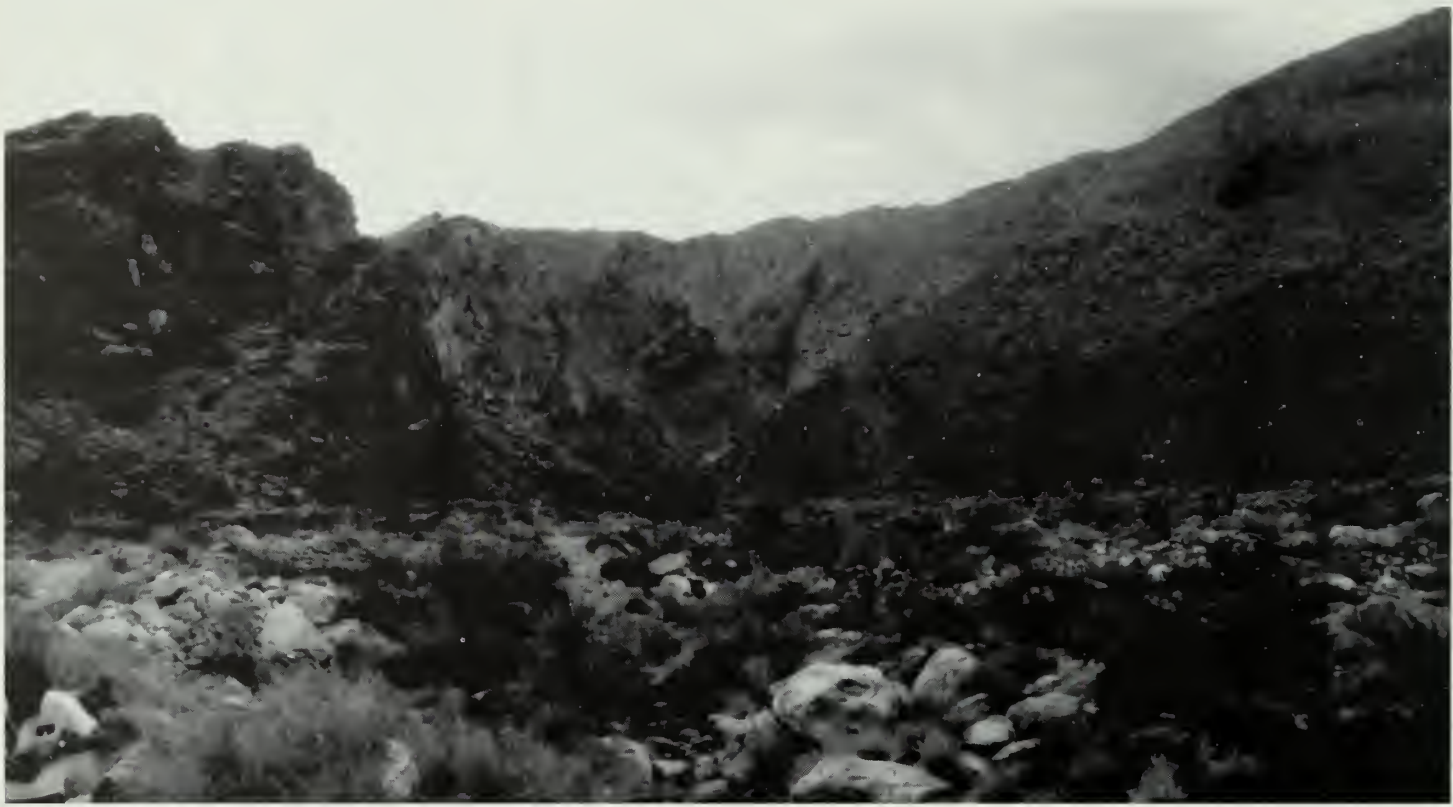
Tahquitz Canyon, in southern California, is included in the National Register because of its association with the traditions of the Cahuilla Indians. The ancestors of the Cahuilla came into this world from a lower one at the beginning of time, and an evil spirit, named Tahquitz, is believed to live in the upper reaches of the canyon.

The fact that a property may have gone unused for a lengthy period of time, with use beginning again only recently, does not make the property ineligible for the Register. For example, assume that the Indian tribe referred to above used the mountain peak in prehistory for communication with the supernatural, but was forced to abandon such use when it was confined to a distant reservation, or when its members were converted to Christianity. Assume further that a revitalization of traditional religion has be-