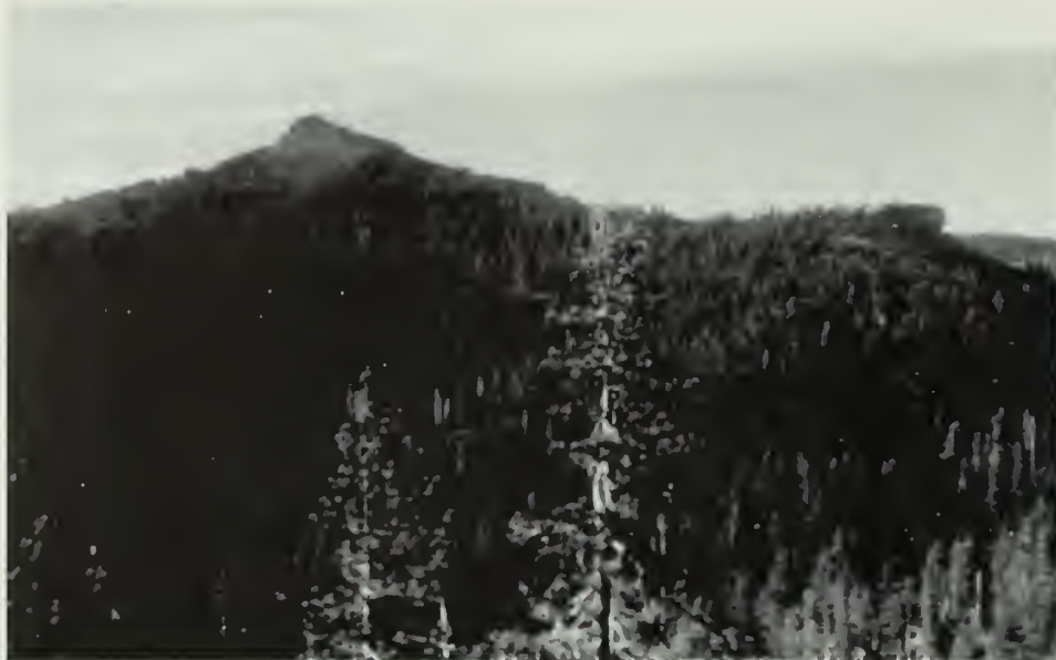
The Helkau Historic District, in the Six Rivers National Forest of California, is eligible for inclusion in the National Register because of its association with significant cultural practices of the Tolowa, Yorok, Karuk, and Hoopa Indian tribes of the area, who have used the district for generations to make medicine and communicate with spirits. (Theodoratus Cultural Research)

Fieldwork to identify properties of traditional cultural significance involves consultation with knowledge-