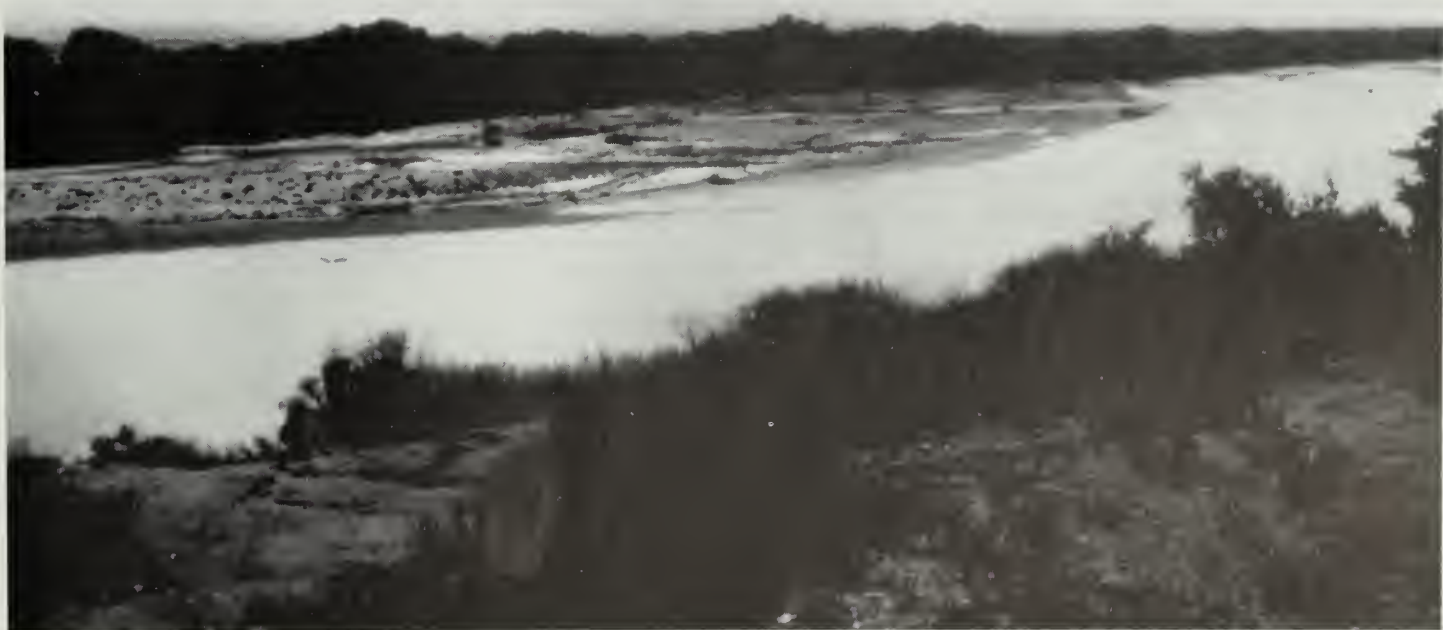
These sandbars in the Rio Grande River are eligible for inclusion in the National Register because they have been used for generations by the people of Sandia Pueblo for rituals involving immersion in the river's waters. (Thomas F. King)