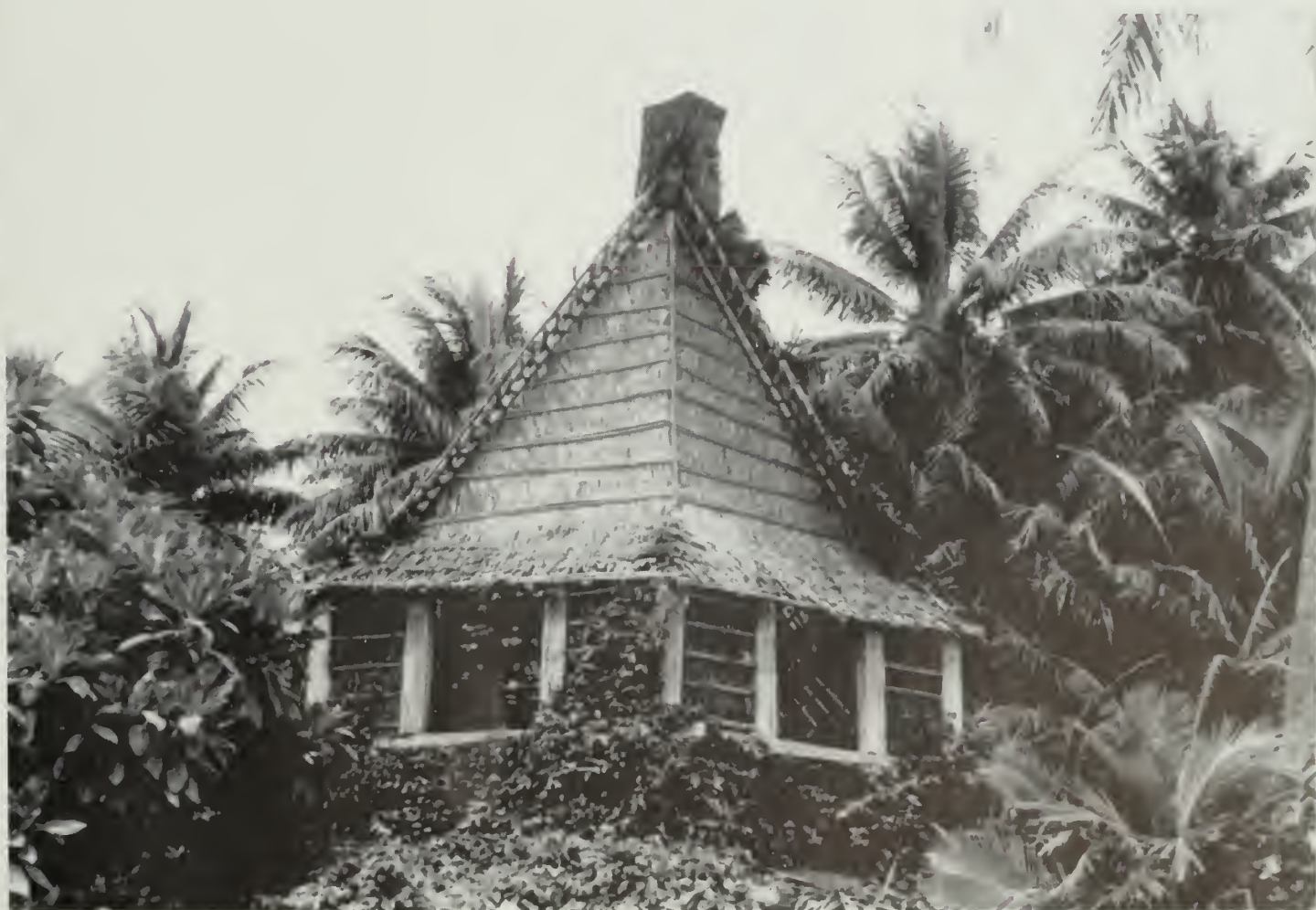
Individual structures can have traditional cultural significance, like this Yapese men's house, used by Yapese today in the conduct of deliberations on matters of cultural importance.

To assist in determining whether a given activity outside the boundaries of a traditional cultural property may constitute an adverse effect, it is vital that the nomination form or eligibility documentation discuss those qualities of a property's visual, auditory, and atmospheric setting that contribute to its significance, including those qualities whose expression extends beyond the boundaries of the property as such into the surrounding environment.