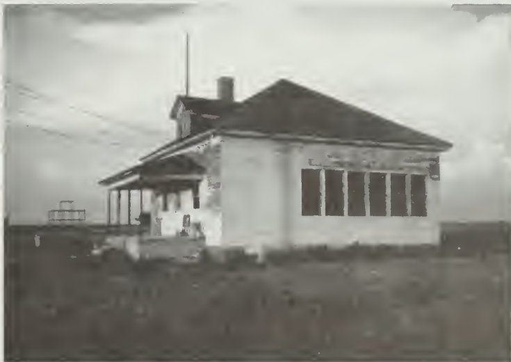
Numerous African Americans left the South to migrate to the Midwest. The A.M.E. Church (on left) and District No. 1 School remain in Nicodemus Historic District in Nicodemus, Kansas, which was declared a National Historic Landmark by the Secretary of the Interior in 1976.