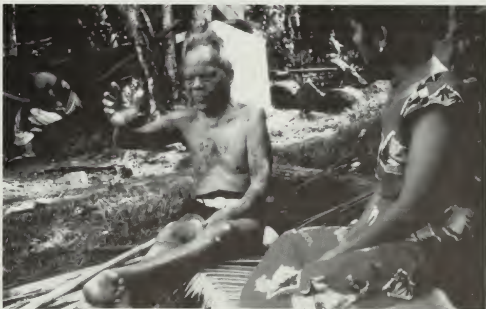
Much of the significance of traditional cultural properties can be learned only from testimony of the traditional people who value them, like this old man being interviewed in Truk.

Sometimes an apparent conflict exists between documentary data on traditional cultural properties and the testimony of contemporary consultants. The most common kind of conflict occurs when ethnographic and ethnohistorical documents do not identify a given place as playing an important role in the tradition and culture of a group, while contemporary members of the group say the property does have such a role. More rarely, documentary sources may indicate that a property does have cultural significance while contemporary sources say it does not. In some cases, too, contemporary sources may disagree about the significance of a property.