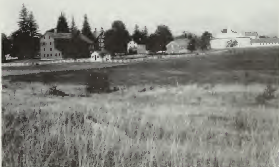
The fact that a property has religious connotations does not automatically disqualify it for inclusion in the National Register. This Shaker community in Massachusetts, for example, while religious in orientation, is included in the Register because it expresses the cultural values of the Shakers as a society.