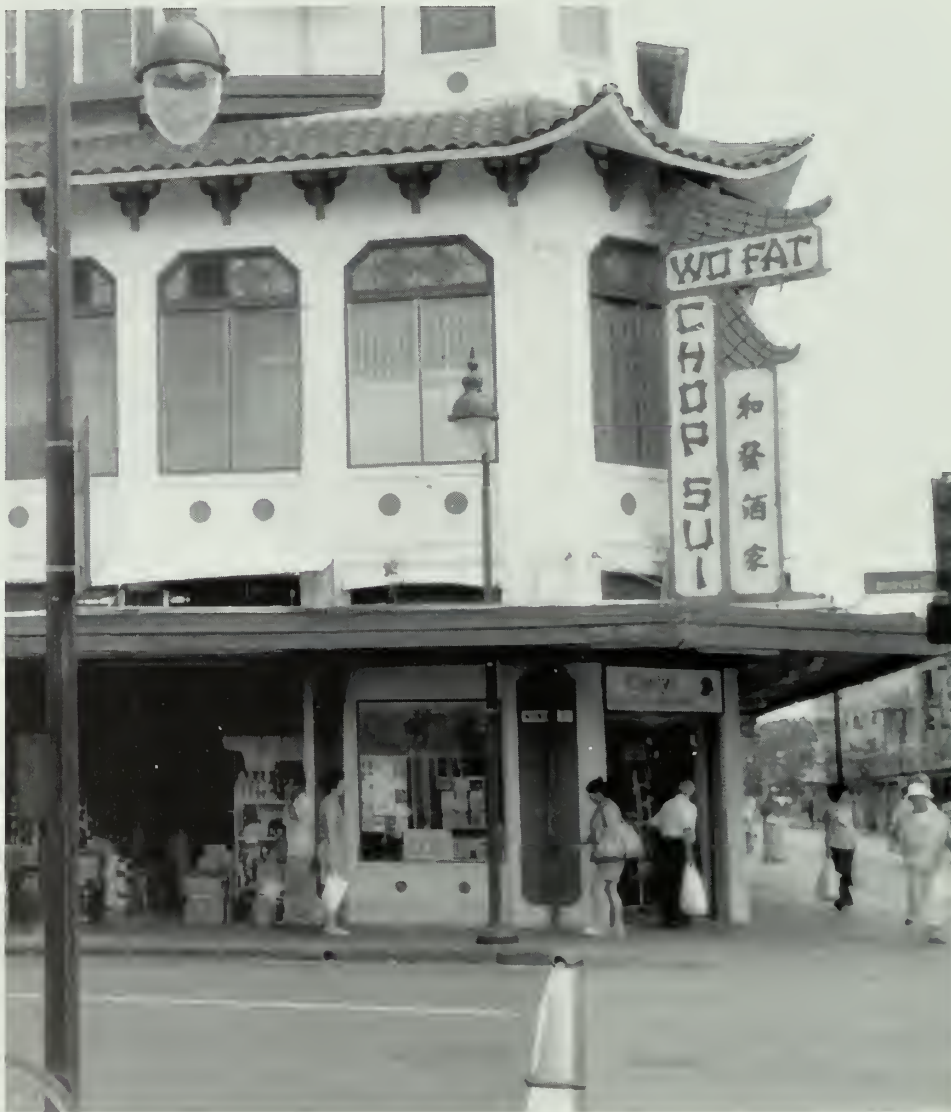
Honolulu's Chinatown reflects the cultural values and traditions of its inhabitants not only in its architectural details but also in its organization of space and the activities that go on there.

Any comprehensive effort to identify historic properties in an area, be the area a community, a rural area, or the area that may be affected by a construction or land-use project, should include a reasonable effort to identify traditional cultural properties. What constitutes a "reasonable" effort depends in part on the likelihood that such properties may be present. The likelihood that such properties may be present can be reliably assessed only on the basis of background knowledge of the area's history, ethnography, and contemporary society developed through preservation planning. As a general although not in-