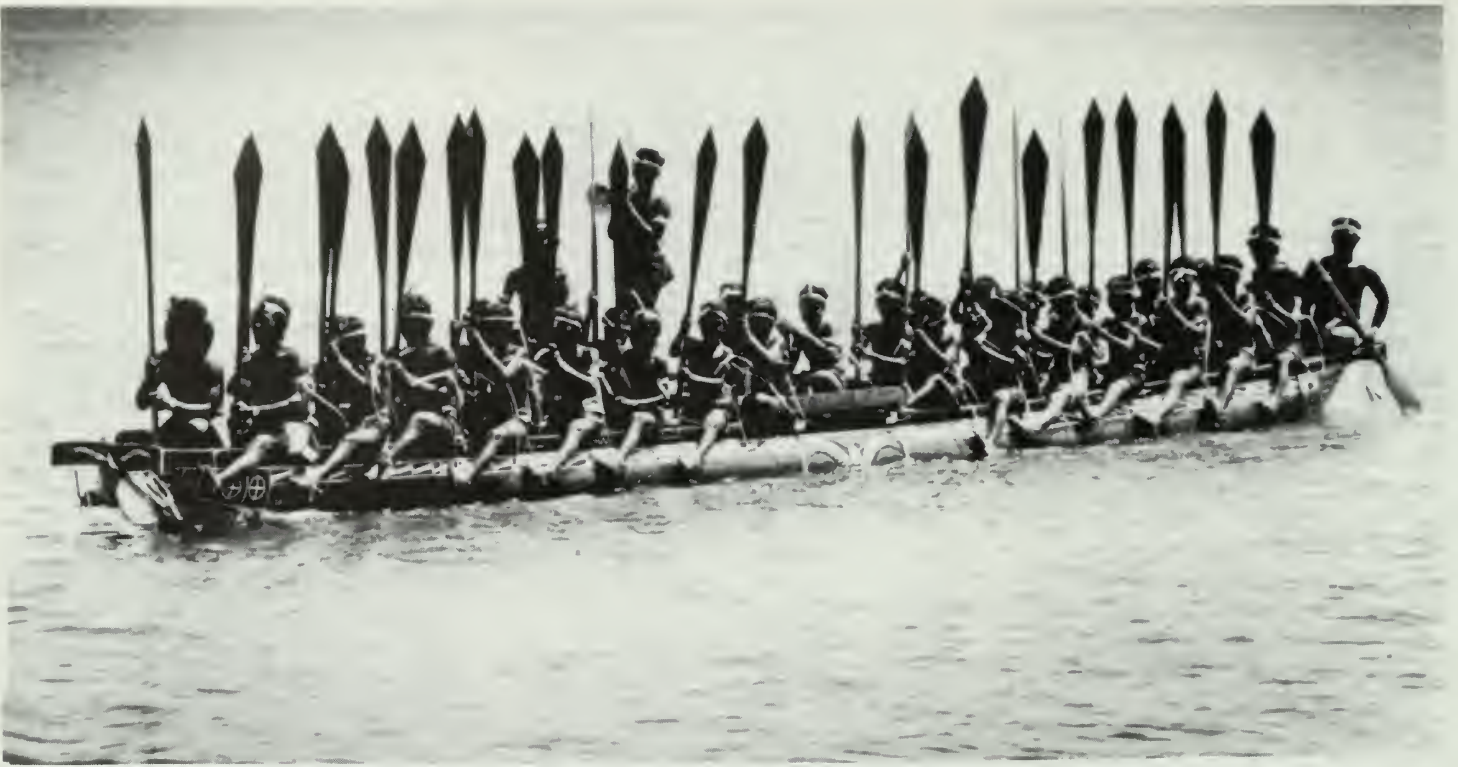
Some traditional cultural properties may be moveable, like this traditional war canoe still in use in the Republic of Palau.

destroy its significance, provided it remains "located in a historically appropriate setting." 16 For example, a traditionally important canoe or other watercraft would continue to be eligible as long as it remained in the water or in an appropriate dry land context (e.g., a boathouse). A property may also retain its significance if it has been moved historically. 17 For example, totem poles moved from one Northwest Coast village to another in early times by those who made or used them would not have lost their significance by virtue of the move. In some cases, actual or putative relocation even contributes to the significance of a property. The topmost peak of Mt. Tonaachaw in Truk, for example, is traditionally thought to have been brought from another island; the stories surrounding this magical relocation are parts of the mountains cultural significance.