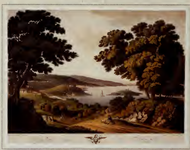
City of Washington, 1801

tion members along the way. Between November and December 1803, the growing team traveled up the Mississippi River to Wood River, Illinois north of St. Louis and across from the mouth of the Missouri River where they established winter quarters at Camp Dubois.