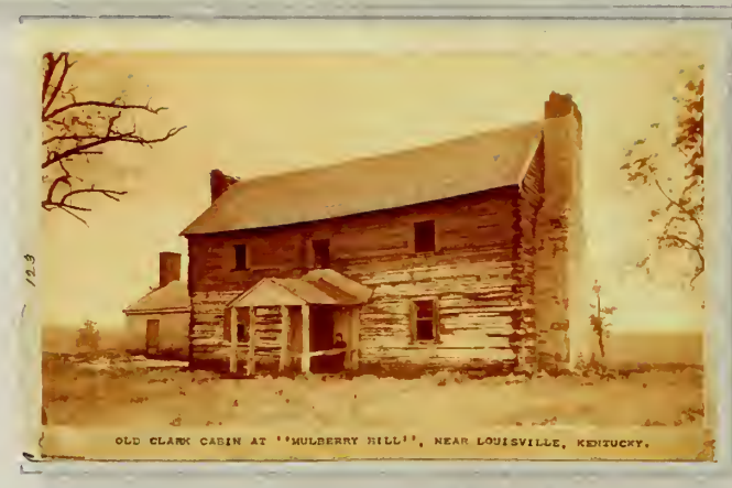
Clark Cabin near Louisville, Kentucky

2. It must be of national significance with respect to any of several broad facets of American history and have had a far reaching effect on broad patterns of American culture,