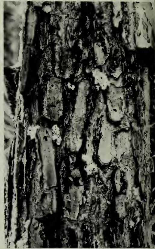
Figure 2. --Typical pitch tubes made by black turpentine beetles when attacking the lower trunks of southern pines.

Before appropriate control procedures can be started, one must determine whether BTB or other bark beetles are attacking the pines. The best clues for identifying the presence of BTB are the large pitch tubes (Fig. 2) that are found within the lowest three to six feet of the tree trunk. Pitch tubes resulting from the earliest attacks, however, usually occur within 18 inches above the ground. The pinkish-white to reddish-brown pitch tubes have a diameter about the size of a 50-cent piece and form on the bark surface at the point where the beetles bore through the outer bark into the pitchy white inner bark next to the wood.