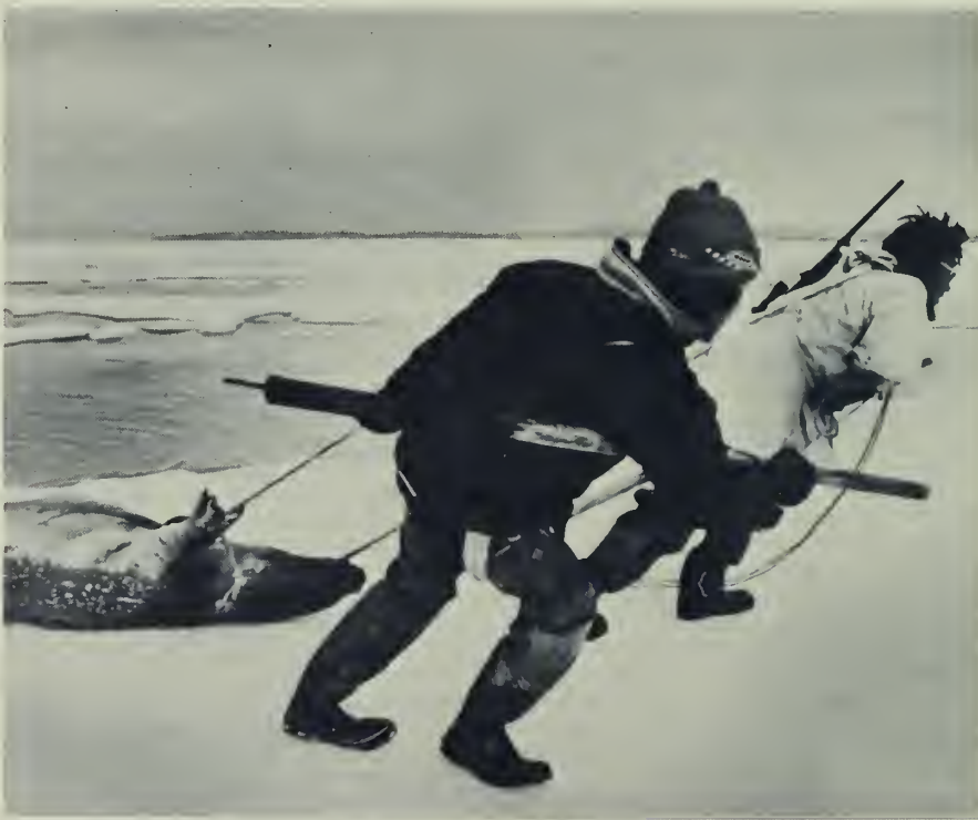
Eskimo hunters haul a seal kill in Cape Krusenstern National Monument, Alaska. The new area would permit subsistence use of renewable resources needed for human life.

A considerable amount of my time is spent questioning what it means to live in rural Alaska and to have a heritage which is reflected in one's daily life ways. I recently uncovered an old picture of Athabascan Indians gathered at a historic site near Arctic Village. The picture had particular meaning because I knew many of the people and had heard stories about the site. They were children when the