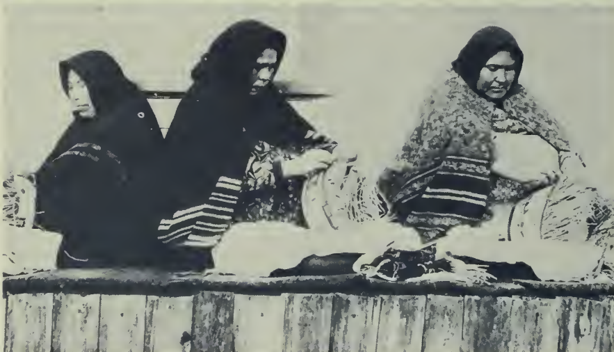
Top: Iconostasis, Second Floor Chapel, Russian Bishop's House. Bottom: Three women weaving baskets.

Size is often no measure of cultural diversity. Consider 108-acre Sitka National Historical Park which administers a variety of sites that include an 1804 Indian fort, totem poles dating from before the 1890's, and an 1842 Russian structure built for the Bishop of Kamchatka, the Kurile Islands and Alaska. A variety of Native, European, and American artifacts fill the gaps in between. Settled by the Kiksadiclan of the Tlingit Indians, captured and colonized by the Russians, and occupied by the United States, Sitka has inherited a rich cultural milieu.