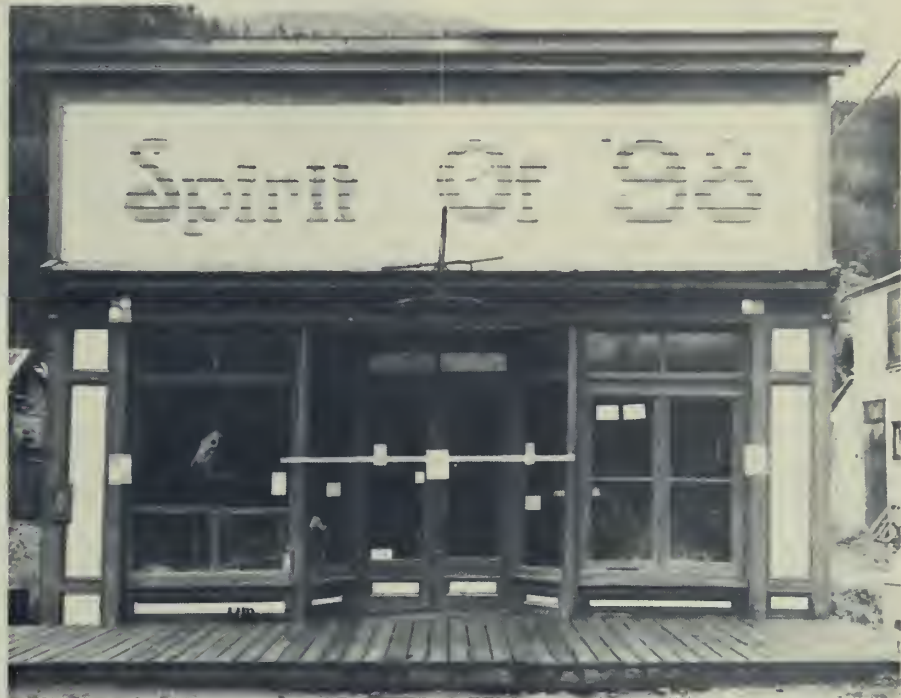
Brackett's Trading Post as seen today. Skagway, Alaska.