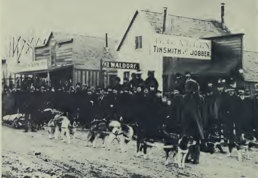
Brackett's Trading Post in December, 1897.

Endings, however, tend to become beginnings. Historic photographs uncovered for the property owner adjacent to the Ganty and Frandson grocery revealed a surprise, an ignored December 1897 photograph which showed the grocery as the Brackett Trading Post. Things began to click--Brackett's father built the town's significant toll road, Alaska's first; he also built an outfitter's store in October, 1897, but failing to clear title, moved out. This building became our bakery and grocery. As Brackett's Trading Post, its significance rose.