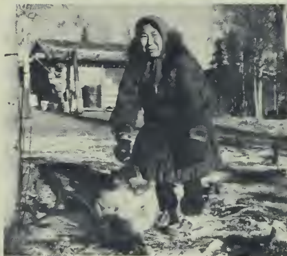
Top: Eskimo woman trimming seal intestines. Bottom: Eskimo woman butchering caribou along Kobuk River.

held that local natives should be involved in management of parks and their resources.