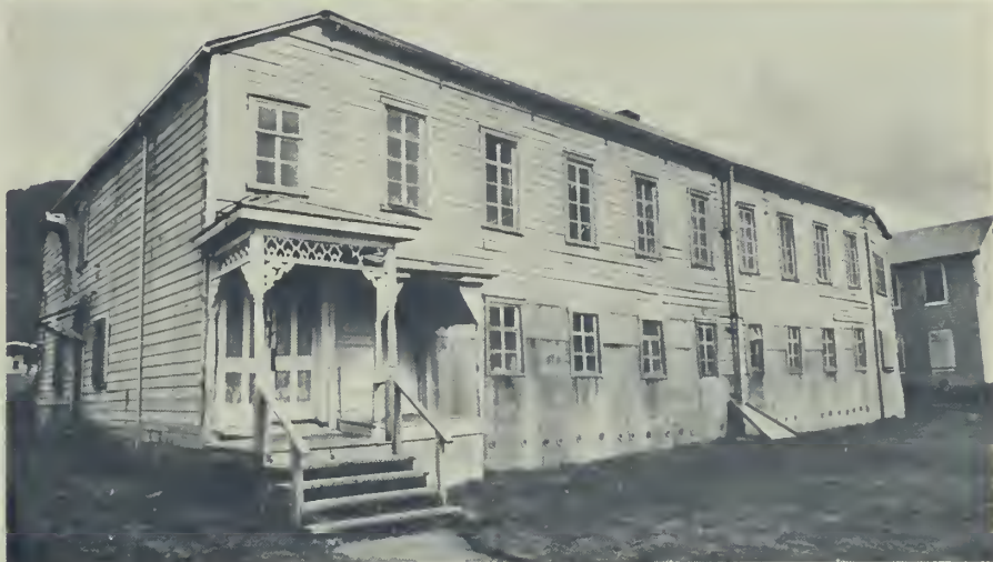
Top: Russian Bishop's House, 1895. Note the priest with the two children on the porch. Bottom: Pre-restoration Russian Bishop's House. Note the structural changes.