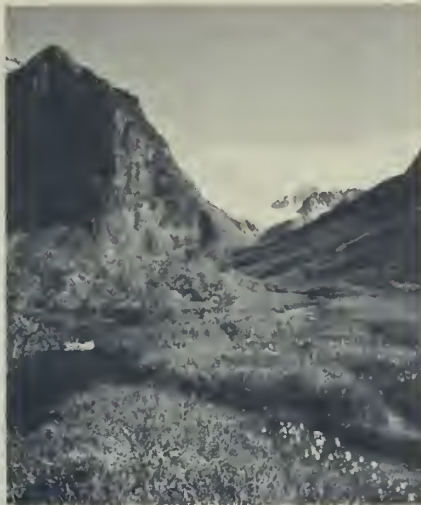
Turquoise Lake area. Lake Clark National Monument.

Both men enjoy the arctic environment as well as the skills that make