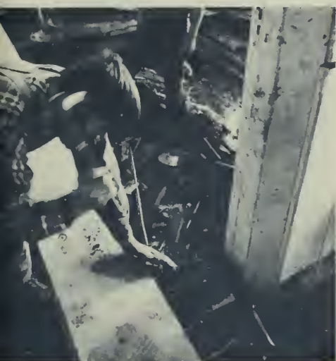
Restoration activities, Russian Bishop's House. Fog woman totem pole.