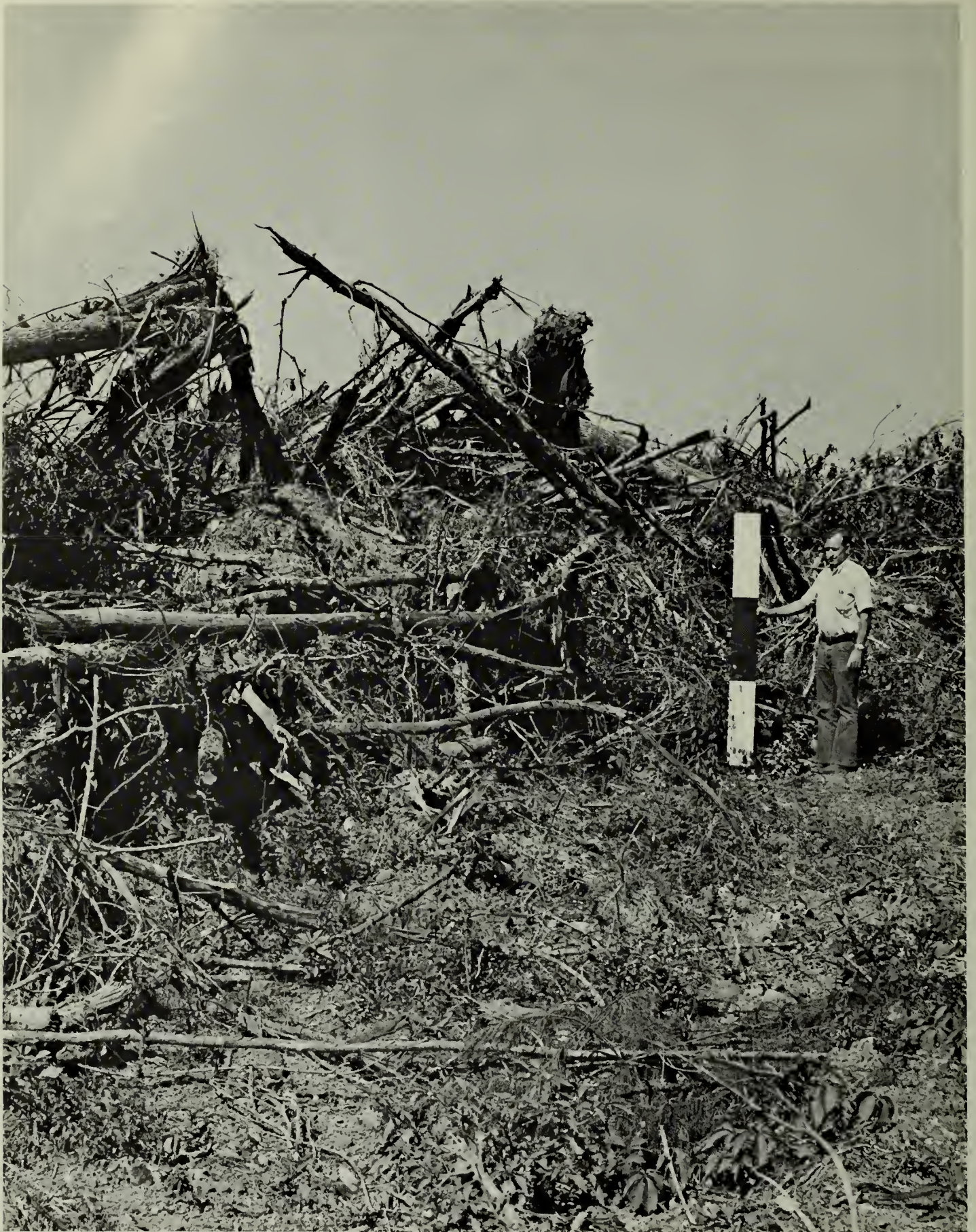
Figure 1.--Windrows of forest residues from clearcut harvesting pine-hardwood sites may contain large amounts of unmer-

chantable species that could be economically utilized during logging by whole tree chipping for fuel wood.