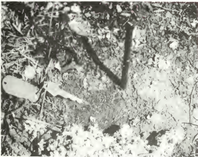
The key to converting a single pine seed, as shown in the upper photo, to an established seedling, is to prevent seed desiccation.