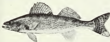
7. WALL-EYED PIKE