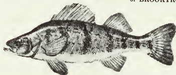
8. YELLOW PERCH