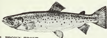
5. BROWN TROUT