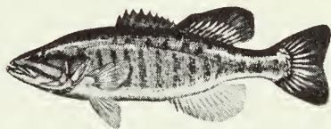
2. SMALLMOUTH BASS