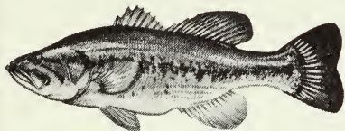
1. LARGEMOUTH BASS