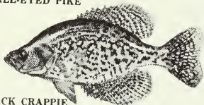
9. BLACK CRAPPIE