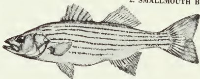
4. STRIPED BASS