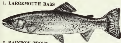
3. RAINBOW TROUT