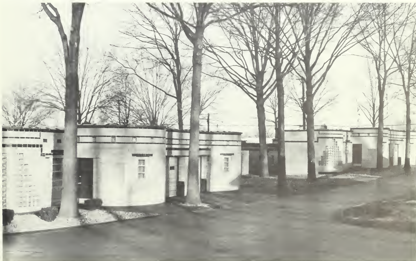
Figure 2: Coral Court Motel, Marlborough, Missouri, constructed in 1941. Architecturally, the 30 buildings of the complex represent an outstanding example of the Streamlined Moderne style of architecture. The Coral Court Motel is a rare high-style example of the motor court type of roadside lodging. Locally, the Coral Court Motel represents the increase in travel generated by the economic boom that began in 1940 with war-related production and lasted until gas rationing began in 1942.

Several such periods have been examined since the National Historic Preservation Act was passed in 1966. The 50 year period at that time did not yet include World War I. Soon after the law was passed properties related to the First World War were evaluated—but that evaluation only made sense when examined for the entire war, not on a yearly basis. Similar leaps have been involved with the “Roaring Twenties” and the Depression and the Federal government’s response to it. During the past 20 years we have been able to eval-