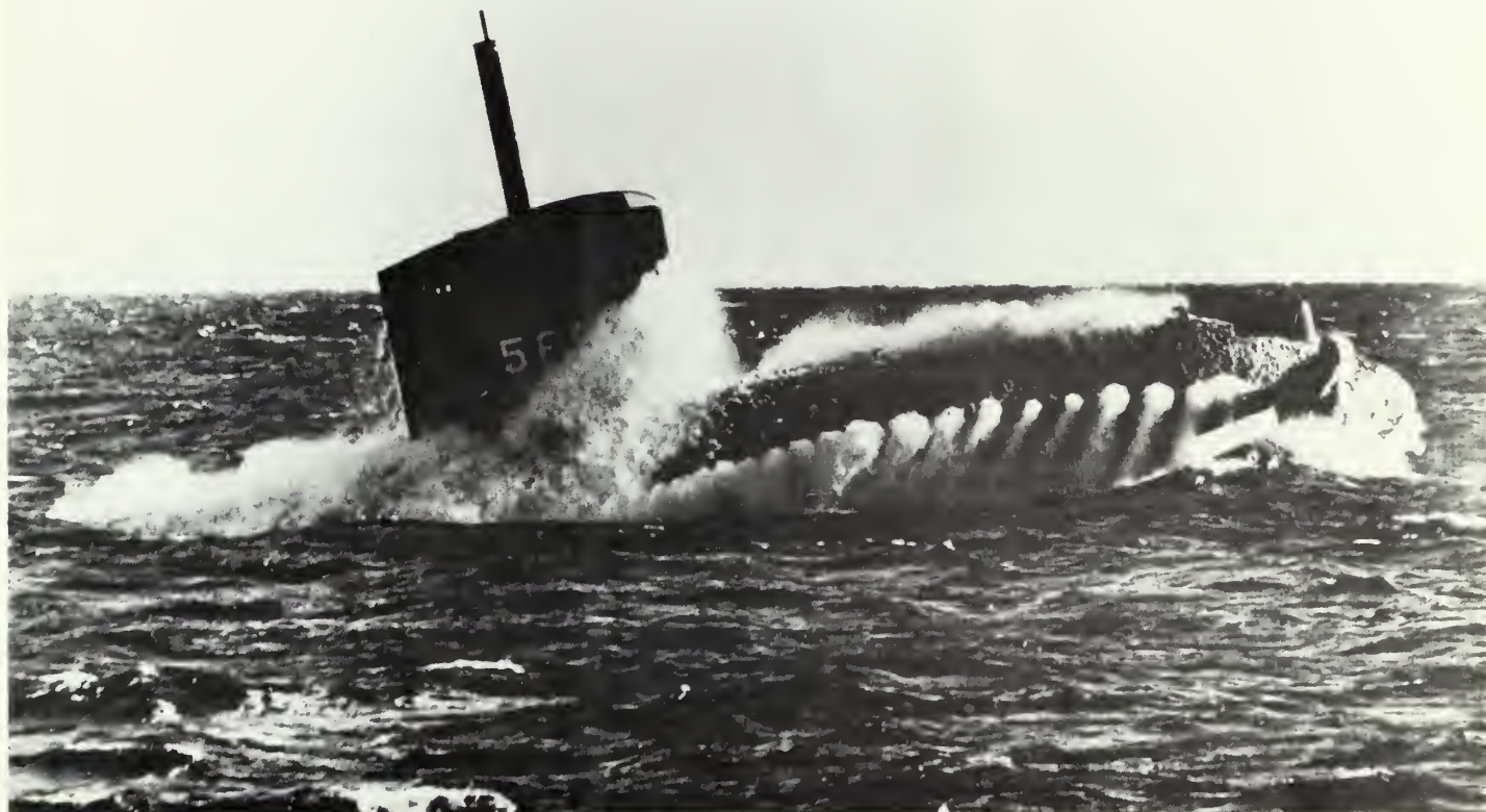
Figure 4: The USS Albacore (AGSS-569), starboard side view during high speed surfacing. The experimental diesel-electric submarine USS Albacore represents a revolution in naval architecture. Designed and constructed between 1949 and 1953, the Albacore provided the model for all future United States Navy and most foreign submarines. The hull form pioneered by the Albacore , combined with nuclear power propulsion, allowed sustained underwater performance and gave rise to the first true submarine, in which surface characteristics are subordinated to underwater performance.