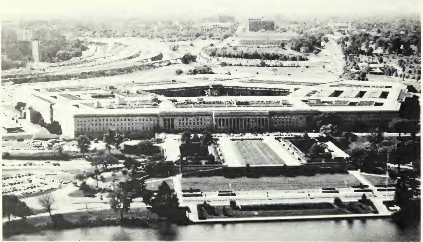
Figure 6: Pentagon Office Building Complex, Arlington, Virginia. Constructed between August 1941, and January 1943, the Pentagon is exceptionally important for its association with the development of the modern American military establishment, as the location of major decisions regarding military affairs from World War II onward, as the international symbol of American military might, and for its significance as the most monumental example of the Federal government's Stripped Classical style of architecture..

played an exceptionally important role in the development of American college sports. The Shelley House in St. Louis, Missouri, is associated with an exceptionally important court case in the U.S. Supreme Court's civil rights decisions. And several church buildings, including the Sixteenth Street Baptist Church in Birmingham, Alabama, have been recognized for their association with the Civil Rights movement in the 1960s.