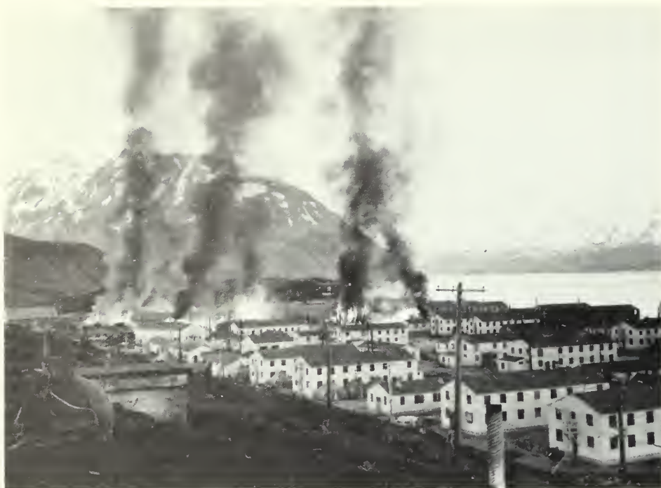
Figure 3: Margaret Bay Cantonment, Fort Mears, Amaknak Island, Alaska, following the Japanese air attack of June 3, 1942. The naval air station at Dutch Harbor and the adjacent army post, Fort Mears, were the only defenses that the United States possessed in the entire Aleutian Islands at the start of World War II. On June 3 and 4, 1942, Japanese carrier aircraft made a two-day attack on Amaknak Island, the most serious air raid on North American territory during the war. (Photo credit: National Archives).

uate and list properties, in many categories, constructed or achieving significance during those years, including: Federal projects during the Depression, the development of air transportation, Art Deco and the International styles of architecture, scientific advances, and sites related to numerous political and social events and individuals. There is now sufficient perspective to enable an evaluation of many properties related to the Second World War.