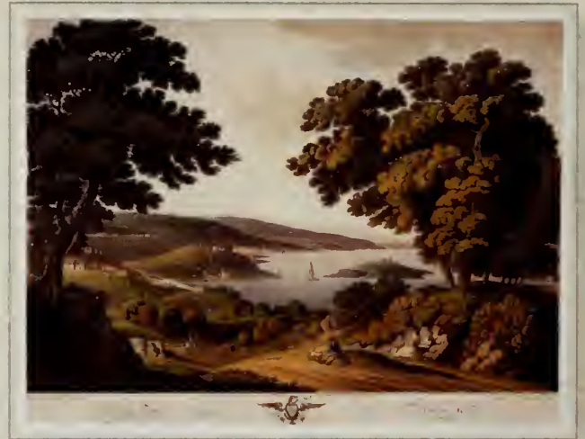
City of Washington, 1801

tion members along the way. Between November and December 1803, the growing team traveled up the Mississippi River to Wood River, Illinois north of St. Louis and across from the mouth of the Missouri River where they established winter quarters at Camp Dubois.