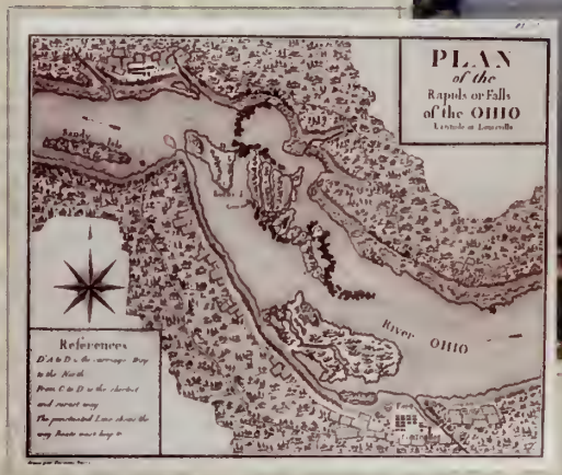
Above: Falls of the Ohio