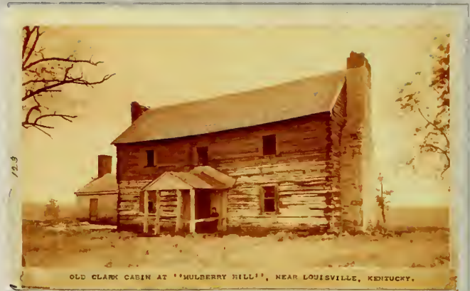
Clark Cabin near Louisville, Kentucky

3. It must have significant potential for public recreational use or historical interest based on historic interpretation and appreciation.