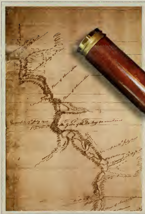
Lewis and Clark Map

As early as 1783, Thomas Jefferson had considered exploring western North America. Following Jefferson's election as president, it is generally believed that his appointment of Meriwether Lewis as his private secretary in 1801 was to prepare Lewis for an exploratory expedition across the continent. After Jefferson sent a secret message to Congress in early 1803 asking for an appropriation of $2,500 to pay for an expedition up the Missouri River "for the purpose of extending the external commerce of the United States," Lewis began preparing for the trip, studying navigation, surveying, botany, paleontology, mathematics, field medicine, while at the same time assembling and fabricating the necessary supplies in several