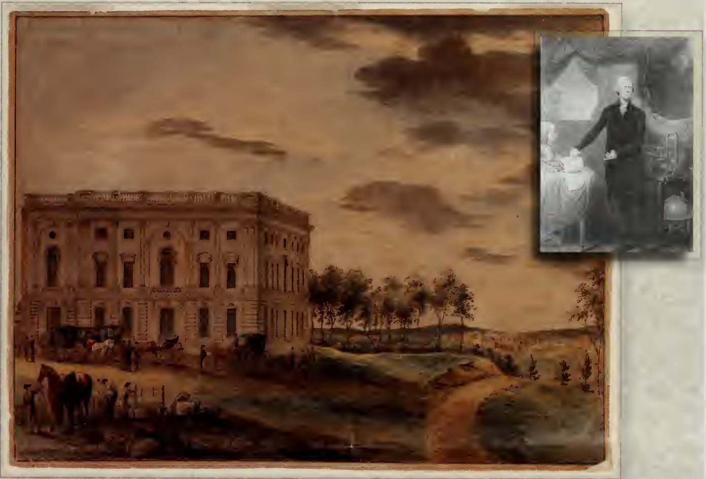
Above: Capitol Building in Washington, 1800 Inset: President Jefferson, 1801

The journals were officially published in 1814, nearly 8 years after the completion of the expedition. Clark died in 1838 and is buried in St. Louis, Missouri.