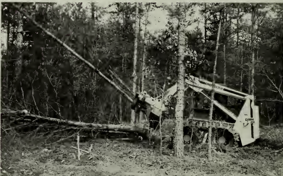
All woody vegetation on a site can be removed with the relatively new feller-buncher.

In the Southeast, leaching of nitrogen even from recently harvested forest stands is quite low. Increased soil moisture and temperature resulting from harvesting causes an increased rate of decomposition. However, the favorable climate in the Southeast permits rapid revegetation by vines, woody sprouts and seedlings, and herbaceous plants that effect immediate nutrient uptake. The green area in the center of the cover photo illustrates vegetative cover just 6 months after harvesting all woody biomass from one of our research plots: the foreground is a similar plot immediately after harvest.