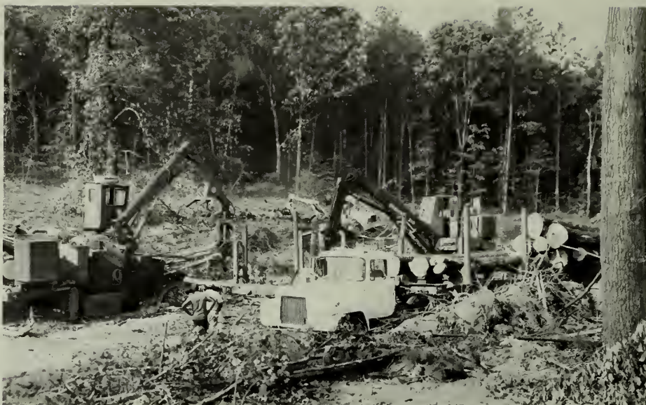
Whole-tree chippers provide the capacity to use previously unmerchantable material.

In a given region the absolute amount of nutrients in the aboveground biomass is also typically greater for hardwoods than for pines. The oak/hickory data in Table 2 are from Tennessee and the other two data sets (loblolly pine and oak/hickory/maple) are from North Carolina. These comparisons do not suggest that establishing and harvesting hardwoods will necessarily remove more nutrients than establishing and harvesting pines on the same site. Pines usually become established following some major soil disturbance and hardwoods follow pines in the natural succession of forest species. Therefore, sites naturally occupied by