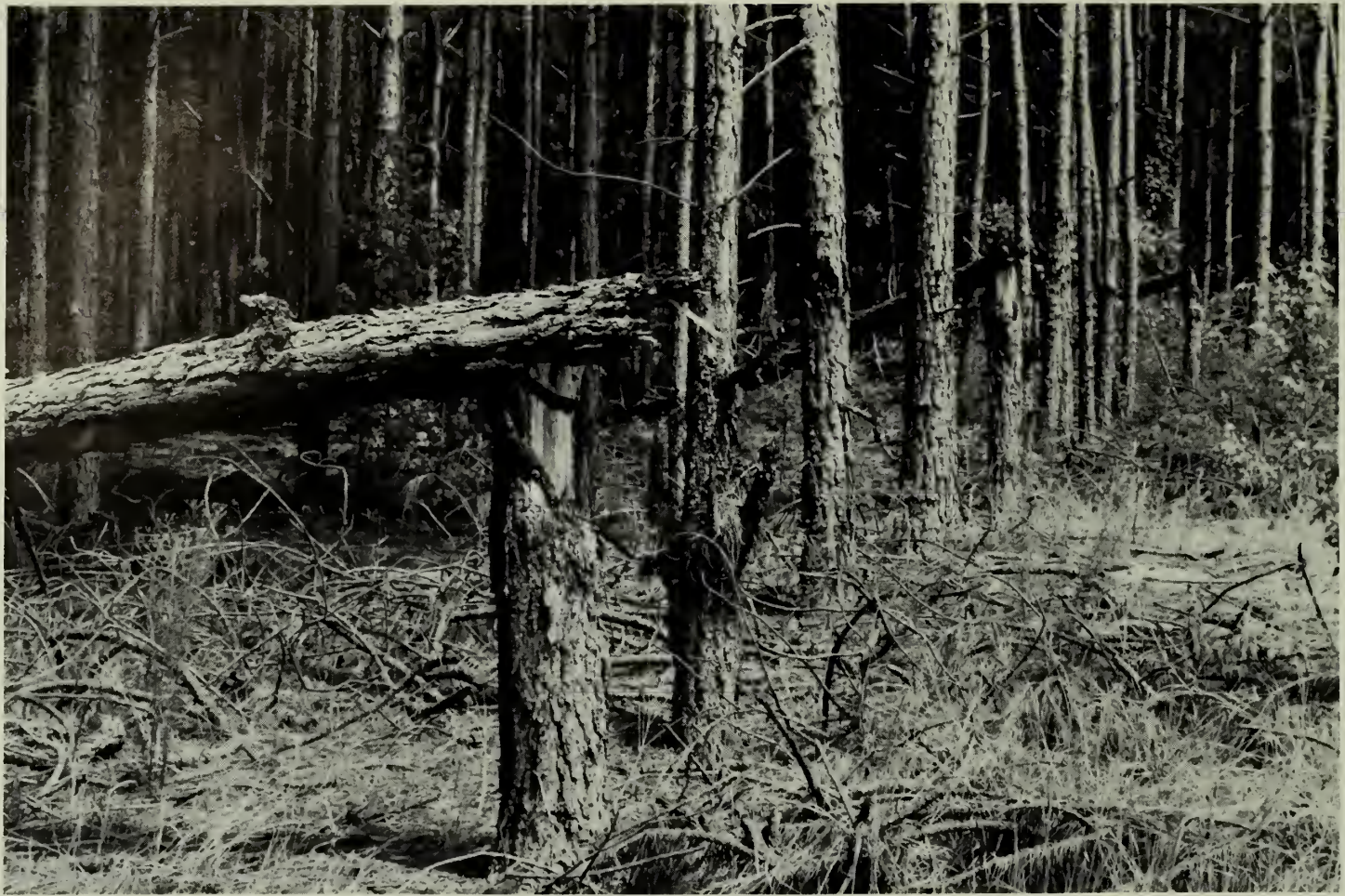
Slash pine plantation adjacent to rust resistant orchard showing breakage at rust galls. Rust infection is over 85%.