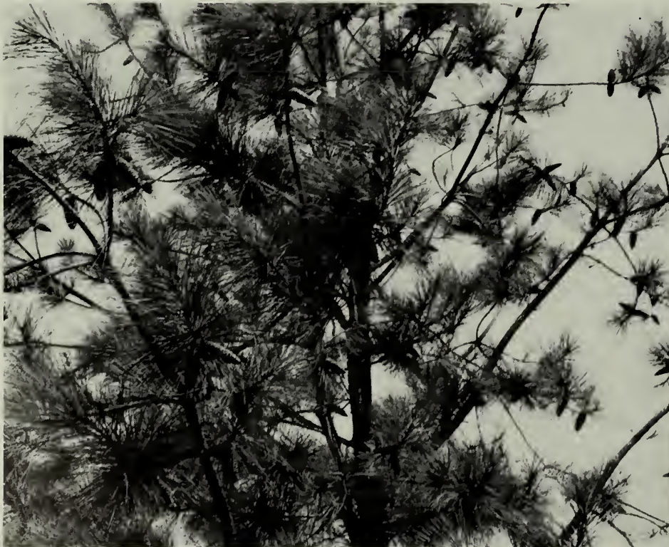
Good cone crop on rust resistant grafted loblolly pine.

seedlings from other rust resistant seed sources. Resistance was compared by greenhouse inoculation tests. Results of inoculation tests of this type have been closely correlated with field performance in several research studies (Dinus and Hare, 1974, Miller and Powers, 1983, Powers and Kraus, 1983). Included in the test were not only the seedlings produced from the GFC-USFS clonal and seedling seed orchard, but seedlings from most of the rust-resistant seed sources available to forest managers in the South today.