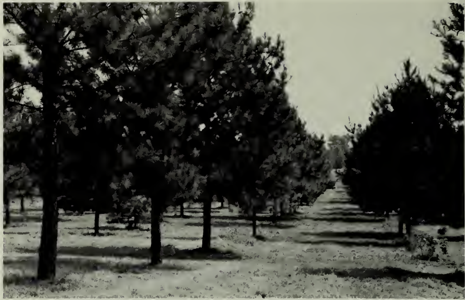
Eight year old grafted rust-resistant loblolly pines in clonal orchard.

One of the largest of these efforts is the cooperative program by the Georgia Forestry Commission and the USDA Forest Service (GFC-USFS). Work in this program began in the 1960's, and by 1975 enough individual trees with high rust resistance were available to begin establishment of a rust-resistant seed orchard. Selections for the orchard came from many sources, but most were from the GFC-USFS program itself. Each tree included in the orchard was a second-generation selection from 5- to 10-year-old progeny tests. These selections were all from families with better than average growth and yield, as well as