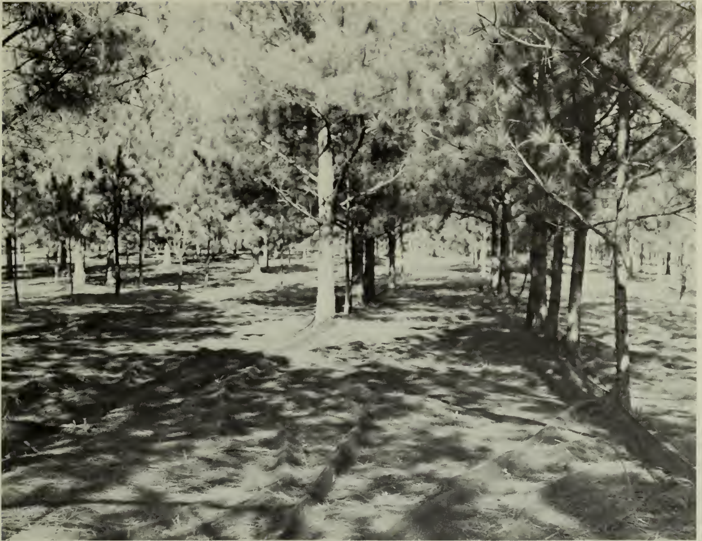
Fabric is shown ready for the collection of cones.