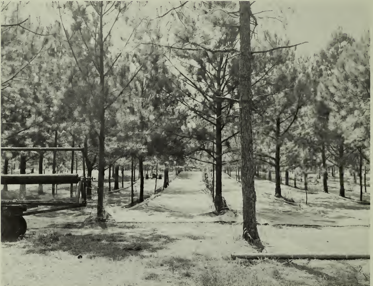
Fabric is shown on the ground and in place under the trees in center and at right. The tractor in the distance is pulling the fabric from the machine that will reroll the material. The fabric machine is powered by a power take off (PTO) shaft from tractor.

Obviously, the GFC had to find a new approach to seed collections for loblolly, and there were few precedents to guide us. The North Carolina Cooperative Program was working on a seed vacuum harvester, but results then did not suggest it was feasible for immediate large-scale operation. We decided to try using a ground cloth, or net.