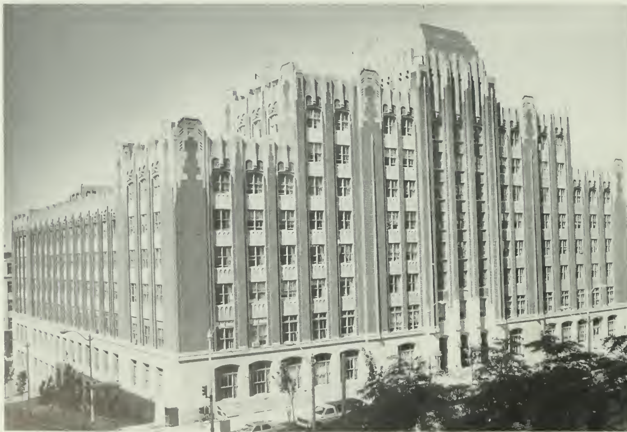
Federal Office Building, Seattle, Washington, 1932-33. In addition to being the city's first building designed especially for Federal offices, this was one of the first Modernistic-styled buildings designed by the Office of the Supervising Architect of the Treasury Department. The innovative use of cast aluminum spandrel panels beneath the windows was the first extensive use of aluminum on the West Coast. Much of the interior Art Deco ornamentation remains intact. (John Kvapil)