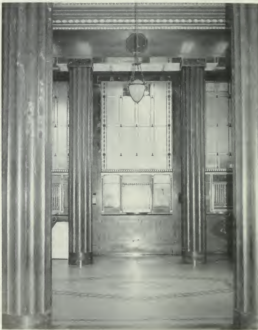
Knoxville Post Office, Knoxville, Tennessee, 1932-33. Sometimes the interior of a building may be as significant or more significant than its exterior. The Knoxville Post Office displays elaborate Art Deco detailing in its lobby, which is one of the most significant interior spaces in the city. (Thomason and Associates)