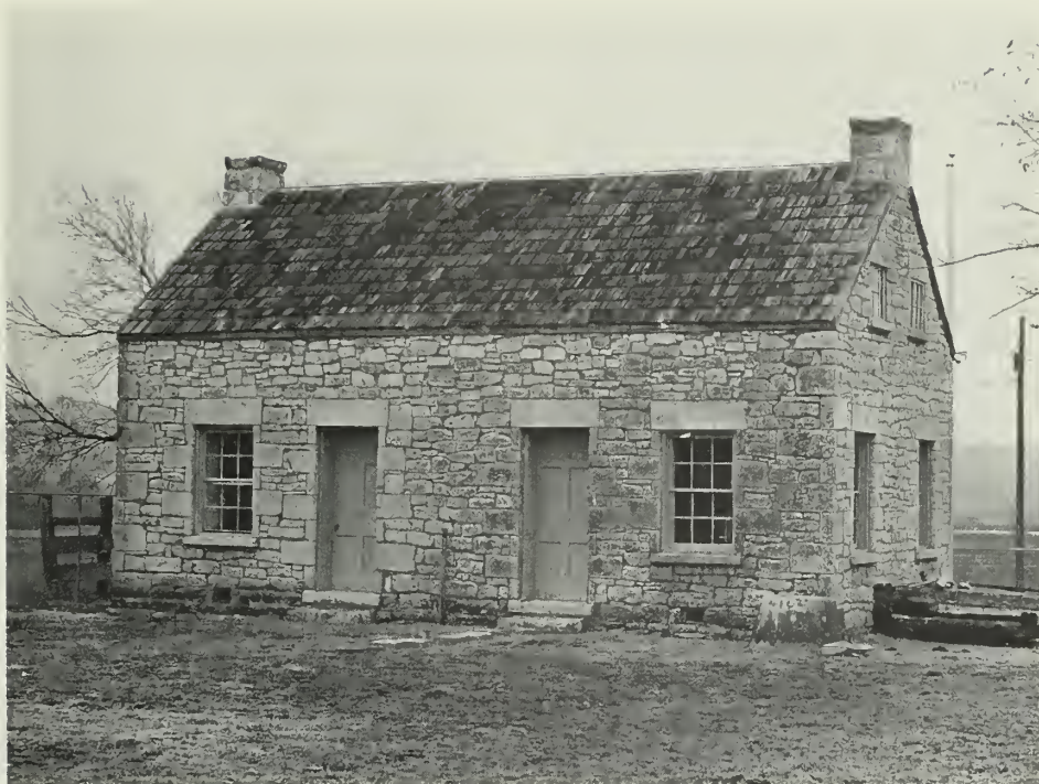
Copperas Cove Stagestop and Post Office, Copperas Cove vicinity, Texas, 1878. This fine example of vernacular stone construction in Texas is the only surviving structure from the original town of Copperas Cove. It served many functions, beginning as a stage relay station and post office.

companies. Postal savings banks were authorized in 1910 in order to encourage thrift, increase the amount of money in circulation, and provide security, especially for those without access to banks. They became particularly popular during the Great Depression of the 1930s, when the government inspired greater confidence than private financial institutions.