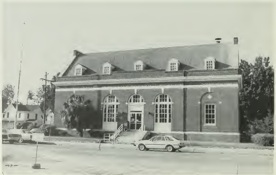
Jennings Post Office, Jennings, Louisiana, 1915. Representing a degree of stylistic sophistication unexpected in a small town in rural Louisiana as early as 1915, the Jennings Post Office is noted for its progressive design in a commercial center otherwise characterized by more modest vernacular buildings. (Jonathan Fricker)

The first step in evaluating a potential historic property is to identify the type, functions, and history of the property being considered. The basic information to obtain for a post office, which falls into the National Register category "building," includes dates of