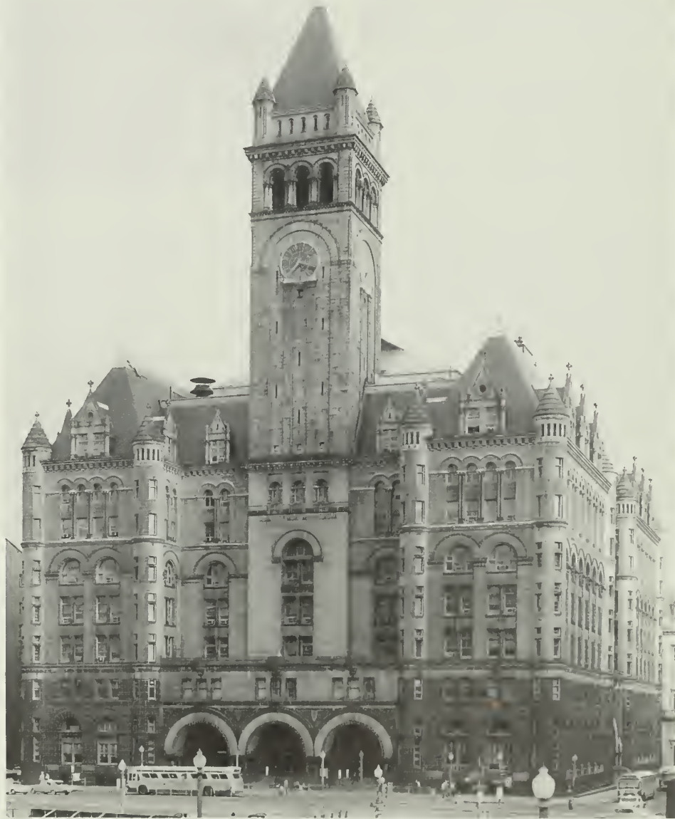
Old Post Office and Clock Tower, District of Columbia, 1891-99. One of Washington's few Romanesque Revival Buildings on a monumental scale, this was the city's third tallest building when completed, exceeded only by the Capitol and the Washington Monument. The Old Post Office was the first Federal building erected in the area now known as the Federal Triangle. It served as headquarters for every Postmaster General from 1899 to 1934. (William Edmund Barrett)

Post offices are important examples of this type of property. In order to facilitate the evaluation and nomination of post offices, the National Park Service conducted a study of various factors in the establishment, role, and design of post offices in order to establish a consistent policy for applying the National Register Criteria for Evaluation to these buildings. The study focused on the history of post offices prior to 1939 to accommodate the impact of major Federal programs of the Depression. The following guidance for evaluating the significance of post offices using the National Register Criteria resulted from this study. This second edition of National Register Bulletin 13 also looks at post offices built after World War II. This publication is intended to assist anyone in the evaluation of the eligibility of post offices for inclusion in the National Register, and to suggest an appropriate approach for evaluating other similar resources.