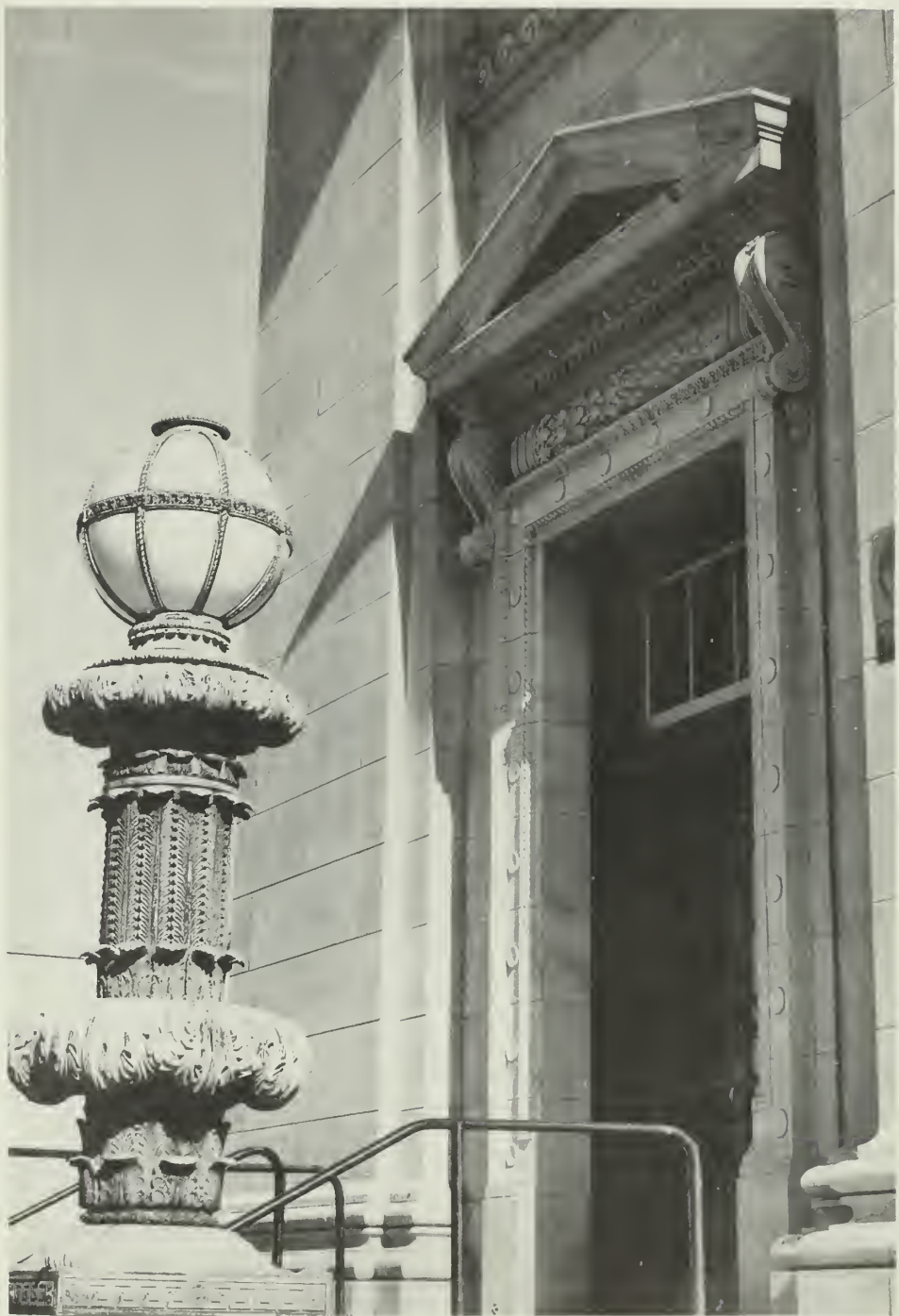
United States Post Office, Des Moines, Iowa, ca. 1908-12. The architectural significance of a building is often illustrated through a collection of rich detailing. This doorway and acanthus leaf lantern are part of a post office that is one of the best examples of classical architecture in central Iowa.

In some cases, a single quality or association under one of the criteria and the retention of the most important quality of integrity may be sufficient to demonstrate that the post office is eligible for the National Register. When the quality or qualities of significance, or the significance of themes, are weaker, however, a combination of characteristics may be necessary to justify eligibility. In marginal cases, it is necessary to compare the post office's qualities of significance and integrity to those of other properties within the same themes to decide which property or properties best represent the significant themes. The post office may or may not surface as the best or one of the best examples of a theme. In some cases, a survey conducted to identify these properties for comparison may reveal a related group of post offices, or post offices and other properties, all of which meet National Register Criteria. If the post office is the only identified property in its theme, that will strengthen the case for listing in the National Register, but there may be instances where a post office that is the only surviving representative of an important theme fails to possess a strong enough justification of significance or sufficient integrity to meet National Register Criteria. If a post office is determined not to be individually eligible for the National Register, it may still be eligible as part of an historic district that qualifies for listing. 15