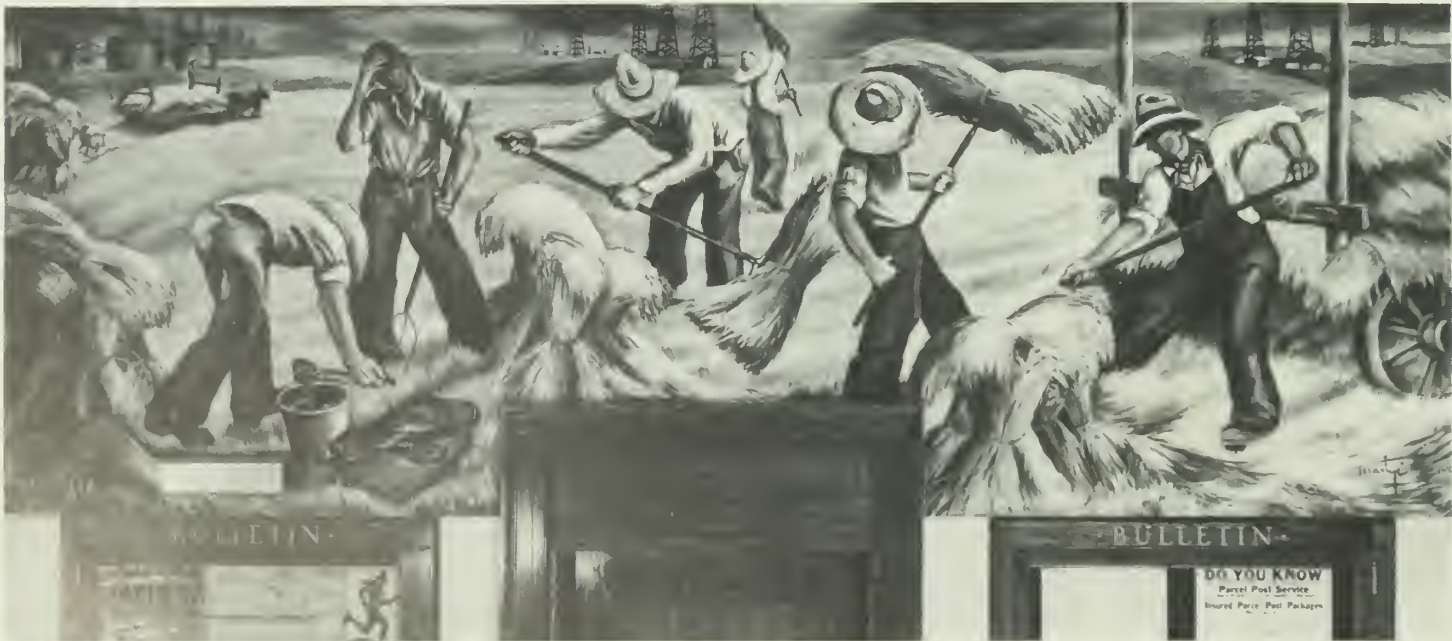
Russell United States Post Office, Russell, Kansas, 1939-1940. The artwork in the Russell post office dramatically depicts the Kansas landscape. "Wheat Workers," an oil on canvas mural, is exceptionally significant at the local and State levels for its historical association with the U.S. Treasury Department's Section of Fine Arts program and for its high degree of physical integrity.