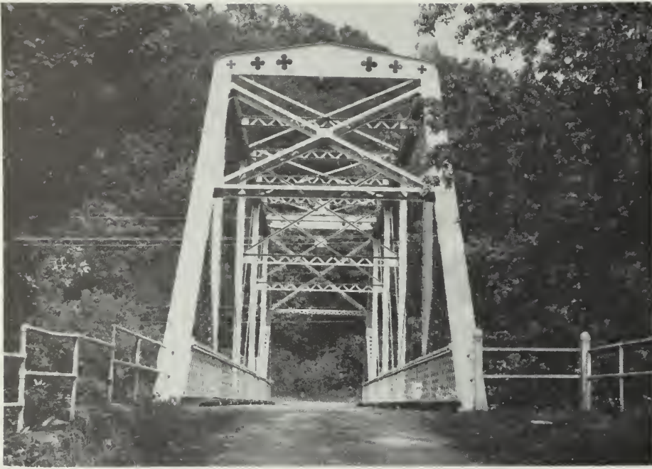
The 1898 Birmingham Bridge was nominated to the National Register of Historic Places as part of the Industrial Resources of Huntingdon County, Pennsylvania multiple property submission. Located in Birmingham, it is significant as "a fine example of one of the county's less than ten remaining pin-connected Pratt through truss bridges built in the late 1800s." (Nancy Shedd )

For properties significant under Criterion C, summarize the following: