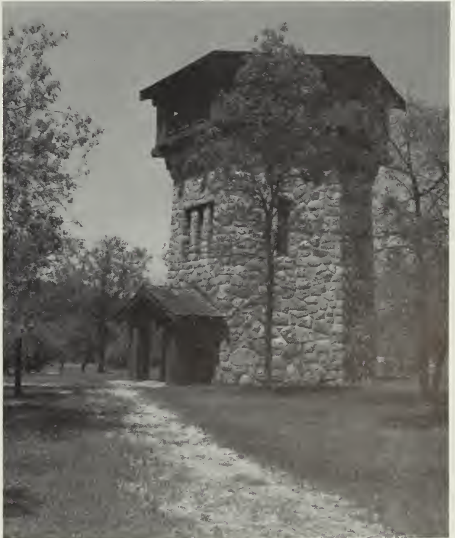
The 1939 water tower is a contributing building in the National Register of Historic Places nomination of Lake Bronson State Park in Kittson County, Minnesota. The eligibility of the park was justified for its association with the Minnesota State Park CCC/WPA/Rustic Style Historic Resources multiple property submission. The historic resources of Lake Bronson State Park are significant as "outstanding examples of rustic style split stone construction." (Rolf T. Anderson)

Enter the name, title, organization, address, and daytime telephone number of the person who compiled the information contained in the documentation form. The SHPO, the FPO, or the National Park Service may contact this person if questions arise about the form or if additional information is needed.