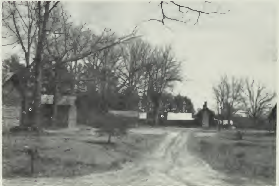
This cluster of agricultural buildings that make up the ca. 1899 Puckett Family Farm at Satterwhite, Historic and Architectural Resources of Granville County, North Carolina has been described as "one of the county's most significant bright leaf era rural properties, an intact symbol of the way most of the county's citizenry led its life from the Civil War into the 1950s." It was nominated to the National Register of Historic Places as part of the geographically-based Granville County, North Carolina multiple property submission. (Marvin A. Brown)