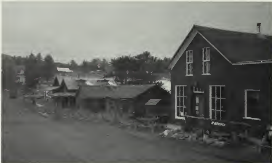
Main Street was included in the Gold Hill Historic District, a property nominated to the National Register of Historic Places as part of the Metal Mining and Tourist Era Resources of Boulder County, Colorado multiple property submission. Dating from the early 1870s, the Gold Hill Historic District is considered the most "intact representation of the early mountain communities that developed as a result of the precious metal mining in Boulder County."

Historic contexts may include those identified in the State historic preservation office comprehensive planning process. According to the Secretary of the Interior's Standards and Guidelines for Archeology and Historic Preservation , historic contexts provide information about the historical patterns and trends that produced individual properties. Historic contexts serve as the foundation for decisions about the identification, evaluation, registration, and treatment of historic properties. For further explanation of historic contexts, see discussion in section E.