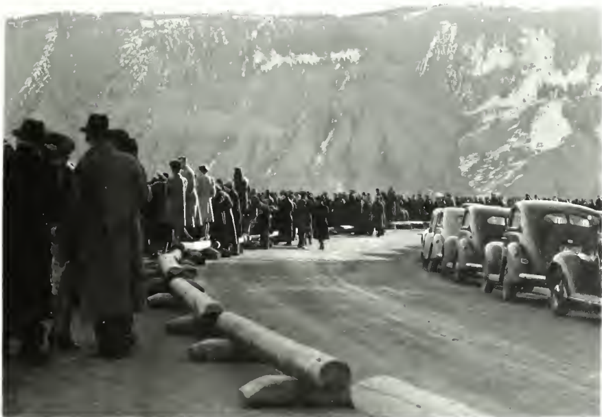
Group watching Easter Sunrise Services on the Mammoth Hot Springs Terraces, March 24, 1940