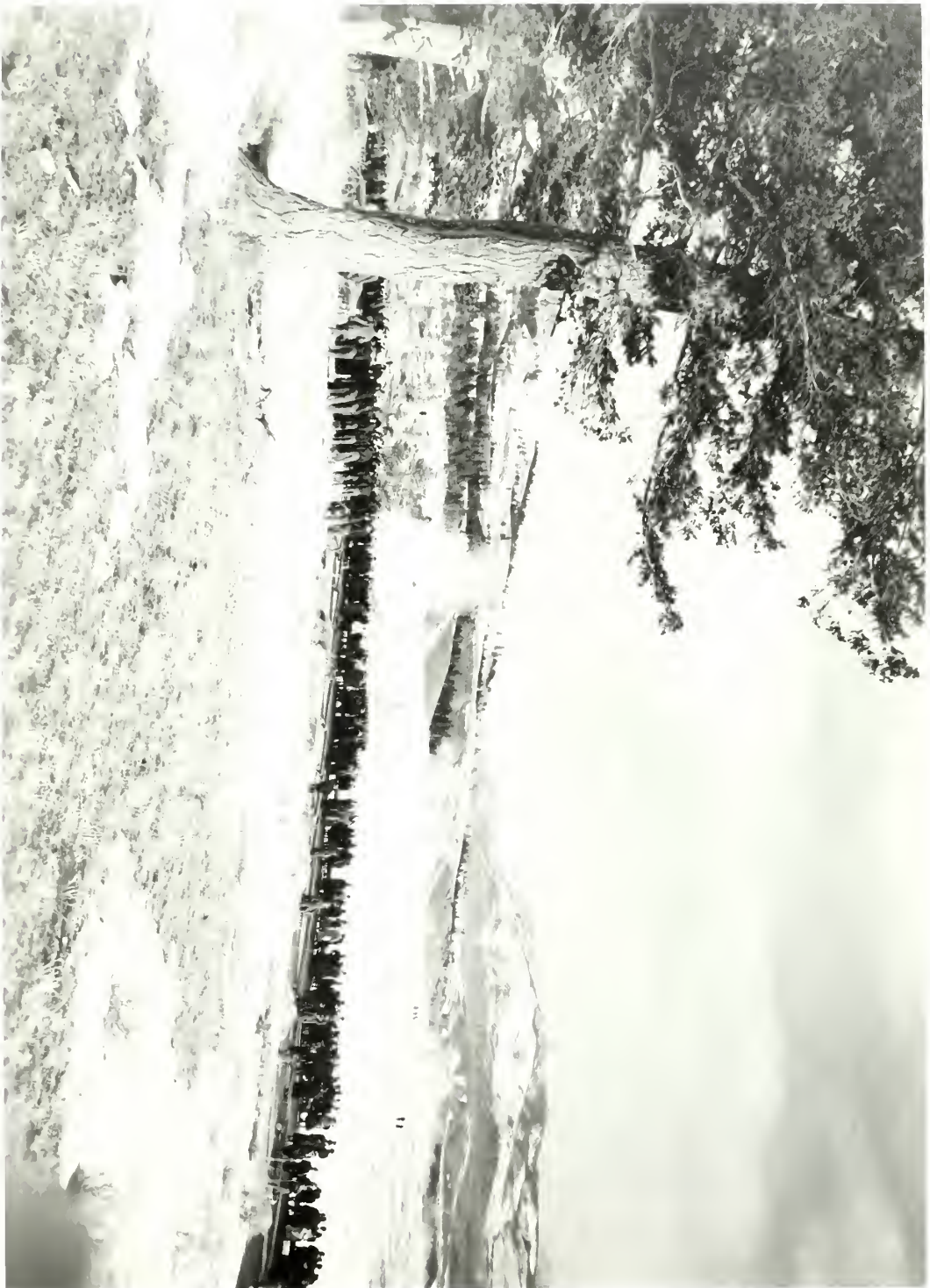
Visitors attending the Easter Sunrise Services at Mammoth Hot Springs Terraces March 24, 1940