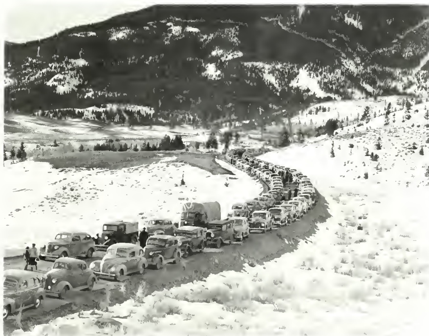
Parked Cars of visitors attending the Easter Sun- rise Services, Mammoth Hot Springs Terraces March 24, 1940