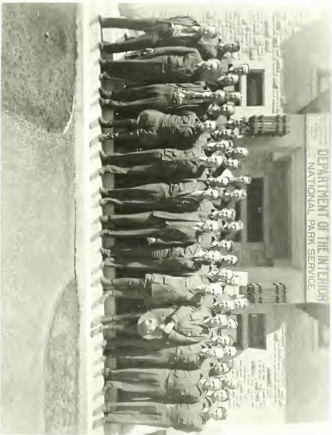
Fire Conference April 8 to 20 Inclusive