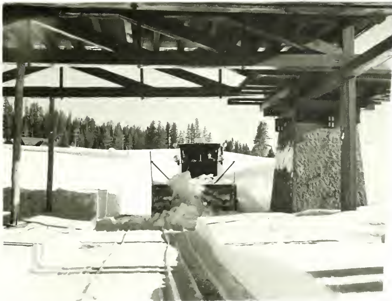
Spring road opening, Yellowstone National Park. Snow plow opening road to Canyon Hotel under porte-cochere, March, 1940.