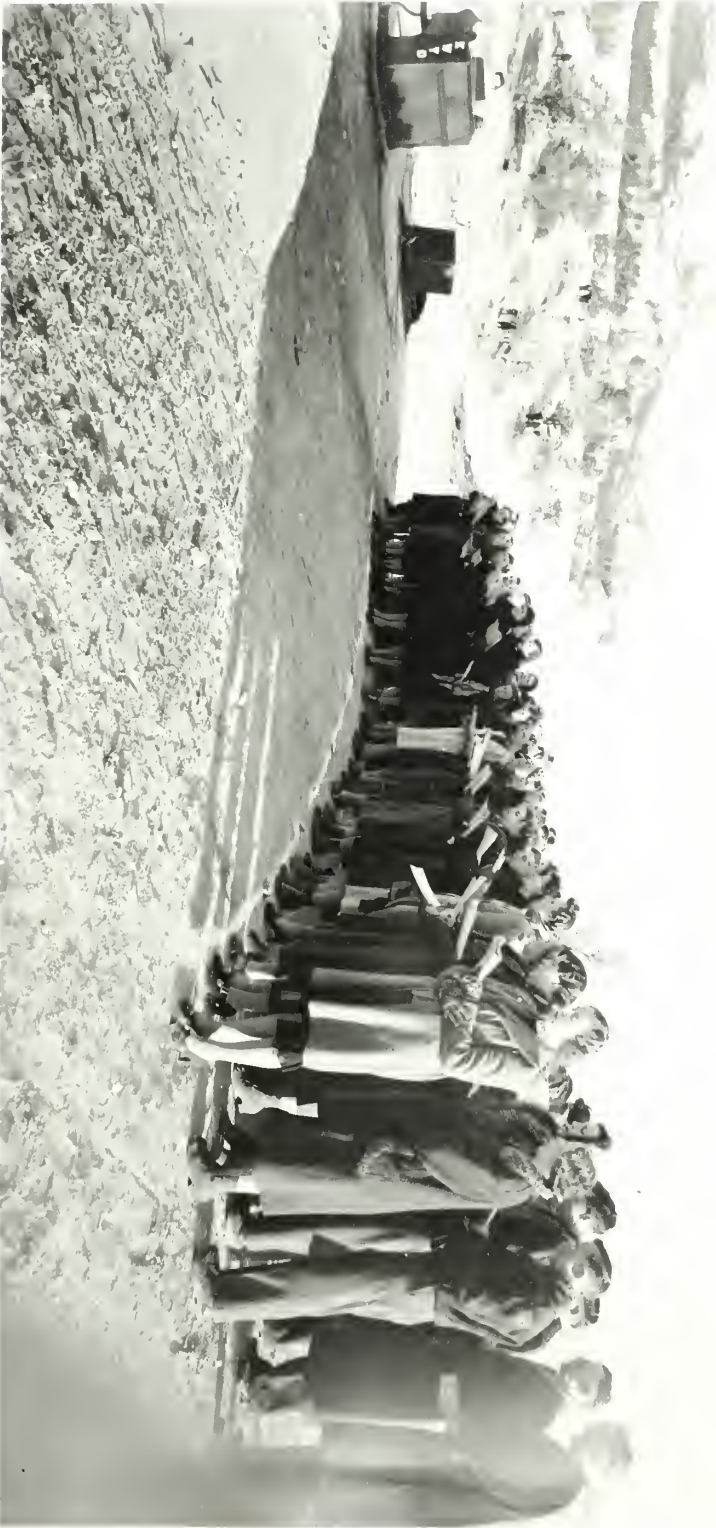
Organist and chorus at the Easter Sunrise Services on Mammoth Hot Springs Terraces March 24, 1940