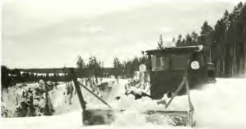
Spring road opening, Yellowstone National Park. Snowplow clearing road. Fred Clapp, March, 1946.