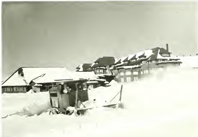
Spring road opening, Yellowstone National Park. Snow plow clearing roads in front of Canyon Hotel, March, 1940.