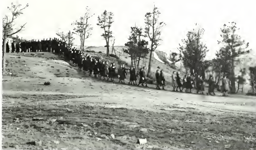
Easter Sunrise Chorus marching on to Mammoth Hot Springs Terraces March 24, 1940