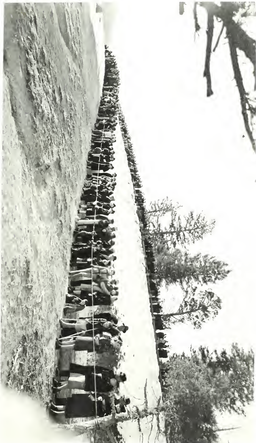
Arrangements for holding assembled visitors at the Easter Sunrise Services on Mammoth Hot Springs Terraces, March 24, 1940