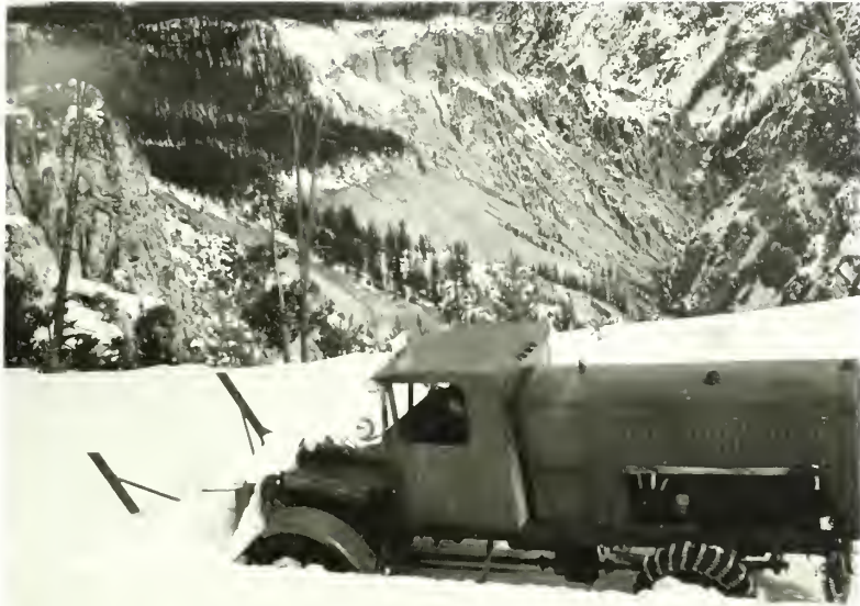
Spring road opening, Yellowstone National Park. Snowplow clearing road. Fred Clapp, March, 1946.