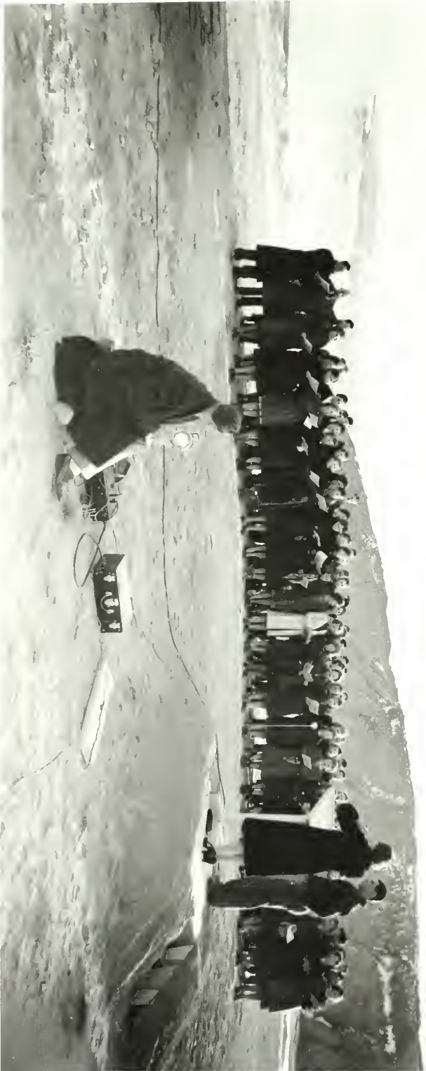
Easter Sunrise Chorus on Mammoth Hot Springs Terraces March 24, 1940