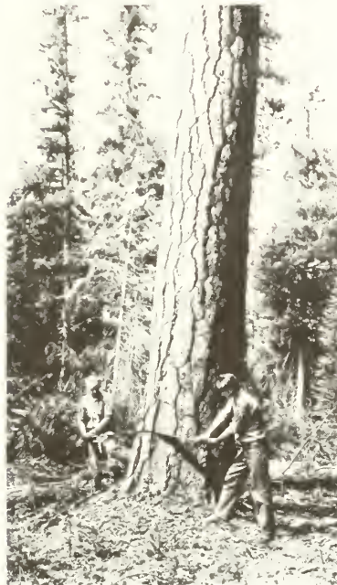
Figure 21—Several hundred large ponderosa pine infested with western pine beetle near the south entrance were also treated in 1929, Crater Lake National Park.