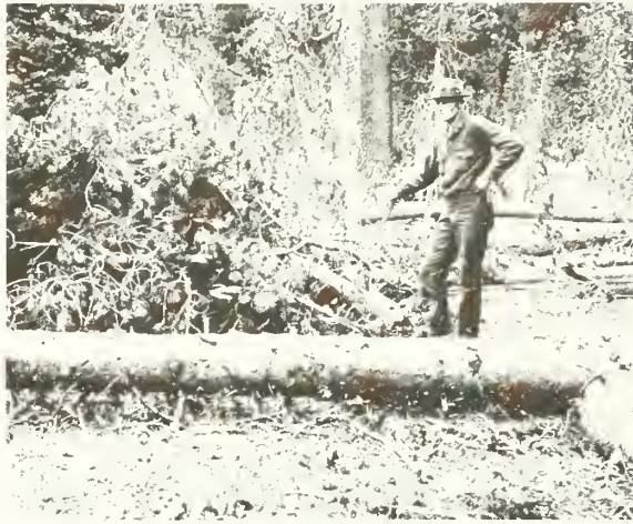
Figure 18—Lodgepole pine limbed for the sun-curing treatment. Limbs are piled to be burned when conditions are safe, ca. 1929, Crater Lake National Park.