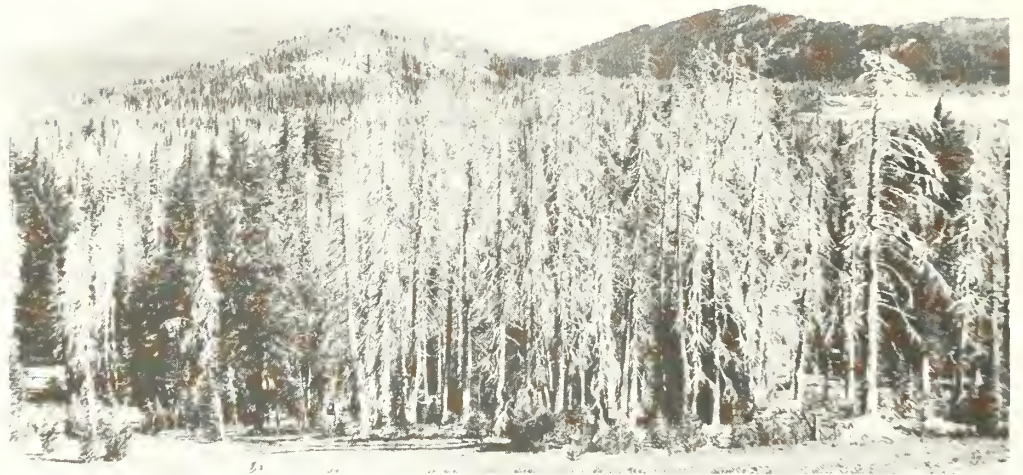
Figure 1—General view of Ghost Forest near Desert Crater. Lodgepole pine north of Crater Lake were killed by mountain pine beetle before 1924.