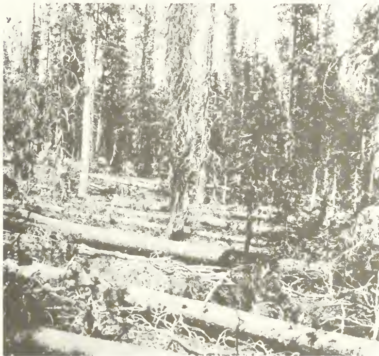
Figure 17—Typical area of beetle-treated group of 100 trees or more, 1929, Sand Creek, Forest Service project.