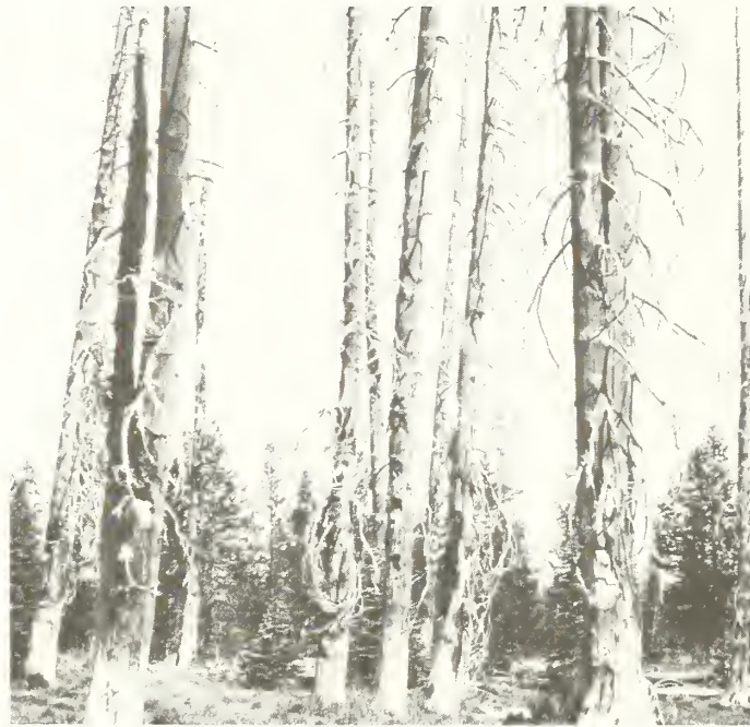
Figure 2—Dead lodgepole pine in Ghost Forest were killed before 1924.