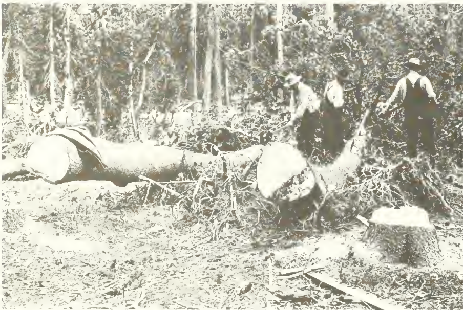
Figure 15—Preparing lodgepole pine infested with mountain pine beetle for the sun-curing (solar) treatment. Logs are limbed and topped so that direct rays of sun fall on them, Crater Lake National Park (no date).