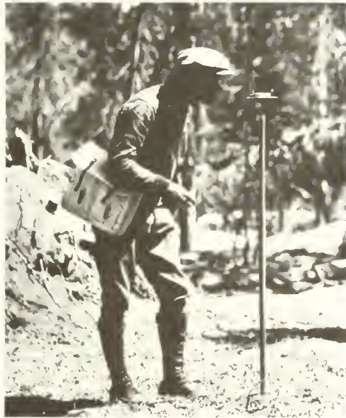
Figure 11—Unknown compassman, ca. 1929, Crater Lake National Park.