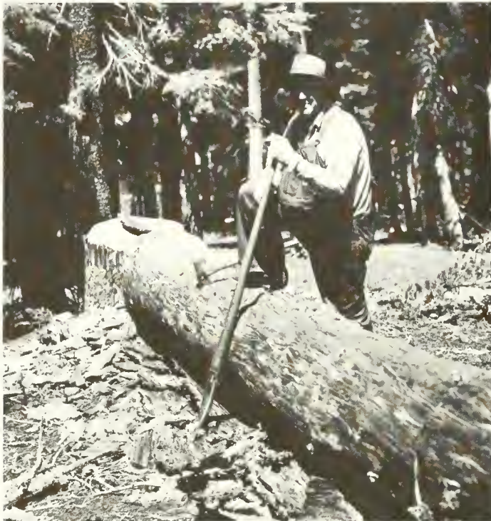
Figure 19—Another type of treatment used in shady areas was to peel the bark from the tree with a spud thus exposing the bark beetle brood and killing it, 1947, Crater Lake National Park.