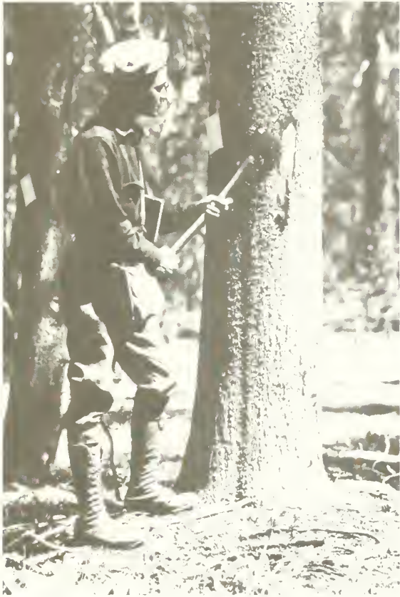
Figure 13—Spotter blazes lodgepole pine infested with bark beetles and leaves a record-keeping card on the bole for the treaters to fill out, ca. 1929, Crater Lake National Park.