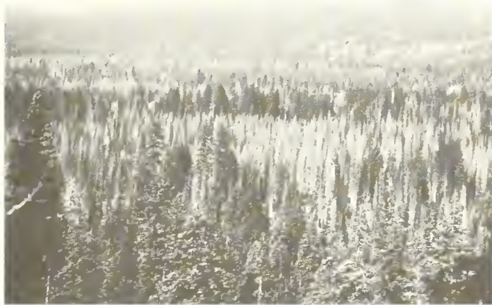
Figure 3—Lodgepole pine killed by mountain pine beetle, Castle Creek area, Crater Lake National Park, October 1930.