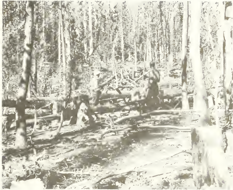
Figure 16—A patch of lodgepole pine after all the trees killed by the bark beetles are felled for sun-curing treatment, ca. 1929, Crater Lake National Park.