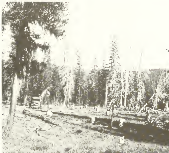
Figure 4—Area treated by sun-curing method. Crater Lake National Park, September 1934.