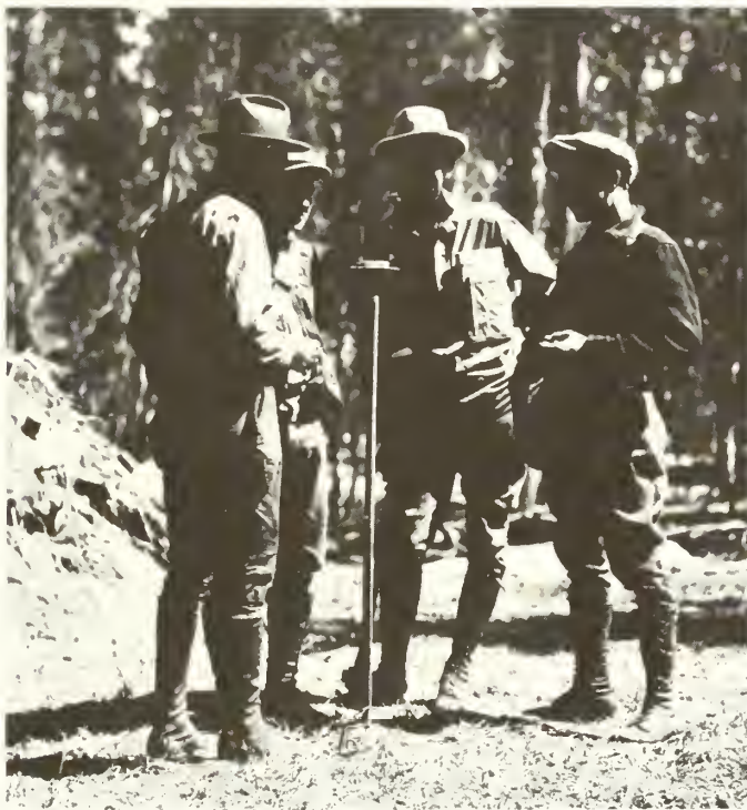
Figure 12—Compassman and tree spotters (unknown) arbitrate which way the needle is pointing, ca. 1929, Crater Lake National Park.