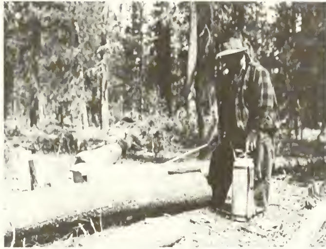
Figure 20—A chemical, Orthodichlorobenzene, in an oil solution was sprayed on the bark of lodgepole pine infested with mountain pine beetle, 1947, Crater Lake National Park.