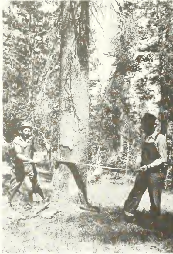
Figure 14—Treating crew falls lodgepole pine infested with bark beetles, ca. 1929, Crater Lake National Park.