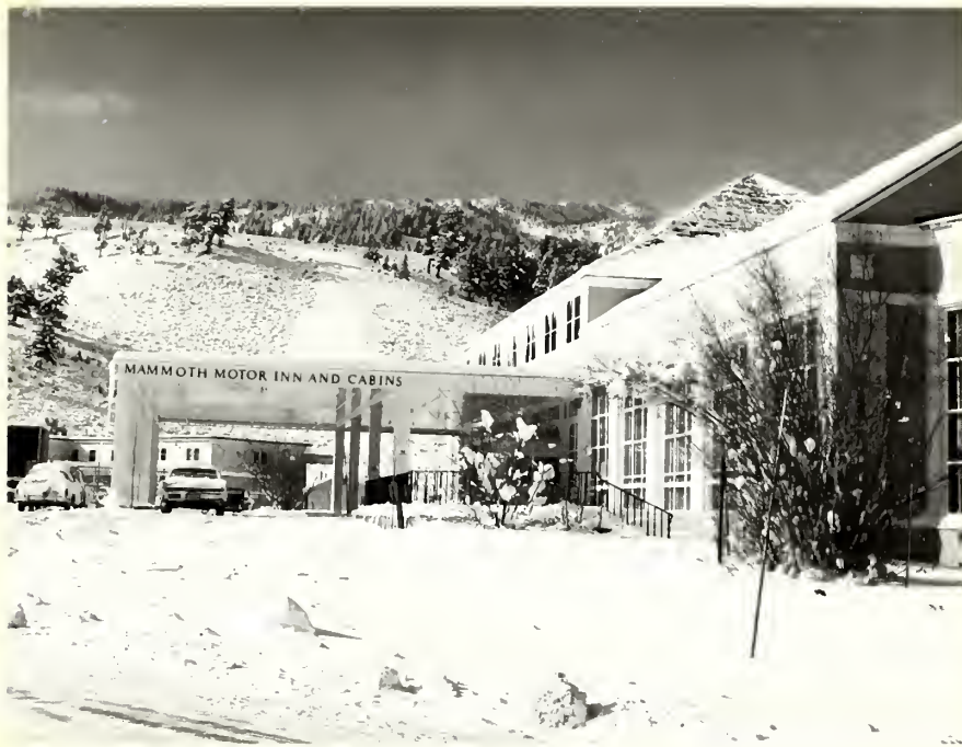
YELLOWSTONE NATIONAL PARK, WYOMING