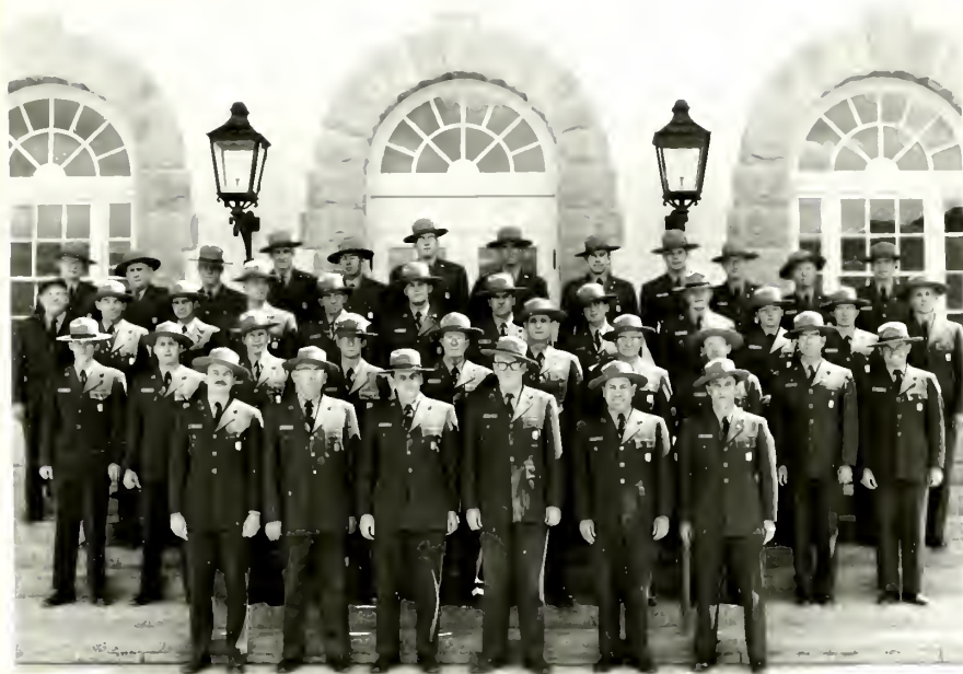
Annual Spring Ranger Conference - April 22-26, 1963