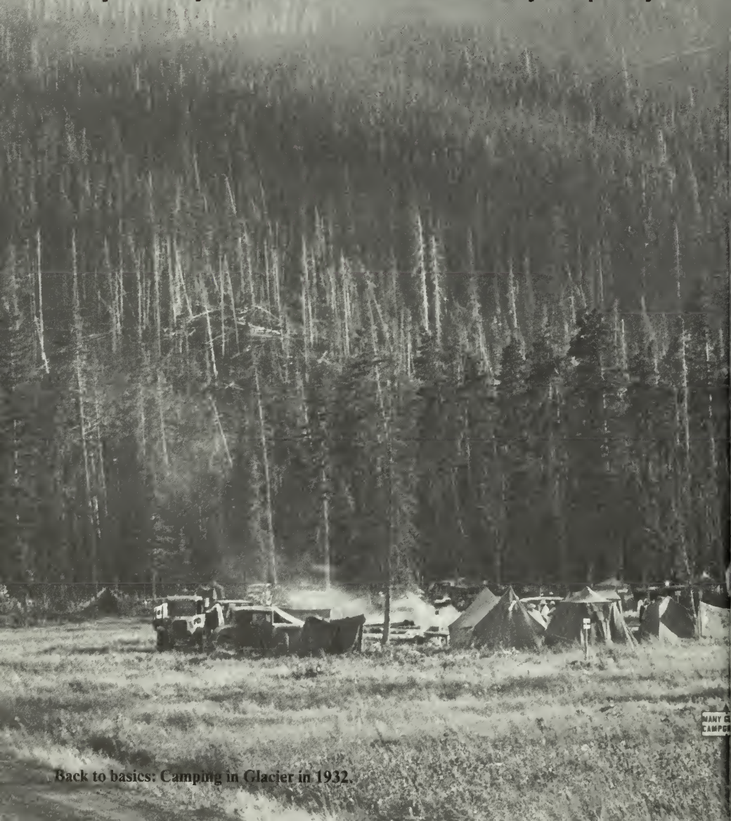
Back to basics: Camping in Glacier in 1932.

The National Park Service welcomes you to some of the world's greatest camping areas, ranging from the wooded campgrounds near the rockbound coast of Acadia National Park in Maine to those in the Chihuahuan Desert and the Rio Grande Canyon of Big Bend National Park in Texas. Whether you camp by the water at Cinnamon Bay in the Virgin Islands or deep in the rugged wilderness of the parks in Alaska, you are about to embark upon an adventure that will be memorable and rewarding. It may be that you will hike into the backcountry and pitch your