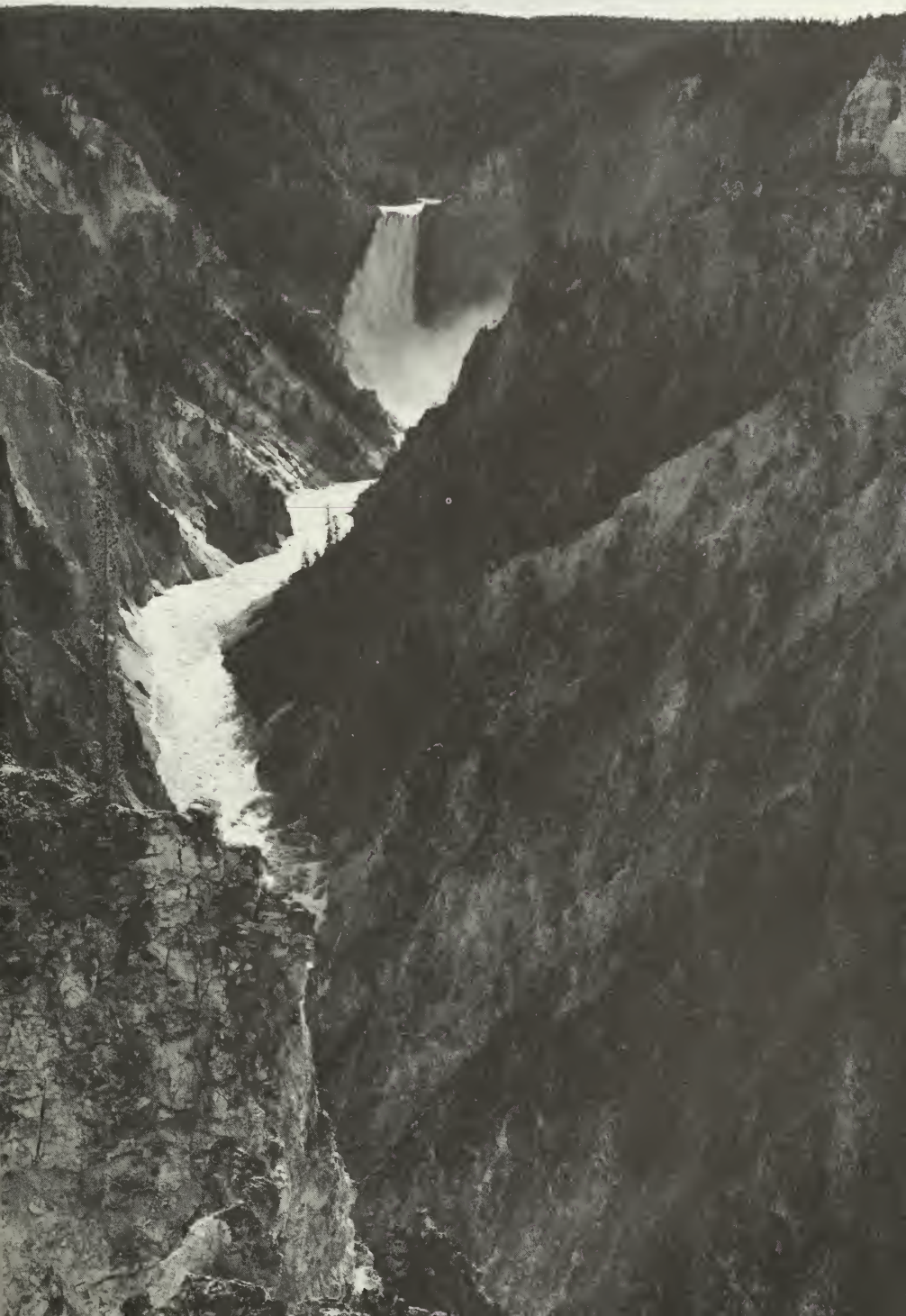
Yellowstone: A showcase of the beauty and power of nature.