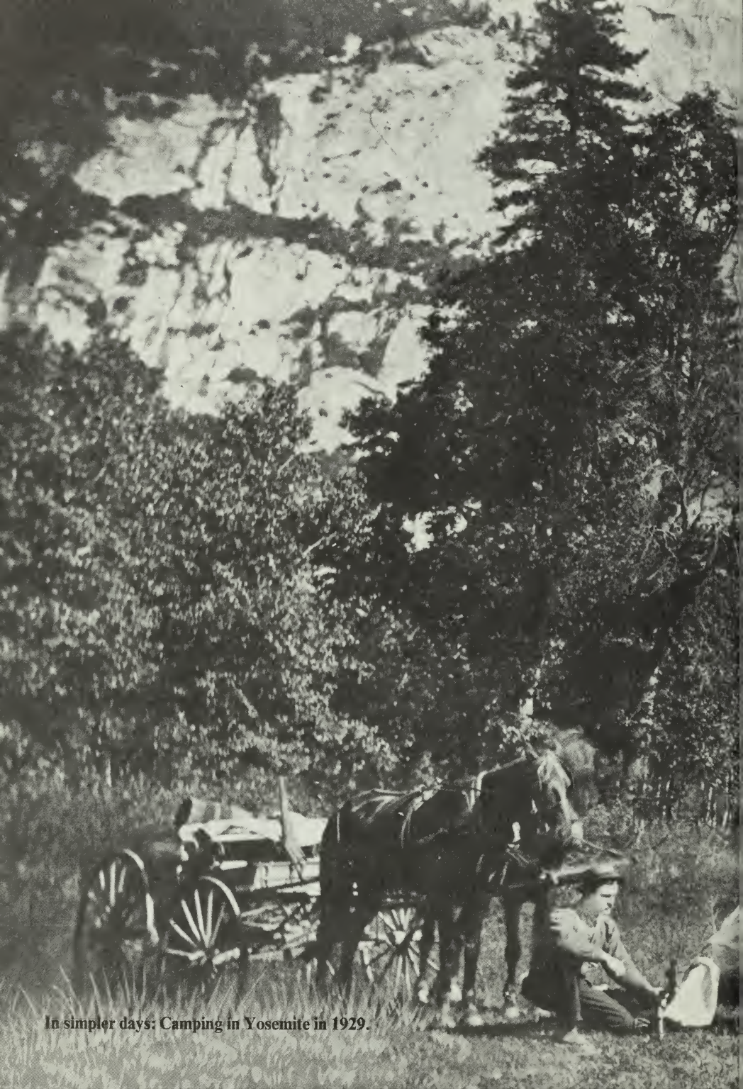
In simpler days: Camping in Yosemite in 1929.