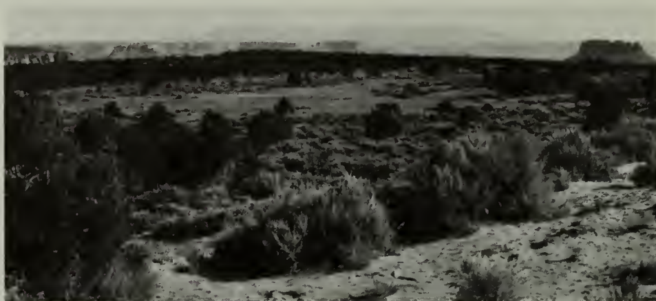
Pinyon-juniper woodlands and sagebrush shrublands typical of the area surrounding the research sites.

The project consists of four integrated phases: (1) reviewing recent arid land reclamation literature, (2) preparing a reclamation research plan for four disturbed sites in the Tar Sand Triangle, (3) implementing the plan and (4) preparing a field monitoring manual that outlines monitoring procedures and statistical analysis methods for evaluating the success of various reclamation treatments.