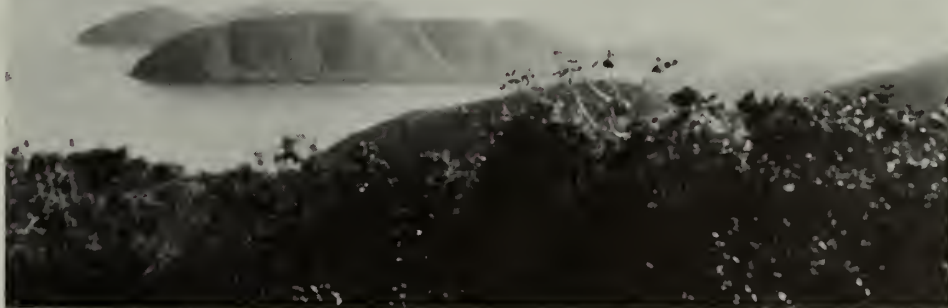
Virgin Islands National Park is seen here with the British Virgin Islands in the background.