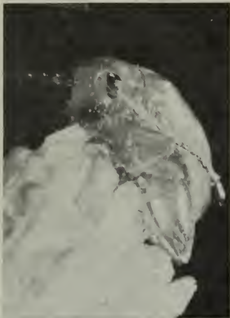
Tiny, golden, and deadly to tansy ragwort is this 8 mm flea beetle, whose larvae bore into roots and leaf bases and feed all winter inside the plants.

Redwood NP biological technicians collected enough beetles for 66 new releases; in 1983 there were over 300 releases. That's 225,000 beetles!!