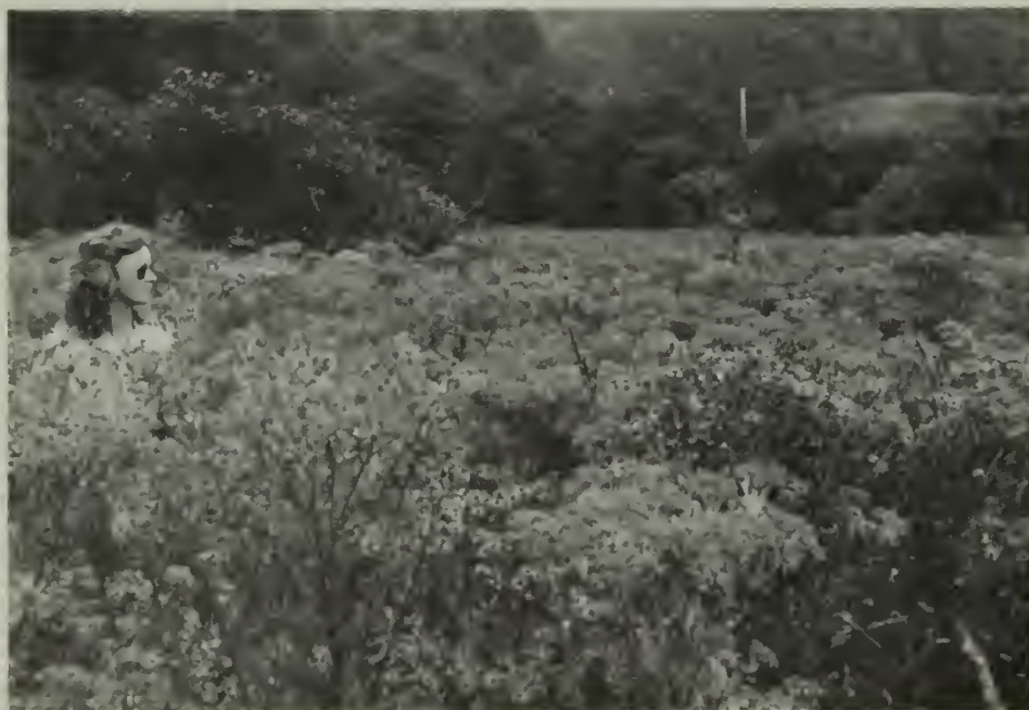
The author , all five feet six inches of her, barely tops the tansy ragwort – the aggressive biennial plant that is affectionately referred to at Redwood National Park as “that nasty weed.”

The colony site on Ender's Beach was so successful that it became the nursery colony for other park areas, much of Del Norte County and even for Oregon. Collecting these tiny, fast-jumping creatures required special equipment, namely a Dieter vacuum machine, which literally sucks up the beetles from the plants. The beetles were then transferred to paper bags and taken to new pastures. In order to have enough beetles to establish a colony, about 500 to 750 individuals were collected for each new site. In 1982, Del Norte County agricultural technicians and