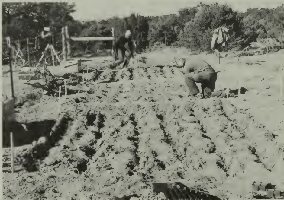
Portion of one research site showing three transplant study plots. Foreground and background plots demonstrate furrowing used for moisture retention.

Fifteen participants from Indonesia, Thailand, Sri Lanka, Kenya, and Mozambique spent three weeks intensively studying the major elements of coastal area management planning – resource uses, planning and information management, legal context, institu-