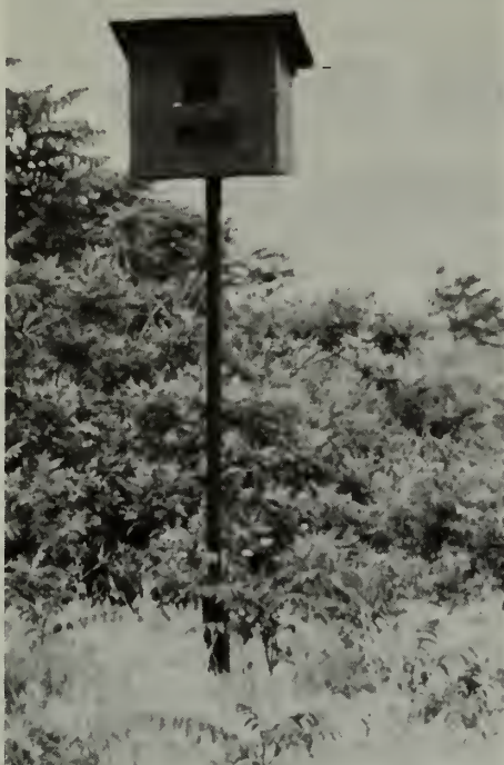
Barn owl nest box in Jamaica Bay Wildlife Refuge is one of many erected at Jamaica Bay Wildlife Refuge, beginning in 1980.

Products of the space program are helping Oregon biologists plot the movements of 25 elk in southwestern Oregon.