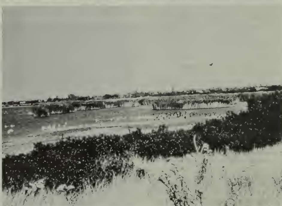
New York City skyline looms in background over Jamaica Bay Wildlife Refuge (above). Abundant waterbird populations seem to find the city no threat as they make use of the Refuge's West Pond (below).