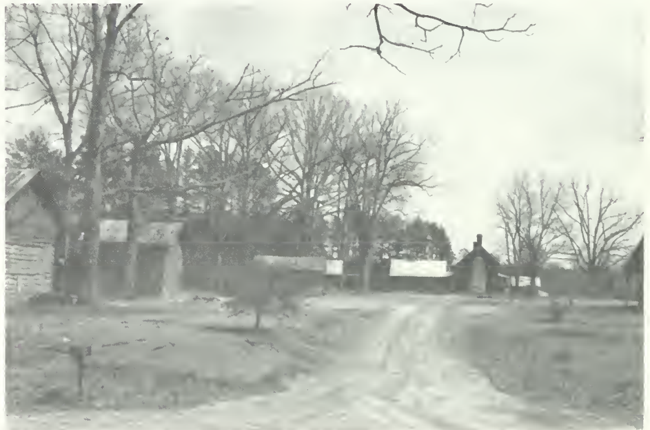
This cluster of agricultural buildings that make up the ca. 1899 Puckett Family Farm at Satterwhite, Historic and Architectural Resources of Granville County, North Carolina has been described as "one of the county's most significant bright leaf era rural properties, an intact symbol of the way most of the county's citizenry led its life from the Civil War into the 1950s." It was nominated to the National Register of Historic Places as part of the geographically-based Granville County, North Carolina multiple property submission. (Marvin A. Brown)