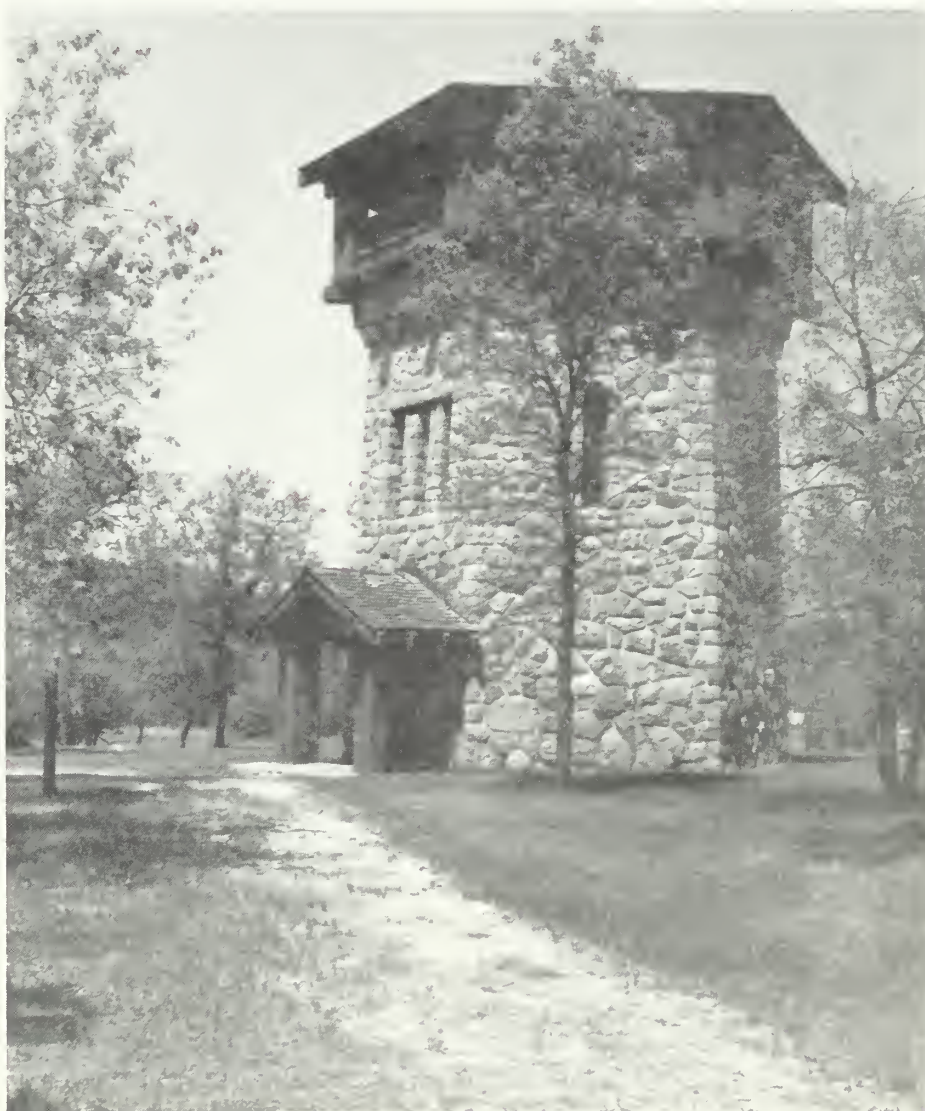
The 1939 water tower is a contributing building in the National Register of Historic Places nomination of Lake Bronson State Park in Kittson County, Minnesota. The eligibility of the park was justified for its association with the Minnesota State Park CCC/WPA/Rustic Style Historic Resources multiple property submission. The historic resources of Lake Bronson State Park are significant as "outstanding examples of rustic style split stone construction." (Rolf T. Anderson)

Enter the name, title, organization, address, and daytime telephone number of the person who compiled the information contained in the documentation form. The SHPO, the FPO, or the National Park Service may contact this person if questions arise about the form or if additional information is needed.