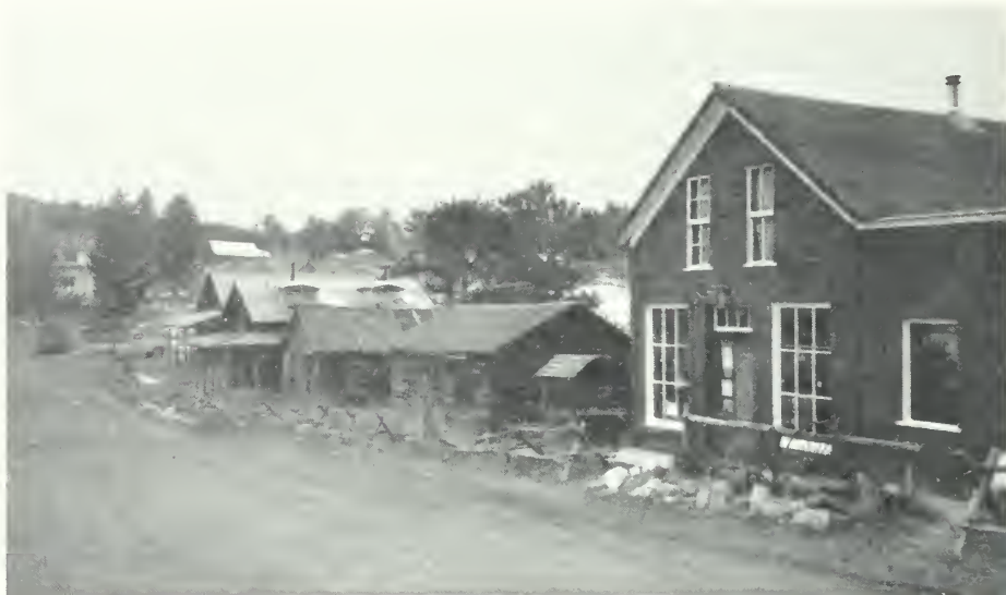
Main Street was included in the Gold Hill Historic District, a property nominated to the National Register of Historic Places as part of the Metal Mining and Tourist Era Resources of Boulder County, Colorado multiple property submission. Dating from the early 1870s, the Gold Hill Historic District is considered the most "intact representation of the early mountain communities that developed as a result of the precious metal mining in Boulder County."

Historic contexts may include those identified in the State historic preservation office comprehensive planning process. According to the Secretary of the Interior's Standards and Guidelines for Archeology and Historic Preservation , historic contexts provide information about the historical patterns and trends that produced individual properties. Historic contexts serve as the foundation for decisions about the identification, evaluation, registration, and treatment of historic properties. For further explanation of historic contexts, see discussion in section E.