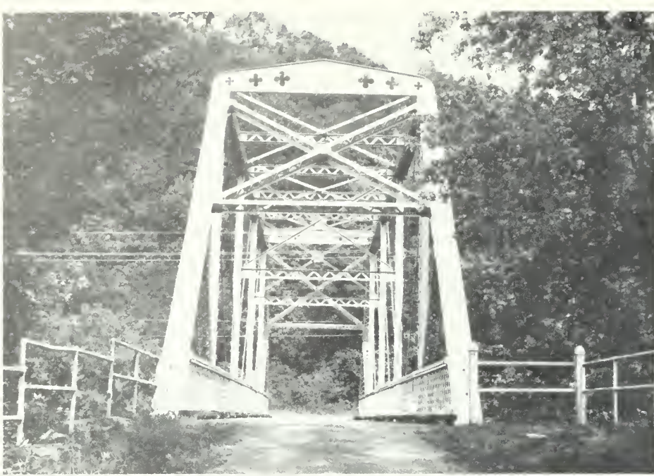
The 1898 Birmingham Bridge was nominated to the National Register of Historic Places as part of the Industrial Resources of Huntingdon County, Pennsylvania multiple property submission. Located in Birmingham, it is significant as "a fine example of one of the county's less than ten remaining pin-connected Pratt through truss bridges built in the late 1800s." (Nancy Shedd )

For properties significant under Criterion C, summarize the following: