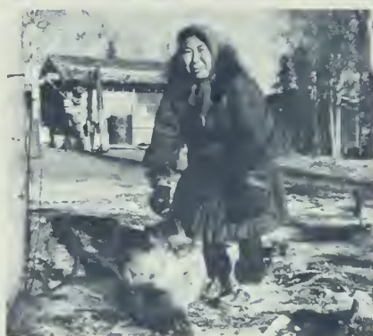
Top: Eskimo woman trimming seal intestines. Bottom: Eskimo woman butchering caribou along Kobuk River.

held that local natives should be involved in management of parks and their resources.