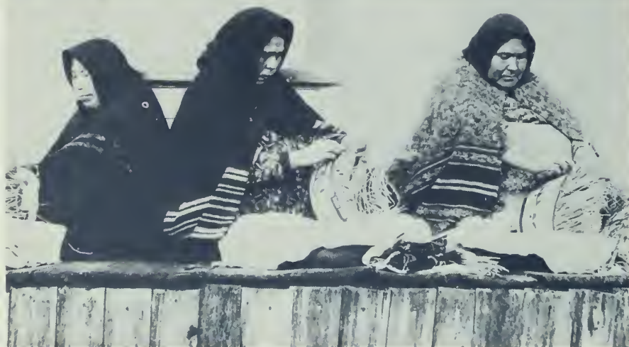
Top: Icorostasis, Second Floor Chapel, Russian Bishop's House. Bottom: Three women weaving baskets.

Size is often no measure of cultural diversity. Consider 108-acre Sitka National Historical Park which administers a variety of sites that include an 1804 Indian fort, totem poles dating from before the 1890's, and an 1842 Russian structure built for the Bishop of Kamchatka, the Kurile Islands and Alaska. A variety of Native, European, and American artifacts fill the gaps in between. Settled by the Kiksadi clan of the Tlingit Indians, captured and colonized by the Russians, and occupied by the United States, Sitka has inherited a rich cultural milieu.