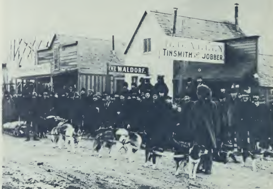
Brackett's Trading Post in December, 1897.

Endings, however, tend to become beginnings. Historic photographs uncovered for the property owner adjacent to the Ganty and Frandson grocery revealed a surprise, an ignored December 1897 photograph which showed the grocery as the Brackett Trading Post. Things began to click--Brackett's father built the town's significant toll road, Alaska's first; he also built an outfitter's store in October, 1897, but failing to clear title, moved out. This building became our bakery and grocery. As Brackett's Trading Post, its significance rose.