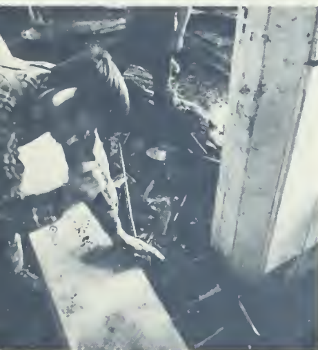
Restoration activities, Russian Bishop's House. Log woman totem pole.