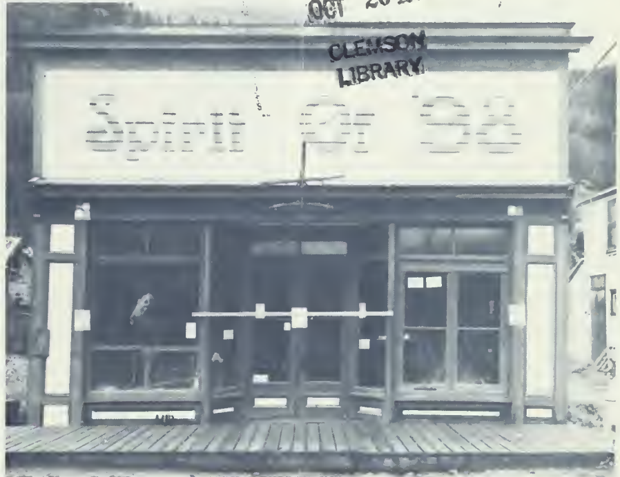
Brackett's Trading Post as seen today. Skagway, Alaska.