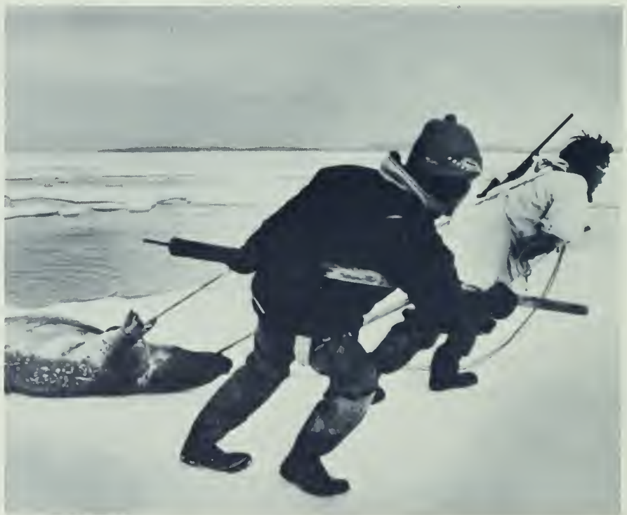
Eskimo hunters haul a seal kill in Cape Krusenstern National Monument, Alaska. The new area would permit subsistence use of renewable resources needed for human life.

A considerable amount of my time is spent questioning what it means to live in rural Alaska and to have a heritage which is reflected in one's daily life ways. I recently uncovered an old picture of Athabascan Indians gathered at a historic site near Arctic Village. The picture had particular meaning because I knew many of the people and had heard stories about the site. They were children when the