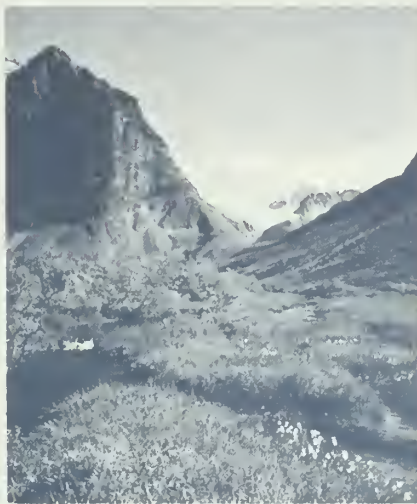
Turquoise Lake area. Lake Clark National Monument.

Both men enjoy the arctic environment as well as the skills that make