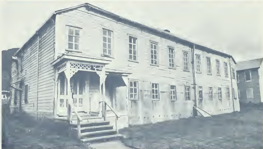
Top: Russian Bishop's House, 1985. Note the priest with the two children on the porch. Bottom: Pre-restoration Russian Bishop's House. Note the structural changes.