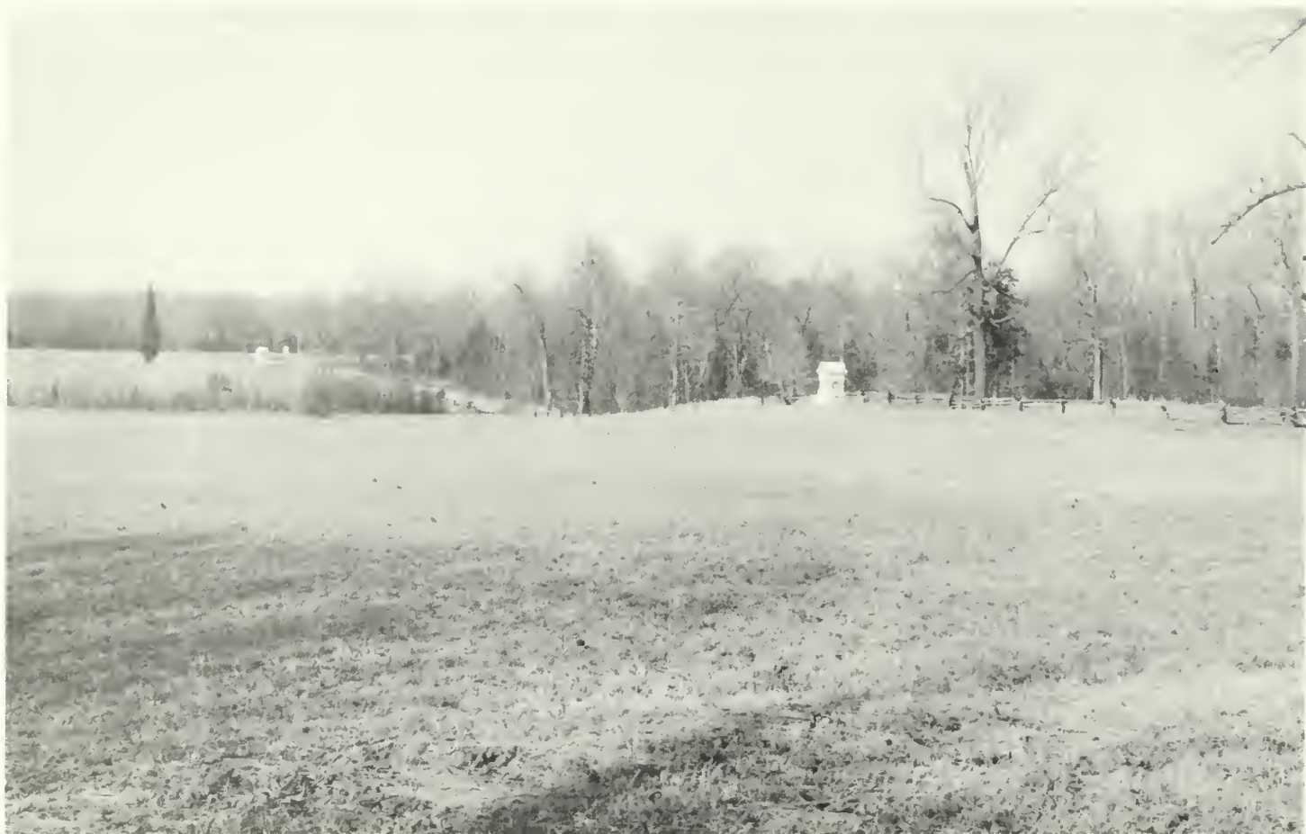
The best-preserved battlefields appear much as they did at the time of the battle, making it easy to understand how strategy and results were shaped by terrain. Participants in the Battle of Shiloh (April 6-7, 1862) would undoubtedly recognize the Sunken Road and the Hornet's Nest depicted here. This was the site of ferocious fighting as Gen. Ulysses S. Grant's men desperately held this position for six hours against eleven Confederate attacks.

reflect the historic use of the land. For example, in battlefields located in rural or agricultural areas, the presence of farm related buildings dating from outside the Period of Significance generally will not destroy the battlefield's integrity. It is important that the land retain its rural or agricultural identity in order for it to convey its Period of Significance. (See following paragraphs on the impact of reforestation). The impact of modern properties on the historic battlefield is also lessened if these properties are located in a dispersed pattern. If a battlefield is characterized by rolling topography, the impact of later noncontributing properties may also be lessened. Frequently, one of the greatest changes to the historic landscape is the development of modern roadways. The changes in the roadway circulation pattern on battlefields should be evaluated for the impact on the battlefield's integrity.