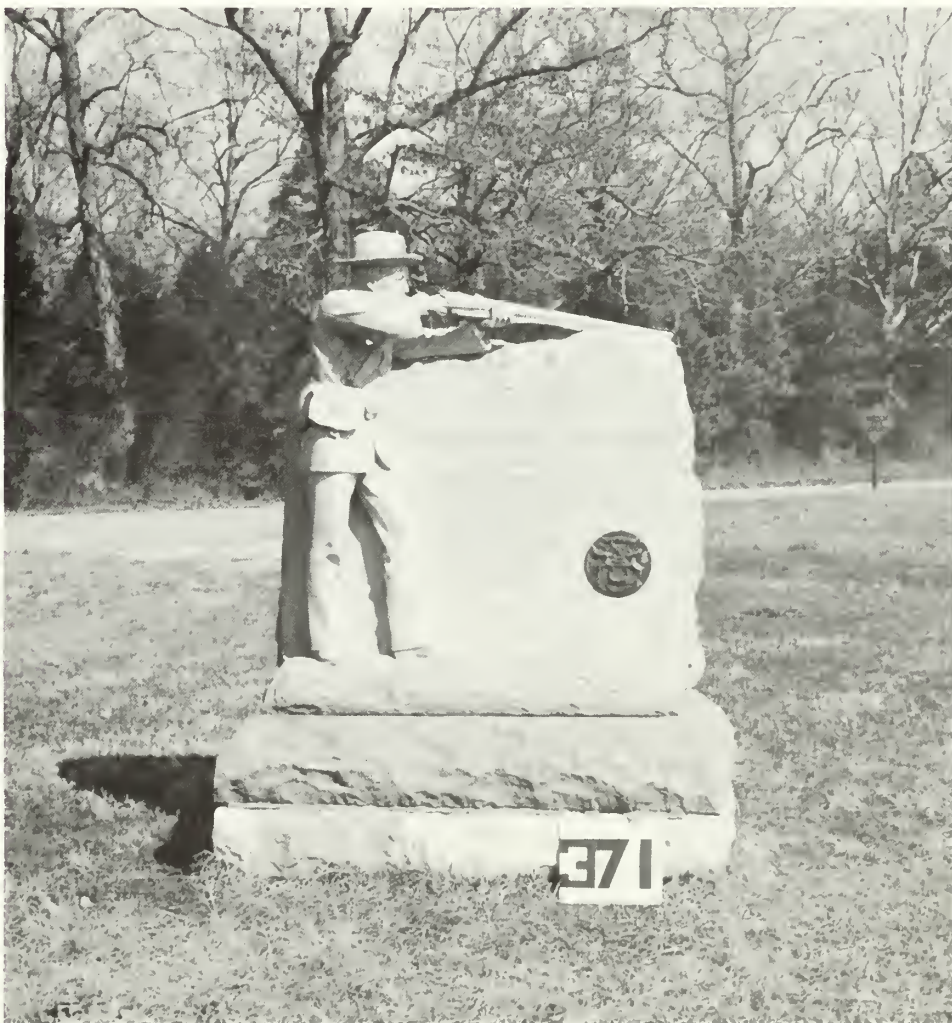
Battlefields may derive additional significance for their association with later efforts to memorialize the bravery and sacrifice of the participants. The movement to construct monuments dedicated to individual units in the 1880s gave many battlefields their current park like appearance. Illustrated here is the monument commemorating the Michigan Thirteenth Infantry Regiment's participation in the Battle of Chickamauga (September 19-20, 1863). (Photo by National Park Service).

The following is a partial list of battlefield components: