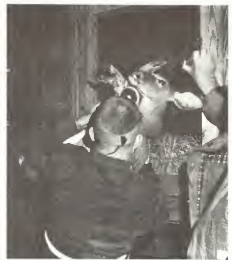
After frantic struggles with game biologists in the Okefenokee palmettas, the reluctant deer are firmly tied and loaded into a Department truck to "sleep it off" before being restacked.