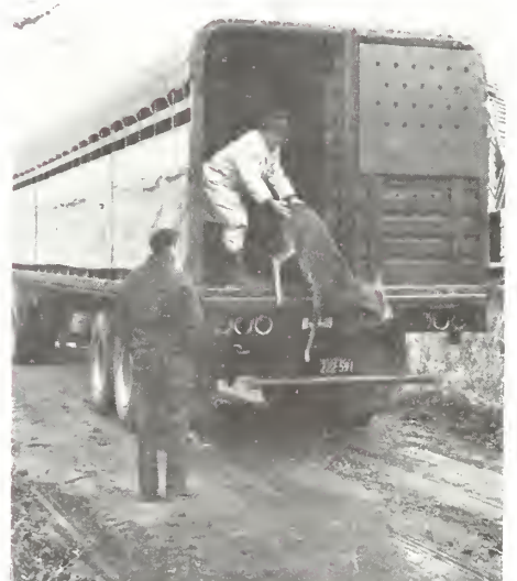
This truckload of Texas deer is ready to leap far freedom in a new Georgia home. Bucks in the group either have already lost their antlers or had them sawed off to protect the other deer.