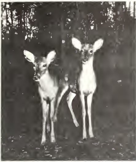
Game and Fish Department biologists were asked to remove a number of underfed deer congregating around Stephen Foster State Park on the edge of the Okefenokee National Wildlife Refuge.