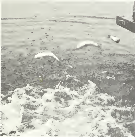
As the trout are released into the lake they immediately disperse. Some of these rainbows have been caught in varied areas of the impoundment. The unmistakable characteristics of the rainbow trout make it easy to identify.

STATE GAME & FISH COMMISSION Public Information Division 401 State Capitol Atlanta, Ga. 30334