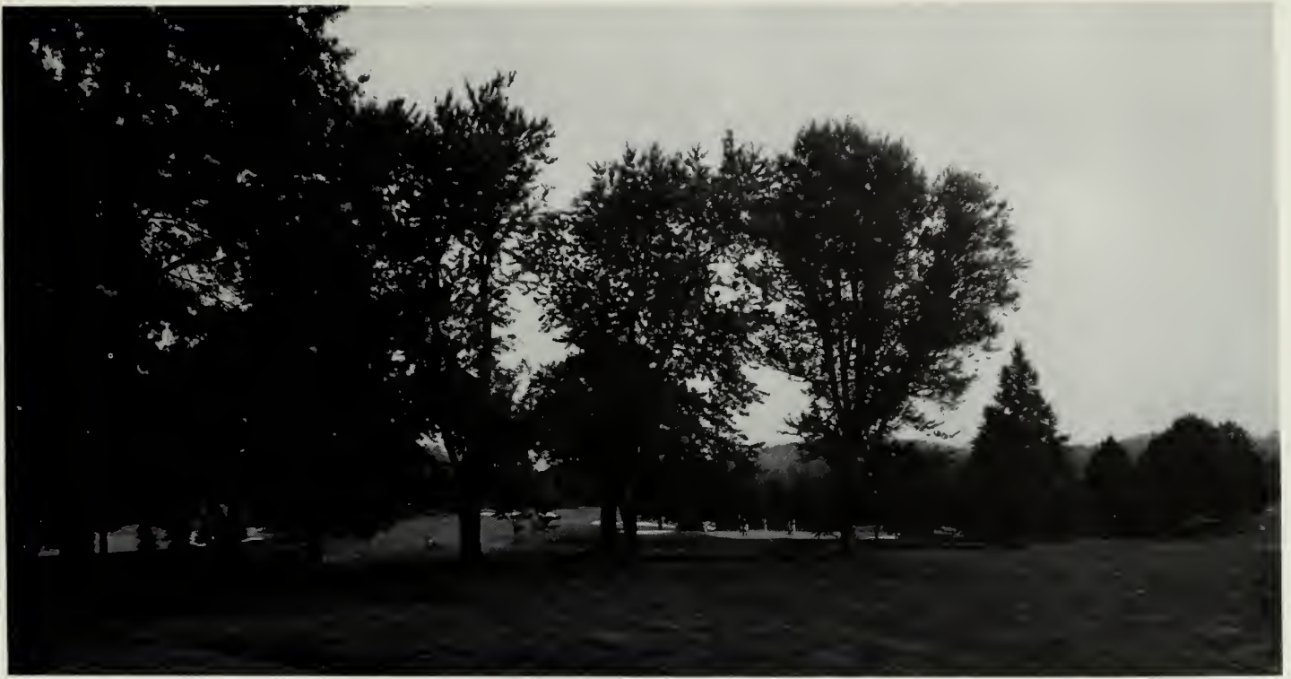
FIGURE 6: Oakmont Country Club, significant in golf annals for the difficulty of its course, its length, and speedy greens, is one of the nation's earliest surviving golf courses. The Western Pennsylvania eighteen hole course was laid out by Henry C. Fownes in 1901. Fownes' original design is still evident today despite the constant maintenance and alterations required for a championship caliber golf course.

the present appearance and function of the landscape to its historical appearance and function. The relationship between present function and that intended or actually in use during the period of significance may also affect the integrity of a designed historic landscape. An area that was designed for passive recreation may have suffered a loss of integrity if it has been converted for active play such as baseball. On the other hand, an open meadow within a large estate or institutional grounds may survive an adaptive use to a golf course without loss of integrity if its open design qualities remain dominant. Conversions of designed landscapes to agricultural or forest uses may also seriously affect historic integrity, although the existing landscape remains scenic.