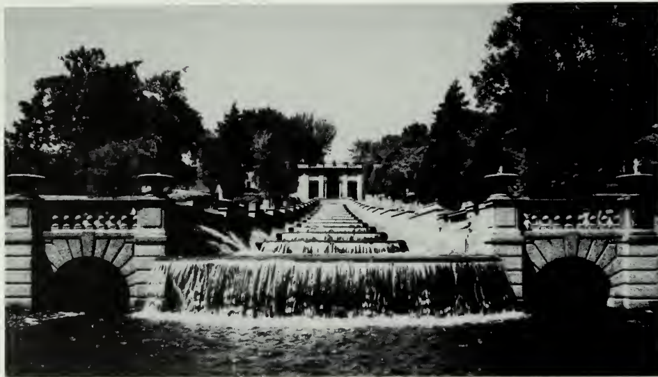
FIGURE 3 & 4: The terraced water cascade is the major design element at Meridian Hill Park in Washington, D.C., which served as a prototype for large scale and decorative usage of exposed aggregate concrete.