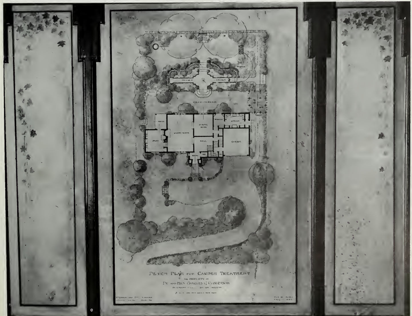
FIGURE 5: The presentation drawing for a "Design Plan for Garden Treatment" for Dr. and Mrs. Charles G. Robertson garden was prepared by the Salem, Oregon landscape architectural firm of Lord and Shriver and mounted and framed for use as a fireplace screen by the original occupants. Historic plans are helpful both in determining the original design intent and evaluating the integrity of a designed historic landscape.

cussion is required. If a designed landscape is important at all three geographic levels—local, State, and national—it should be discussed within the context of all three with significant contributions noted for each level. Many State Historic Preservation Offices are defining formal historic contexts as part of their comprehensive State historic preservation planning process and may be able to assist nomination preparers with the compilation of