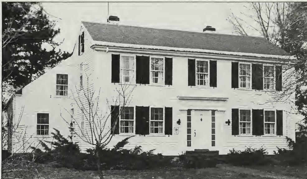
John B. Russwurm House, Portland, Maine.

No. 238 Ocean Avenue in Portland is the only surviving structure closely associated with John Brown Russwurm (1799-1851), who resided there intermittently in the period 1812-1827. Russwurm was this nation’s second black college graduate, a founder and editor of America’s first black newspaper, and