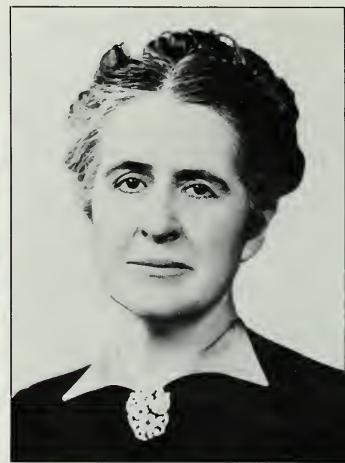
Portrait of U.S. Representative Nan Wood Honeyman, 1939.