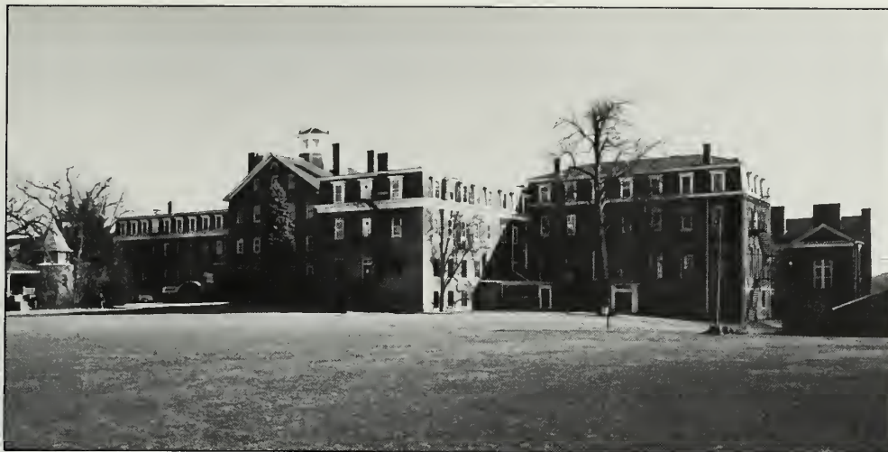
Moses Brown School, Providence, Rhode Island: school (est. 1819) whose contributions to the state's educational, religious, and social development reflect the ideas and objectives of its principal founder, for whom it is named.