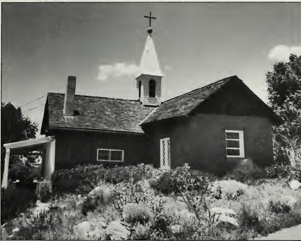
Archbishop Lamy's Chapel, Santa Fe County, New Mexico: chapel used from 1874 to 1909 by Archbishop Jean Baptiste Lamy, whose successes in reviving missions and establishing schools, hospitals, and other social institutions greatly improved community life in his jurisdiction.

houses were built in the 1910s and 1920s in the prevailing Neo-Classical styles. The Reno County Courthouse maintains a very high degree of interior and exterior architectural integrity and is a significant example of the Art Deco style as interpreted in a pre-Depression designed public building.