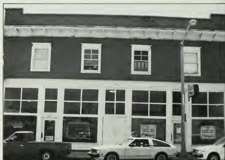
Helme-Worthy Store, Huntington Beach, California, in 1907 and 1986.