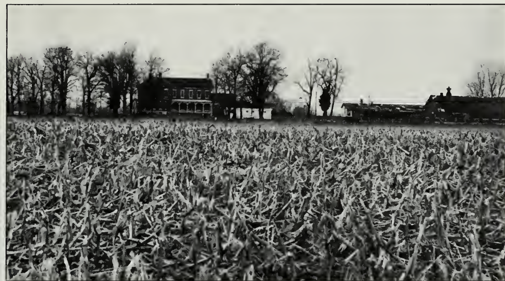
Henry T. Rainey Farm, Greene County, Illinois.