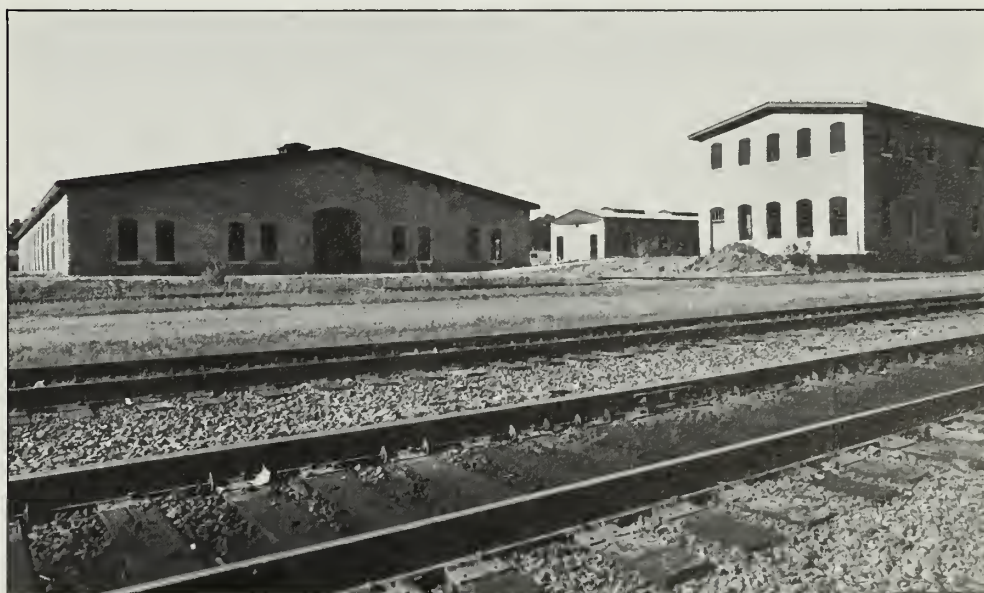
St. Paul, Minneapolis, and Manitoba Railway Company Shops, St. Paul, Minnesota.