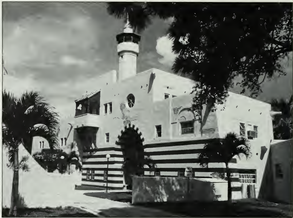
Opa-Locka Company Administration Building, Opa-Locka, Florida: anchor building for planned city conceived by inventor and real estate developer Glenn Hammond Curtiss (Mary Evans).

The interior retains much of its original integrity. The wide central stairway runs from the double doors in the front facade to a hallway, shaped like a cross. The hall to the back is an extension of the front hall and leads to the second floor covered porch. The four apartments are arranged along the halls with one in each quadrant. A large skylight is centered in the main hallway. All of the rooms have the original wide woodwork with molding across the top of the lintels. . . . The first floor has had a wall added down the center to form two store spaces. The mezzanine is still visible in the south store, but has been fronted with a wall in the north store. An apartment has been added into the back. The rooms on the north end are original and the high tank toilet is still working. The store on the south is occupied by a furniture restorer and the store on the north contains a dance studio. The apartment across the back was added in the 1920's and is two-storied, filling in the back part of the first and mezzanine floors. The 1917 addition to the north side is unchanged and presently used for storage. Both the exterior and interior of the building retain their integrity of feeling and association and have a strong visual character.