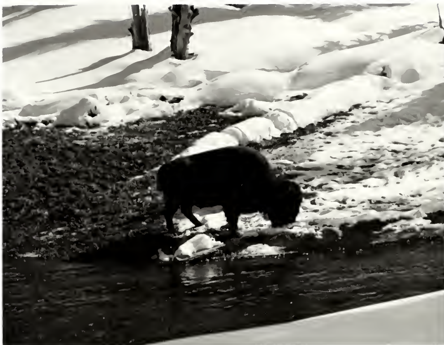
YELLOWSTONE NATIONAL PARK, WYOMING