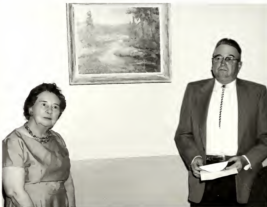
YELLOWSTONE NATIONAL PARK, WYOMING

Lone bison foraging for first greens of spring.