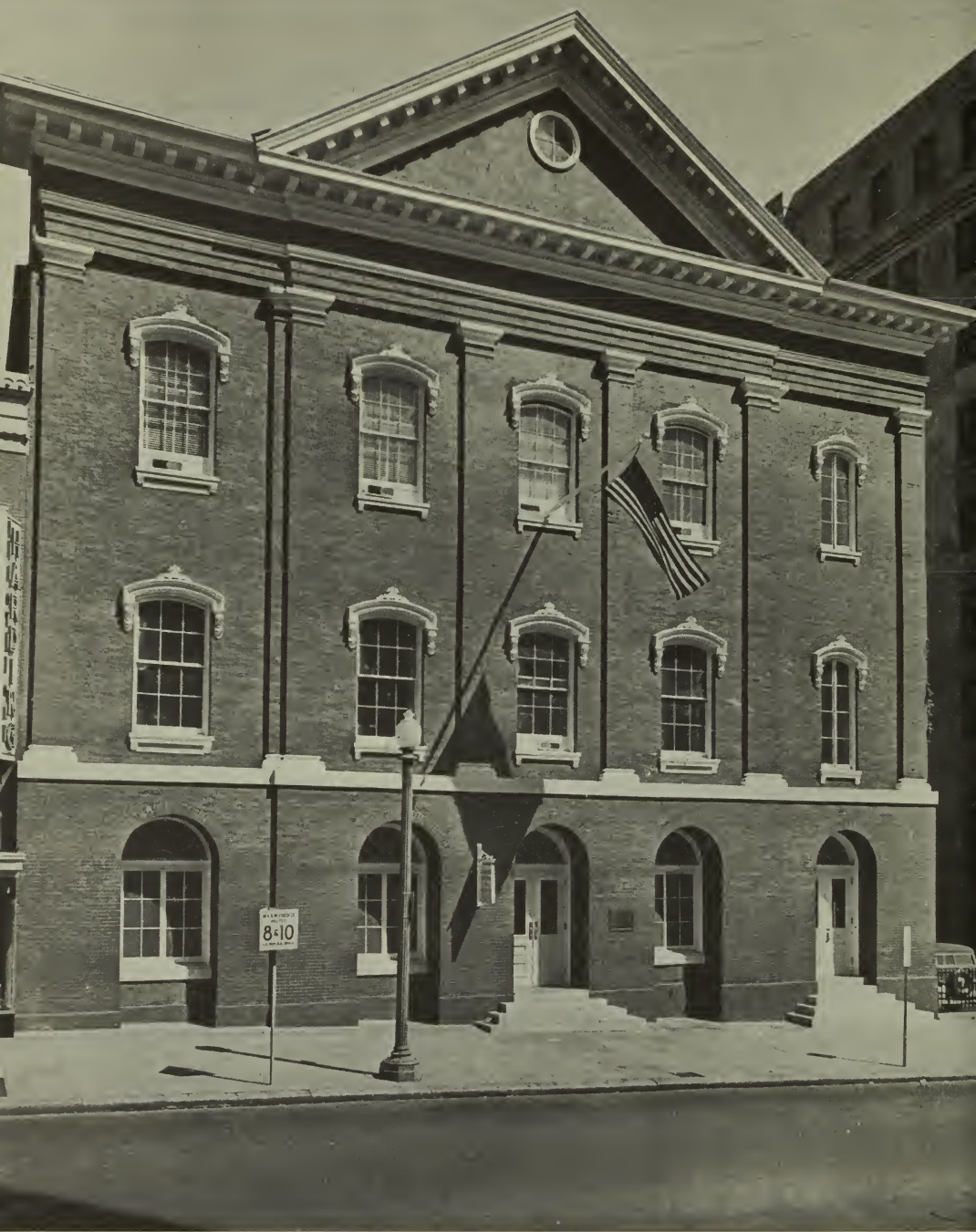
Lincoln Museum (Ford's Theatre)