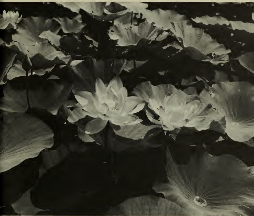
Lotus in Bloom at Kenilworth Aquatic Gardens.