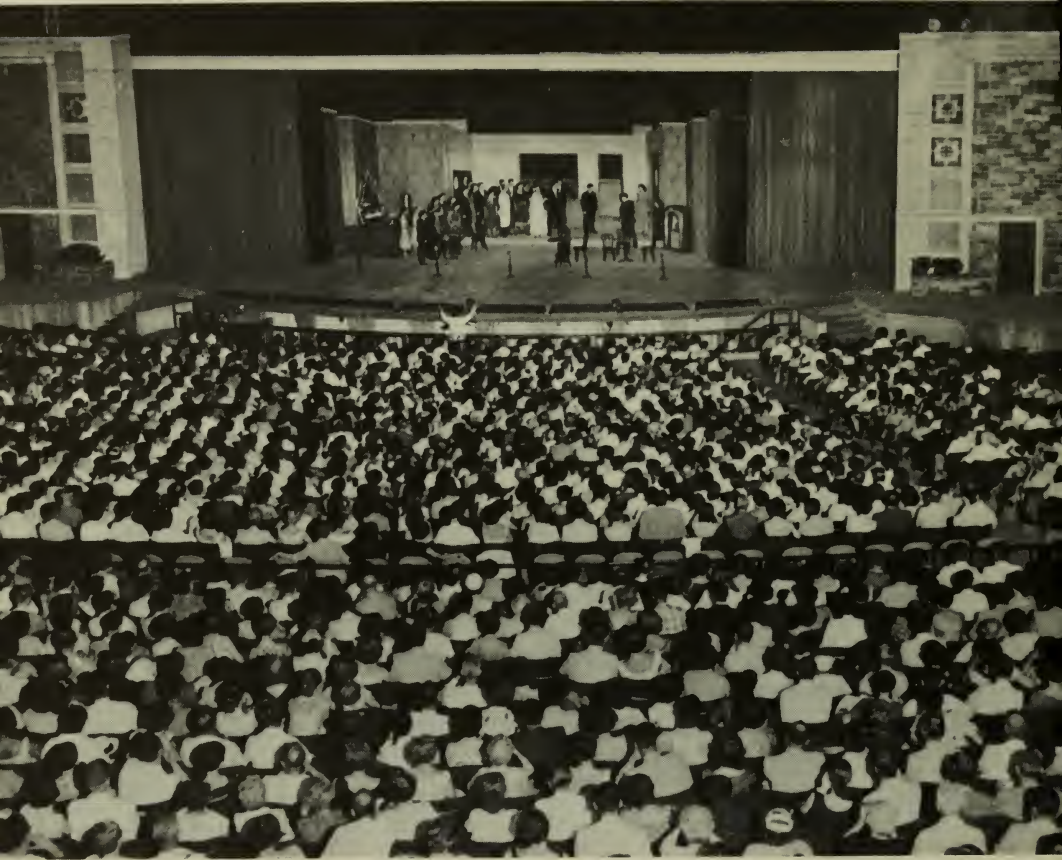
An Evening at Carter Barron Amphitheater.