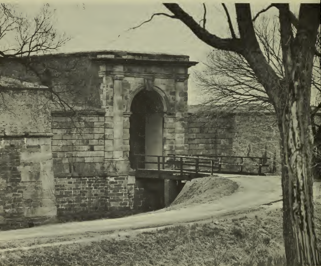
Fort Washington, Sally Port Entrance