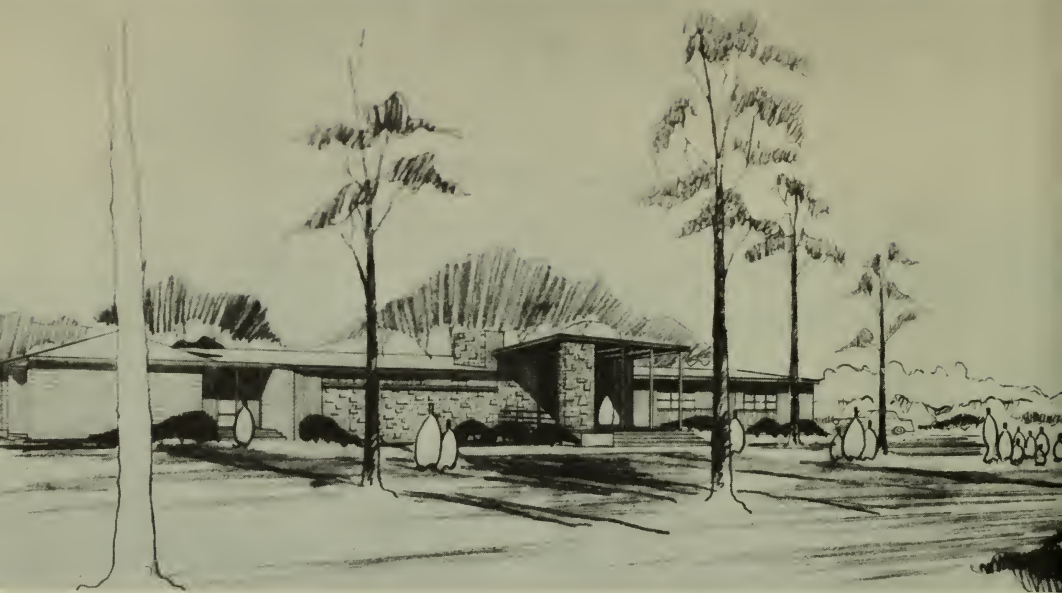
Architectural Sketch of New Rock Creek Nature Center.