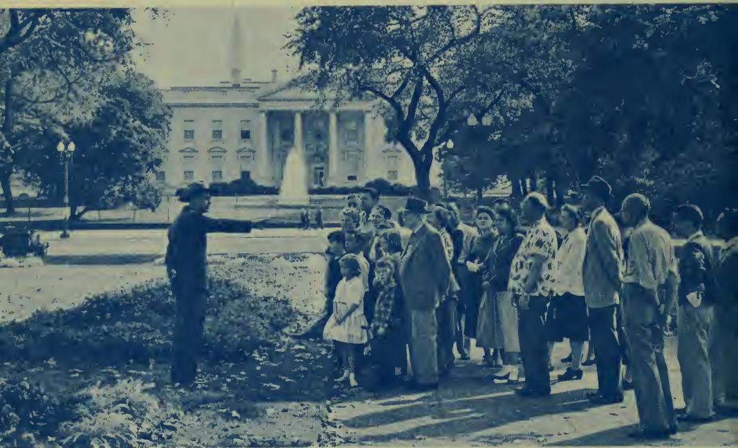
Park Historian Conducting Lafayette Park Tour

U.S. Department of the Interior National Park Service National Capital Parks Washington 25, D.C.