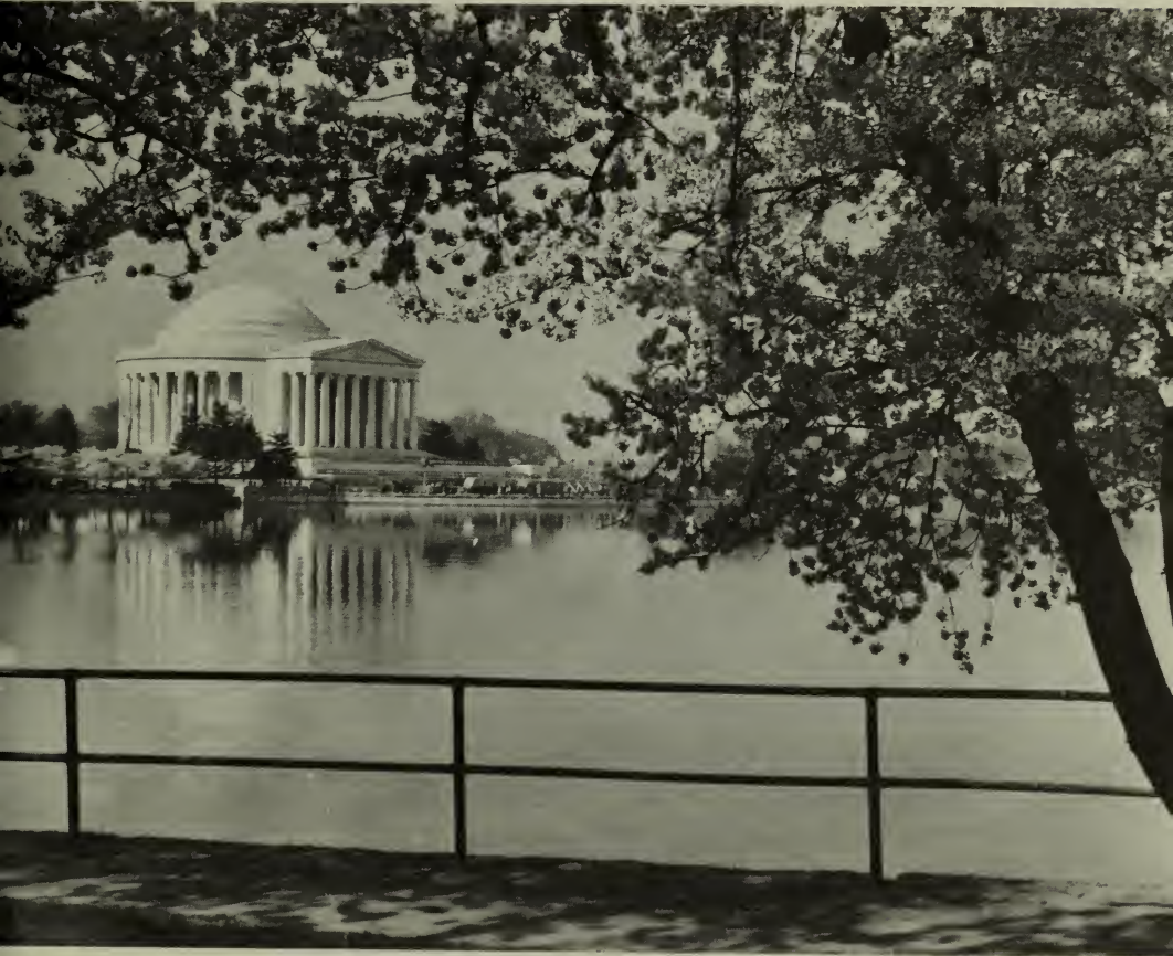
Cherryblossomtime at the Tidal Basin.

The CHERRY BLOSSOM FESTIVAL, INDEPENDENCE DAY CELEBRATION, POWERBOAT REGATTA, and PRESIDENT'S CUP REGATTA are among the special celebrations held throughout the year. Dates for these occasions are shown in the monthly EVENTS of the preceding pages. Watch the newspapers or call RRepublic 7-1820, Ext. 2095, for detailed information.