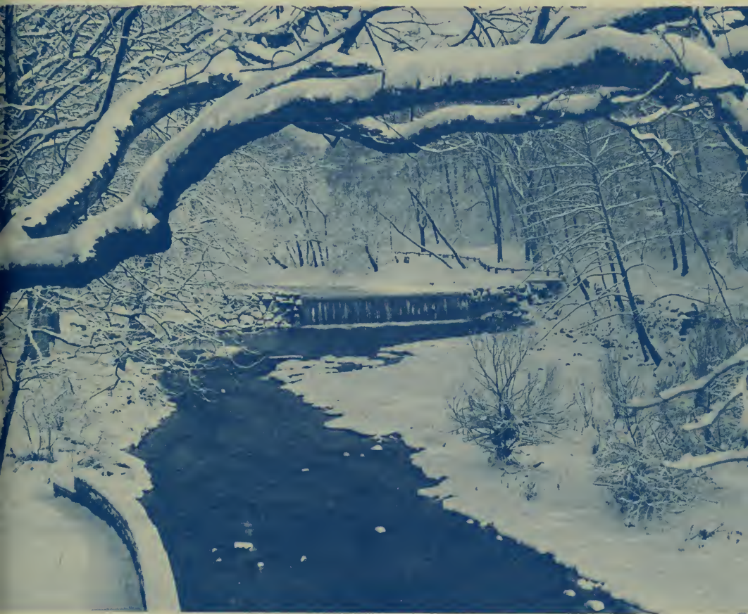
Winter in Rock Creek Park

FOR COPIES, WRITE THE SUPERINTENDENT NATIONAL CAPITAL PARKS UNITED STATES DEPARTMENT OF THE INTERIOR WASHINGTON 25, D.C.