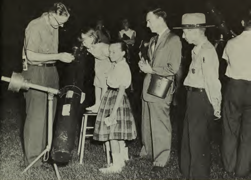
"Exploring the Sky" at Fort Reno Park.

EXPLORING AND PHOTOGRAPHING THE SKY 9 p.m. See and photograph the gibbous moon through powerful telescopes. Also, see several double stars and learn some of the spring constellations.*