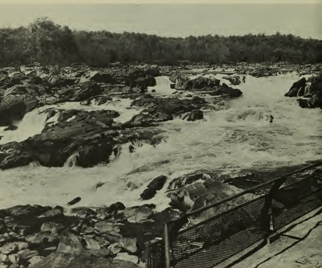
Great Falls of the Potomac River.