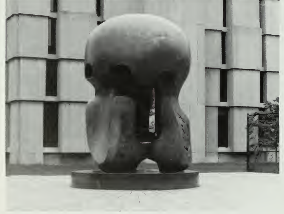
Nuclear Energy, sculpture by Henry Moore commemorates the first controlled nuclear chain reaction. The site, on the campus of the University of Chicago, was declared a National Historic Landmark in 1983. Chicago, Cook County, Illinois