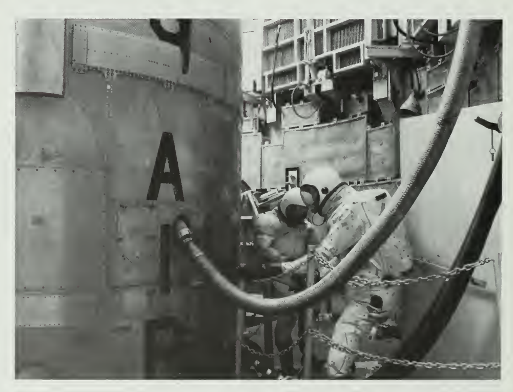
The Titan II ICBM Missile Site 8 (571-7) in Pima County, Arizona, was listed in the National Register in 1992. This view shows a simulated vapor detection check by propellant transfer technicians.

In Topeka, Kansas, the Monroe School, now known as the Brown v. Board of Education National Historic Site, is significant as the property associated with the 1954 landmark United States Supreme Court case, Brown v. Board of Education. In that decision, a state's action in maintaining segregation by providing "sepa-