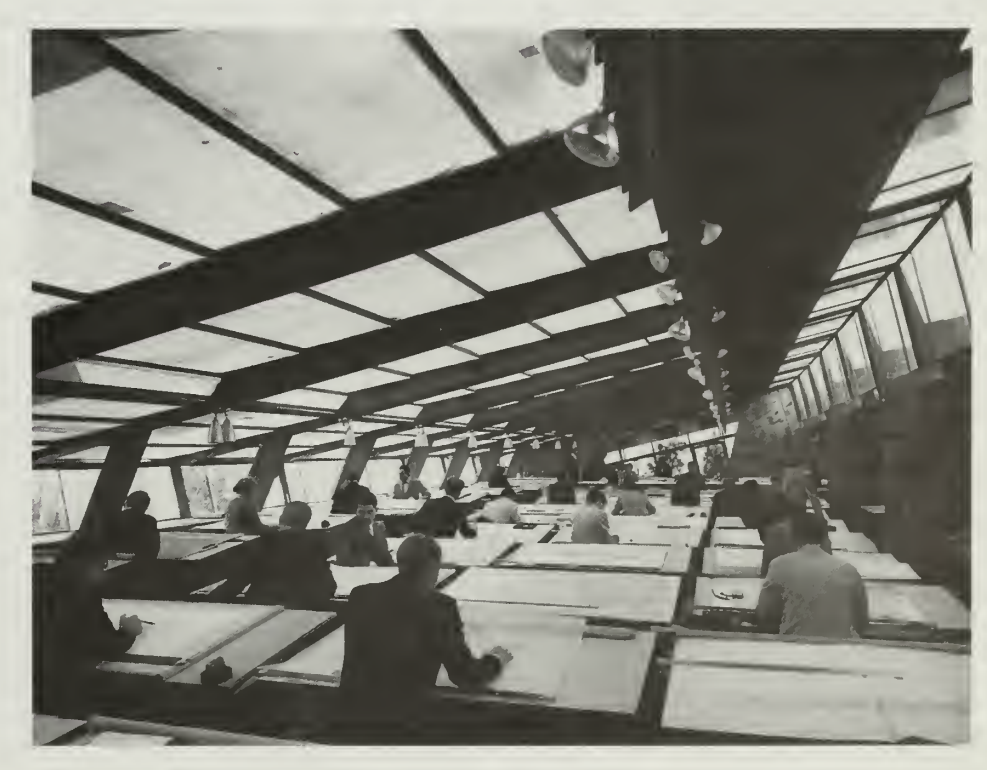
The interior of the Drafting Studio at Taliesin West, Maricopa County, Arizona, illustrates the unique method of architectural training available at Taliesin West, which had exceptional influence on post-World War II architectural design in the United States.

Fifty years is obviously not the only length of time that defines "historic" or makes an informed, dispassionate judgment possible. It was chosen as a reasonable, perhaps popularly understood span that makes professional evaluation of historical value feasible. The National Register Criteria for Evaluation encourage nomination of recently significant properties if they are of exceptional importance to a community, a State, a region, or the Nation. The criteria do not describe "exceptional," nor should they. Exceptional, by its own definition, cannot be fully catalogued or anticipated. It may reflect the extraordi-