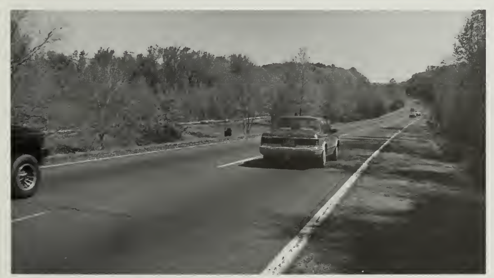
The Baltimore-Washington Parkway in Anne Arundel and Prince George's counties, Maryland, was constructed between 1942 and 1954 as a component of a national parkway system.