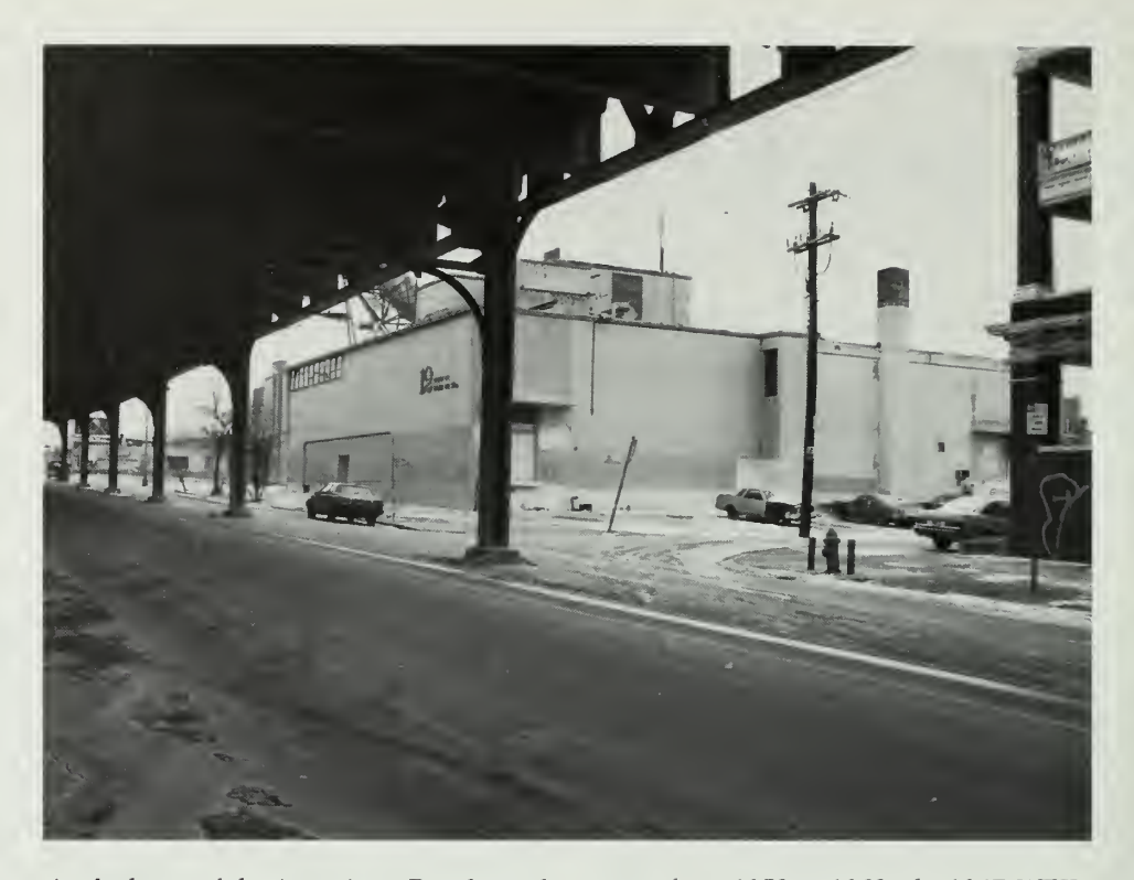
As the home of the American Bandstand program from 1952 to 1963, the 1947 WFIL Studio in Philadelphia, Pennsylvania, is exceptionally significant in the early development of the television industry.

nary impact of a political or social event. It may apply to an entire category of resources so fragile that survivors of any age are unusual. It may be the function of the relative age of a community and its perceptions of old and new. It may be represented by a building or structure whose developmental or design value is quickly recognized as historically significant by the architectural or engineering profession. It may be reflected in a range of resources for which a community has an unusually strong associative attachment. Thus a complete list of exceptionally significant resources cannot be prepared or precise indicators of exceptional value prescribed. The following discussion offers guidance for the reasoning and evaluation applicable to properties that have achieved significance in the past 50 years. It also offers direction on preparing Statements of Significance for National Register nominations (Section 8 of the National Register registration form, NPS Form 10-900) of such properties.