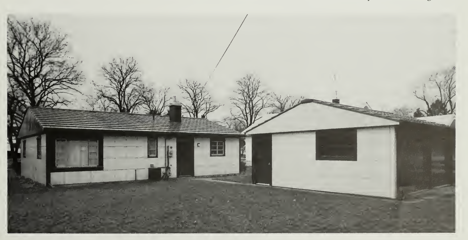
Completed in the spring of 1950, this pre-fabricated, all-metal Lustron House, Porter County, Indiana, was considered by many at the time to be the house of the future. (Beverly Overmeyer, April, 1992)

It is often challenging to evaluate architectural properties of the post-World War II era one at a time. Several States have effectively used a thematic approach and the Multiple Property Documentation Form to evaluate and nominate groups of properties that usually qualify under Criterion C as examples of particular architectural styles or methods of construction. The National Register listed several residences in North Carolina nominated under the name "Early Modern Architecture Associated with North Carolina State University School of Design."