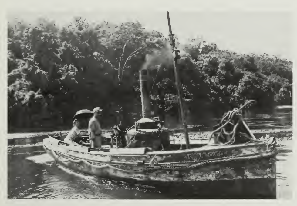
Built in 1912, the AFRICAN QUEEN did not achieve fame until 1951 when it played a starring role in the hit film of the same name. The vessel is currently located in Monroe County, Florida.