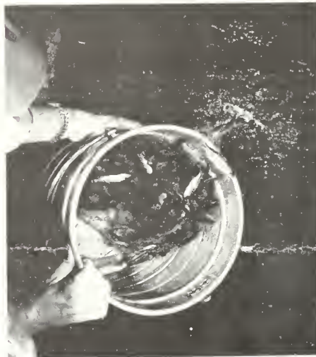
Fingerling bass are released into one of eight state Park Lakes. Approximately fifty fish per acre were released during the all-out stocking effort which was completed this fall.