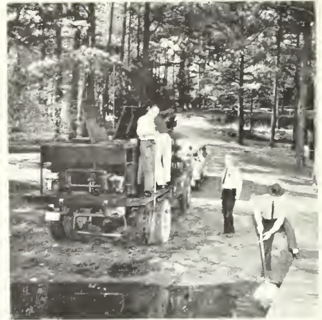
Intermediate bass arrive at Hard Labor Creek State Park's Lake Rutledge and immediate preparations are made for their distribution. The fish averaged from 5 to 9 inches in size.

As a part of the stocking program the department recommended to the State Parks Department that in the future a 10-inch size limit be observed on bass in all the above lakes. The Game and Fish Department feels that this action would help to protect the stocked fish as well as to improve lake conditions.