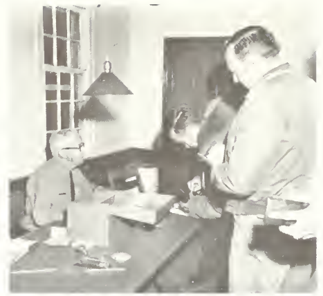
As usual, the State's Cedar Creek Management area took top prize again this season with the largest hunter turnout of any game management refuge. The final figure was 2,656 hunters.