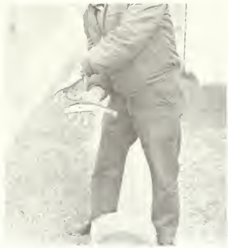
This adult walleye represents future catches in Lake Lanier as a result of the extensive double-punch stocking effort in the North Georgia lake by the Game and Fish Commission.