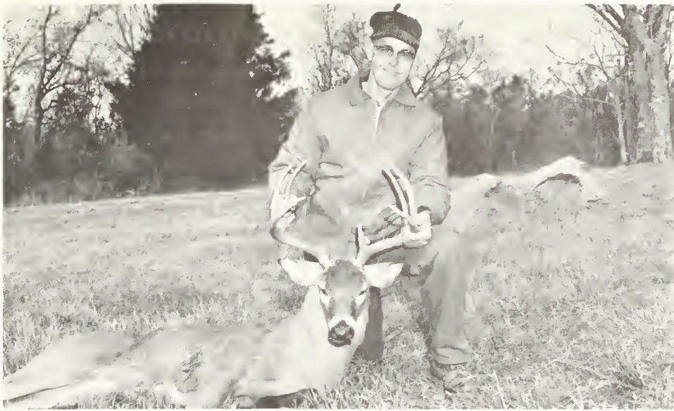
This handsome 8 point buck from this year's Cedar Creek hunt is a prime example of the extensive game management program now in effect on the State's 11 game management areas. Large antlers have been characteristic of the Cedar Creek area for years.