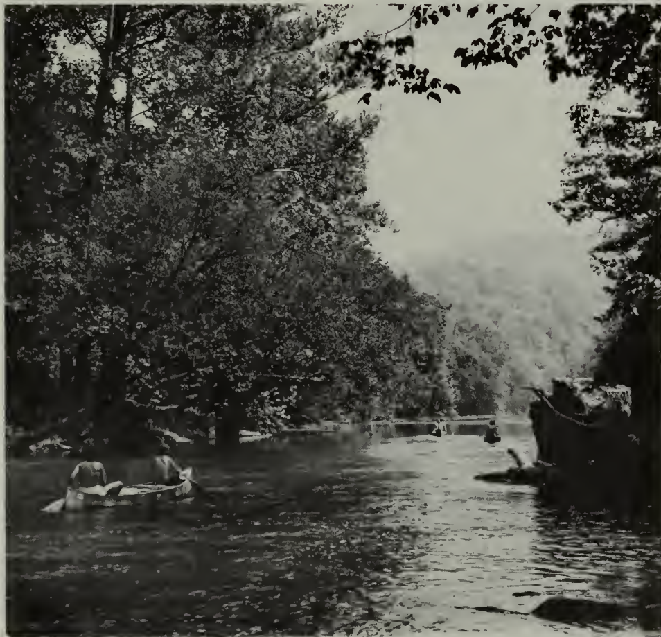
More than 300,000 canoeists a year take to the waters of the Ozark National Scenic Riverways, many of them becoming "incidental cavers" in a haphazard, unplanned way.

Finally, a brief listing of needs included continuing cave inventories and additional research in several areas. The GMP succinctly sums up needs in the Riverways. Final GMP approval came in October, 1984.