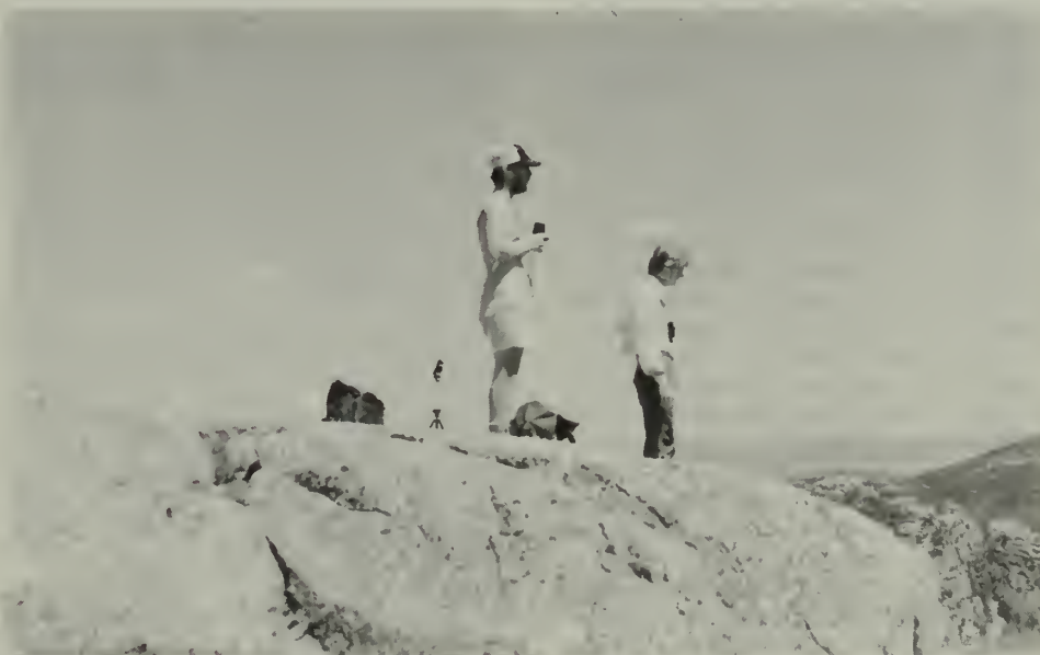
Peregrine attendants maintain their vigil on Jordan Cliffs