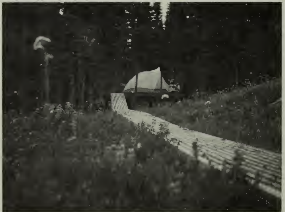
Vegetation shrouds side of walkway at minimum impact campsite southwest of Wonderland Trail.

Backcountry Specialist Peter Thompson of the Mount Rainier NP staff concluded that the objectives