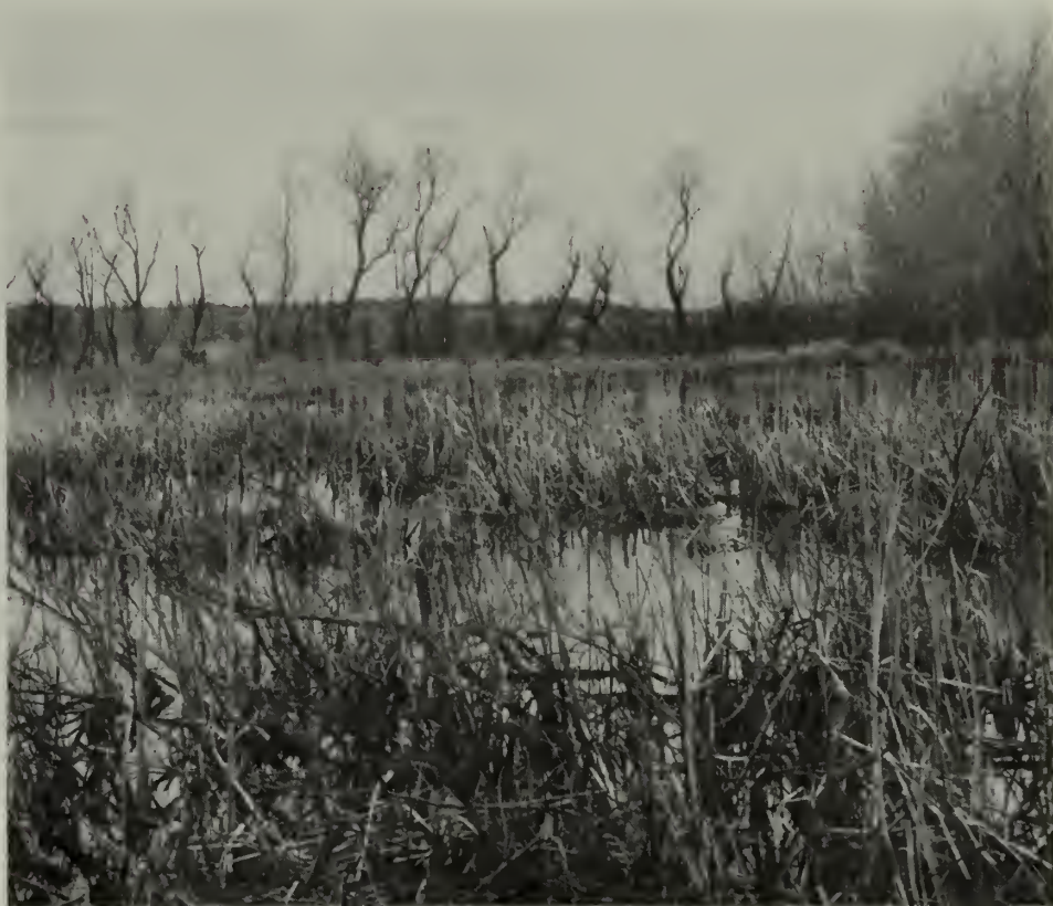
Lynnfield Marsh National Natural Landmark is prime waterfowl habitat in Eastern Massachusetts.

With minimal help from us, our prospective intern submitted a project outline to EIP/Northeast explaining how she planned to enhance North Atlantic's Natural Landmark Program over the course of the summer. We, in turn, indicated to EIP/Northeast our approval of her outline and our enthusiasm in having her assistance. We also signed a cooperative agreement with EIP/Northeast which enabled us to pay our financial obligation to our intern through EIP, thereby avoiding carrying her as an employee of NPS. By late May, she was working full-time on the Landmarks Program.