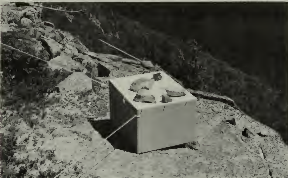
The hack box, held in place by ropes and weighted with stones.