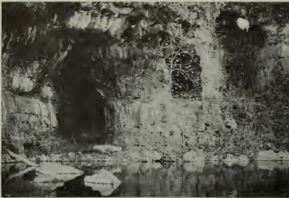
Along the Current River, Nill Cave is easily accessible to canoeists and other river users.