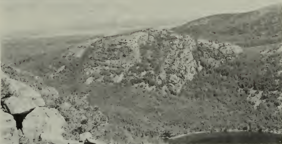
The view from Jordan Cliffs, site of the "hacking" operation at Acadia National Park.