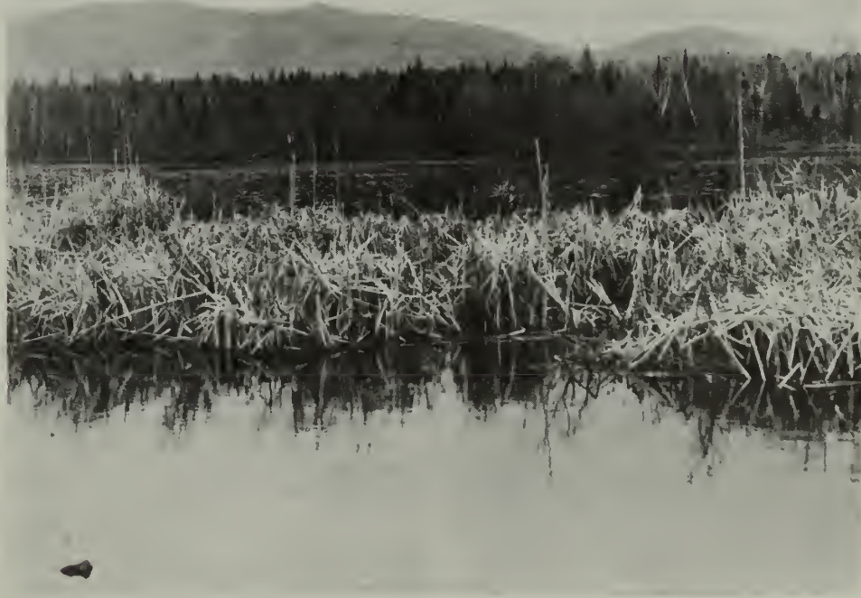
Pondicherry Wildlife Refuge National Natural Landmark, Little Cherry Pond, with Mount Waumbec in distance.