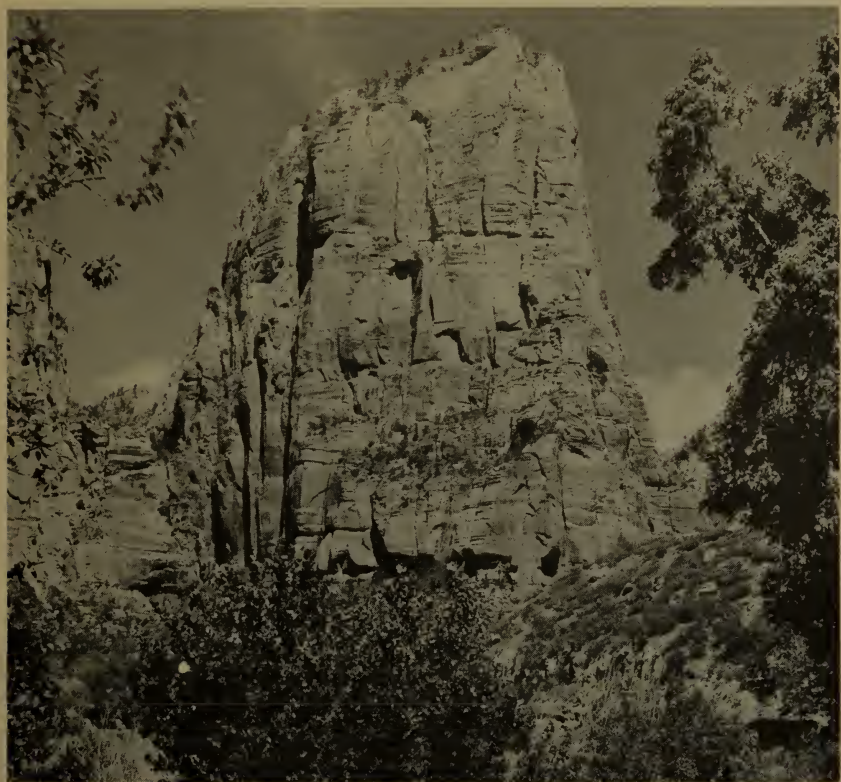
Angels Landing, Zion National Park.

The best fishing, of course, is in the lakes and streams away from the main motor roads. Even along the highways, however, the fish are plentiful, but they also are educated. Constant fishing by amateur fishermen accustom the fish to most forms of artificial bait, so that they become wary—a fact which adds to the enjoyment of the skilled fisherman. Even the