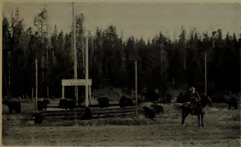
Bear Feeding Grounds, Yellowstone National Park.

Even before the Yellowstone, however, the United States Government showed its interest in the public ownership of lands valuable from a social-use standpoint. In 1832 the Hot Springs Reservation in Arkansas was established by act of Congress, because of the medicinal qualities believed to be contained in the waters. According to tradition, even the Indian