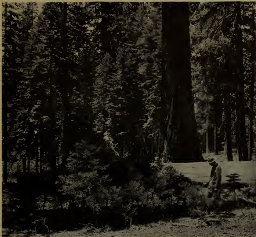
Reforestation Among the Big Trees.

so enjoy the antics of the bears is that bruin is so very human in many of his reactions. In a number of the parks bear-feeding grounds provide an interesting and amusing spectacle. To these places are carted the left-overs from the lodge and hotel kitchens. The bears become accustomed to the feeding time and congregate each evening for a hand-out of "combination salad." Both grizzlies and black bears come to these feeding stations.