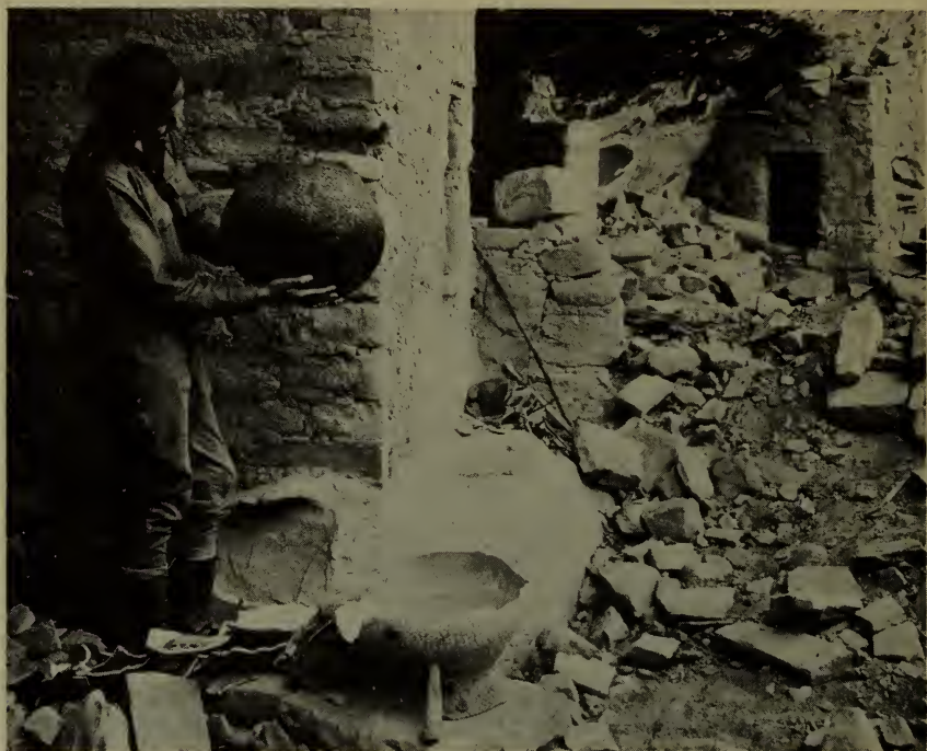
A Valuable Find at Mesa Verde National Park.

For instance, when at the height of their power the Kings of England had as one of their most cherished prerogatives the power to convert any area they wished into a preserve for their personal pleasure in the chase.