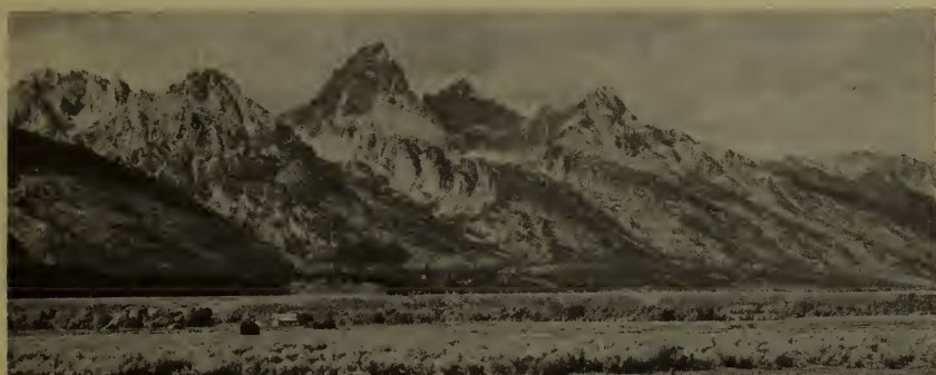
Scene in Grand Teton National Park.

The function of the National Park Service in relation to State and local parks and recreation areas is generally supervisory. The Service cooperates with the officials in charge of the local parks in carrying out projects initiated locally. In general, the National Park Service supervision includes a check on all projects to make sure that they come within the scope of the Emergency Conservation Work program and that the funds allotted to them are legally and wisely expended.