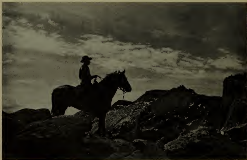
A Ranger Near Mount Hoffman, Yosemite National Park.

Much of the work on the different classes of reservations is the same and is directed primarily toward conservation of forests. The approved types of forest protection now being undertaken include protection against fire and insect infestation, blister rust and tree disease, and roadside fixation and erosion control.