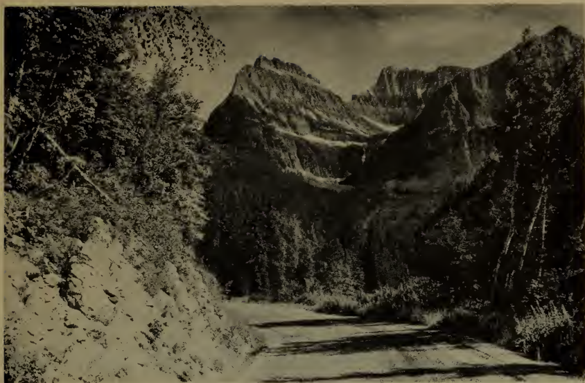
Mount Oberlin, Glacier National Park.

The work is divided into two broad classes, however—conservation for complete preservation in the national parks, monuments, military areas, State parks and allied reservations; and conservation for use in the National and State forests.