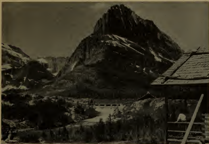
Grinnell Mountain and the Outlet of Swiftcurrent Lake, Glacier National Park.

Another group of reservations similar to the national parks in concept and administration are the national monuments. In order to insure the protection of places of national interest from a scientific or historic standpoint, Congress in 1906 passed a law known as the "Antiquities Act", which gave to the President of the United States authority "to declare by public proclamation historic landmarks, historic and prehistoric