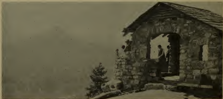
Glacier Point Lookout, Yosemite National Park.

Until 1915 the various national parks and national monuments had received limited supervision as part of the miscellaneous work handled in the Office of the Secretary of the Interior. In that year Secretary Franklin K. Lane, realizing the specialized nature of national park work and the desirability of unifying the parks into one definite system, induced Stephen T. Mather, an old college friend and a keen lover of the mountains and the outdoors generally, to accept appointment as his assistant for the purpose of devoting his energies entirely to park matters. After the passage of the