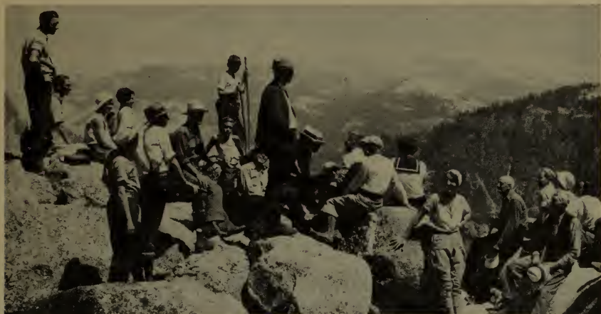
Nature Guide Party on Top of Eagle Peak, Yosemite National Park.

of the emergency. The authorization for permanent cooperation contained in the pending legislation would make it possible for the National Park Service to cooperate in the State park field in much the same way as the United States Forest Service cooperates in State forest protection and the Federal Bureau of Public Roads in the construction of Federal aid highways.