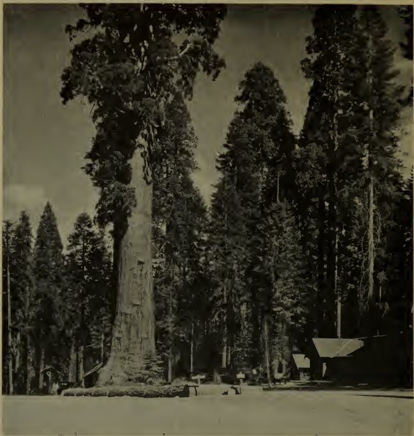
Entrance to Giant Forest, Sequoia National Park.

of the naturalist as to just how the great gorge came into existence, how long it was in the making, and why the banded colorings. So with the Yellowstone geyser fields. "What makes the geysers geyze?" is a popular question; "Do the geysers freeze in winter?" is another, and so on. In the Yosemite, seeing great Half Dome towering nearly 5,000 feet above the valley, the natural impulse is to ask what happened to the other half; and here again is a brief lesson in geology.