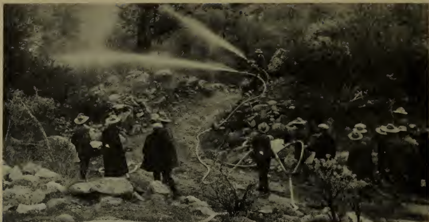
Fire Drill in Sequoia National Park.