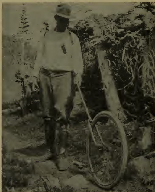
Measuring the Trails.

Congress in establishing the National Park Service outlined its function to be the preservation of the national parks, monuments, and other reservations assigned to its jurisdiction in their natural condition for the use and enjoyment of American citizens of all times.