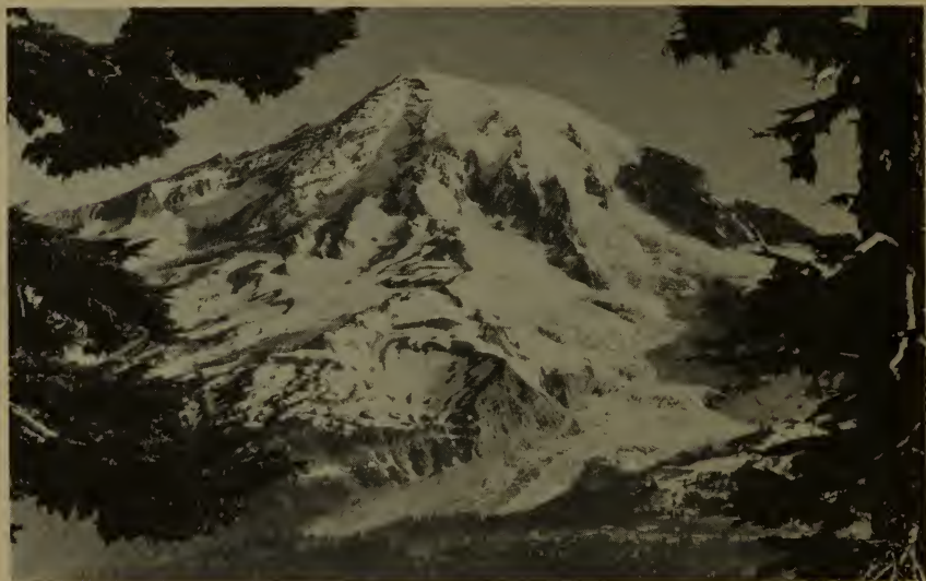
View of Mount Rainier.

The waters of several of the parks contain excellent native game fish, while others at the time of park establishment were practically barren. To insure good fishing, many millions of eyed eggs and fingerlings are planted each year in park lakes and streams through the cooperation of Federal and State fish hatcheries. Every effort is made to improve fishing conditions and afford good sport for the thousands of anglers who seek recreation in the parks.