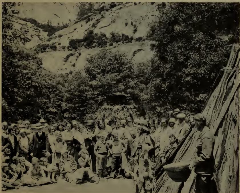
An Indian Dancer at Yosemite.

So in our prehistoric monuments. There the museum exhibits include implements in use a thousand years ago in grinding corn, and in other ordinary routine of life—a sandal or other bit of clothing or personal adornment; shreds of baskets; pottery of many designs and colors.