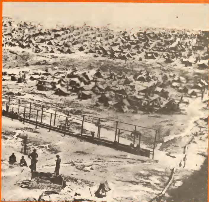
Andersonville, August 1864, looking northwest across the enclosure from a point on the stockade southeast of the sinks.