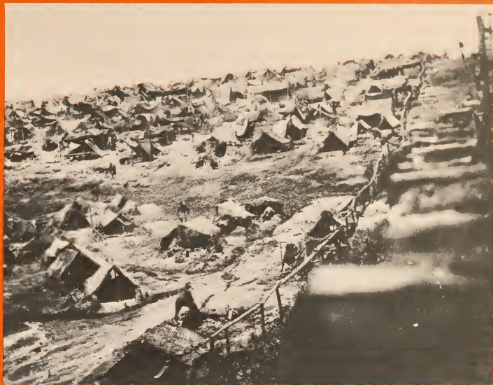
Huts built on the "deadline," August 1864, looking north-east from a "Pigeon-Roost" atop the stockade. Note the "deadline" at right.