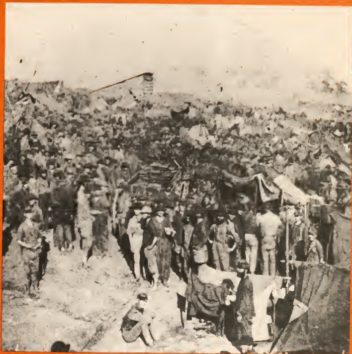
Issuing rations to 33,000 prisoners, August 1864. This photograph was probably taken near the North Gate on Market Street.