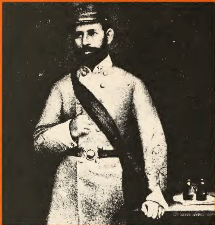
Capt. Henry Wirz, commandant of Andersonville prison camp, March 1864—April 1865.