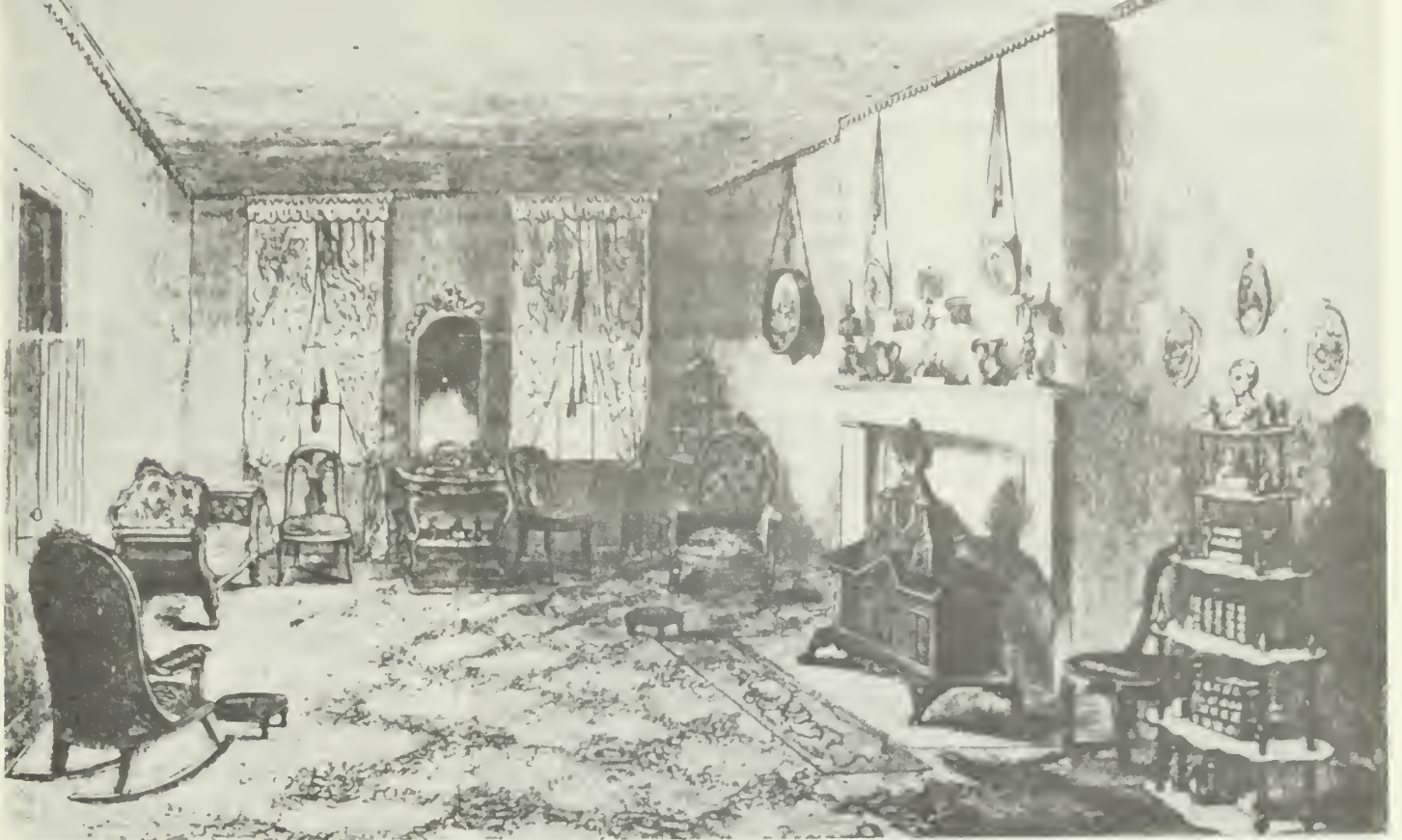
Engraving of the Lincoln Home Front Parlor which was published on March 9, 1861, in "Frank Leslie's Illustrated Newspaper".