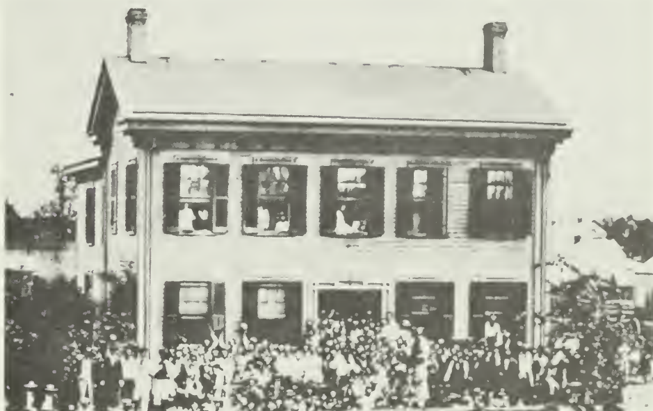
Photographs of the Lincoln Home taken on August 8, 1860 with Presidential candidate Abraham Lincoln on the front steps of the Home, surrounded by a throng of his supporters.

The author is a Historian at Lincoln Home National Historic Site.