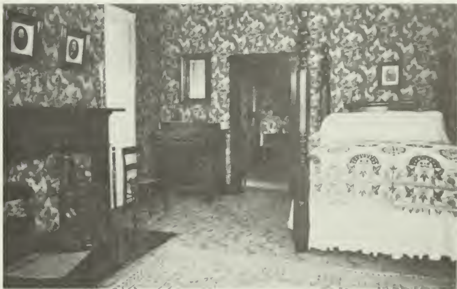
A view of Mr. Lincoln's Bedroom as visitors see it today.