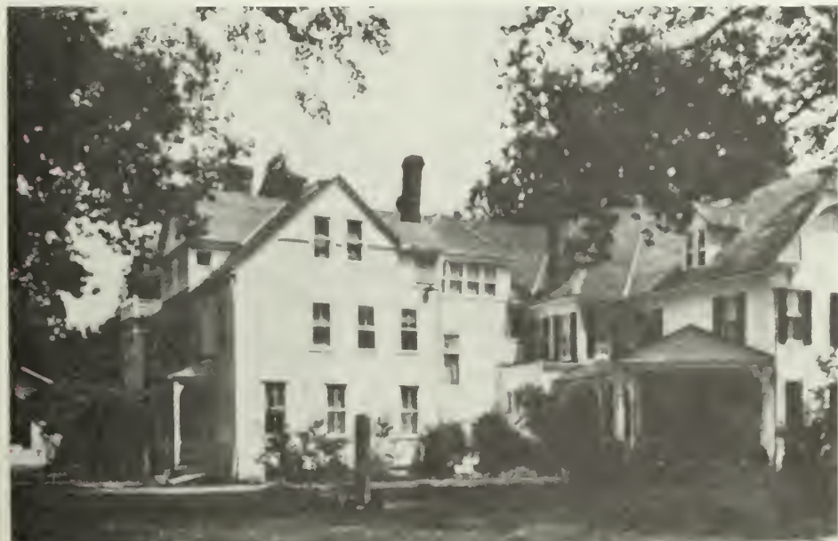
Exterior view of Lawnfield.