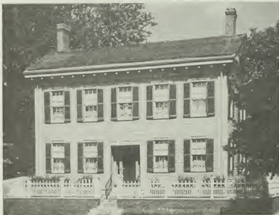
The Lincoln Home exterior as it appears today.

The original wallpaper in Mr. Lincoln's bedroom reveals a great deal about the types of paper Mrs. Lincoln may have chosen for other rooms. It was probably of French manufacture. Since the paper was embossed as well as block printed, it was undoubtedly expensive. The pattern emphasizes botanical motifs, which agrees with photographic evidence from 1865 and later for other parts of the house, including the front and rear parlors. By disclosing the tastes of Mrs. Lincoln, the wallpaper study thus complements the findings of the Historic Furnishings Plan.