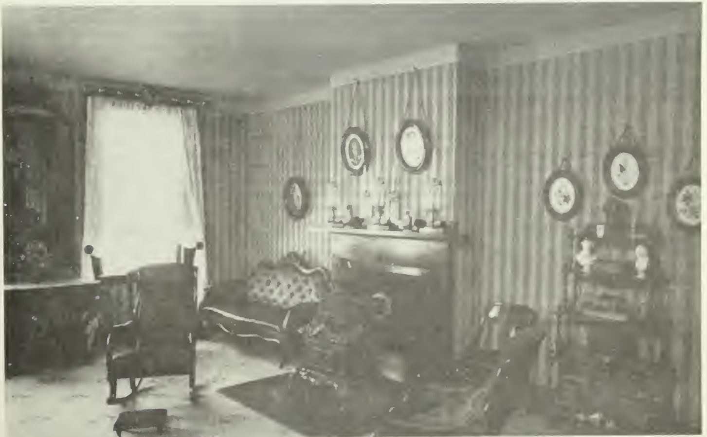
In large measure, the restoration of the Lincoln Home Front Parlor is based on the "Leslie's Illustrated engraving".