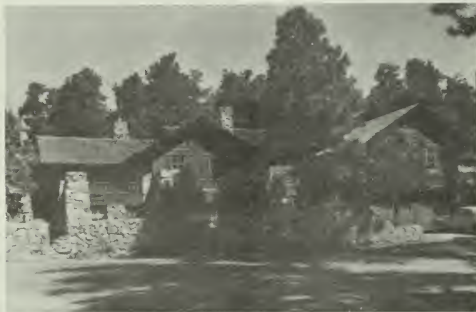
Superintendents' Residence, now offices for the Fred Harvey Co.

Historically and architecturally, the most significant space in the house is the lower level area initially used for interpretation and later as the family room. Special features include a multi-level flagstone floor, grained wood ceiling, hand hewn beams and columns, bracket supported lights, a large stone fireplace, and a plank door with a hand carved latch. Distinctive features elsewhere in the house include fireplaces in both the living and dining rooms, and curtain rods of wrought iron. A steam radiator system, which was tied to a fuel oil fired boiler, heated the building.