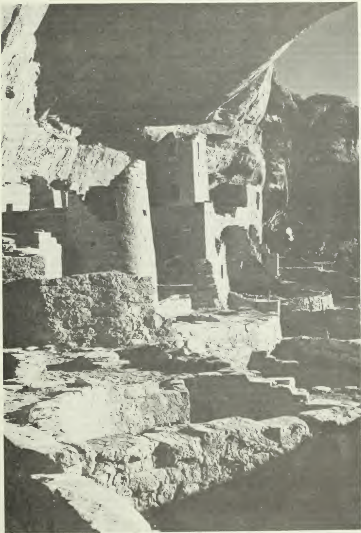
Cliff Palace, showing towers. Seven hundred years ago, the Cliff Palace, largest of Mesa Verde's adobe dwellings housed at least 200 ancestors of present-day Pueblo Indians. Square living quarters and round ceremonial rooms called kivas reveal the lifestyle of 13th century cliff dwellers.