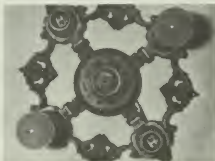
Closeup of a light fixture.

stories—each with two rooms. Upper level rooms originally functioned as offices, lower level rooms as storage and interpretive facilities. In 1931, the structure more than doubled in size as it was modified for domestic use. After completion of the addition, total habitable floor area was 3,505 square feet, divided into three bedrooms, three bathrooms, maid quarters,