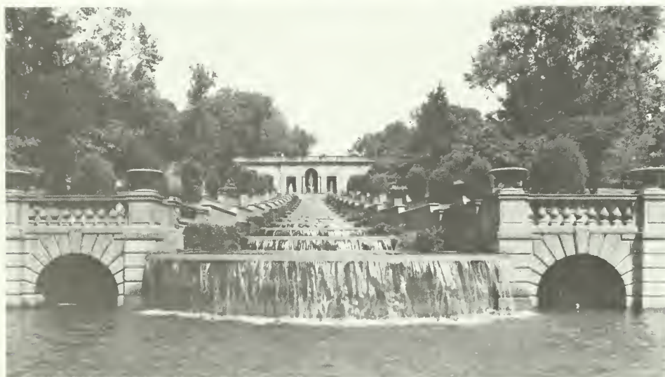
FIGURE 3 & 4: The terraced water cascade is the major design element at Meridian Hill Park in Washington, D.C., which served as a prototype for large scale and decorative usage of exposed aggregate concrete.