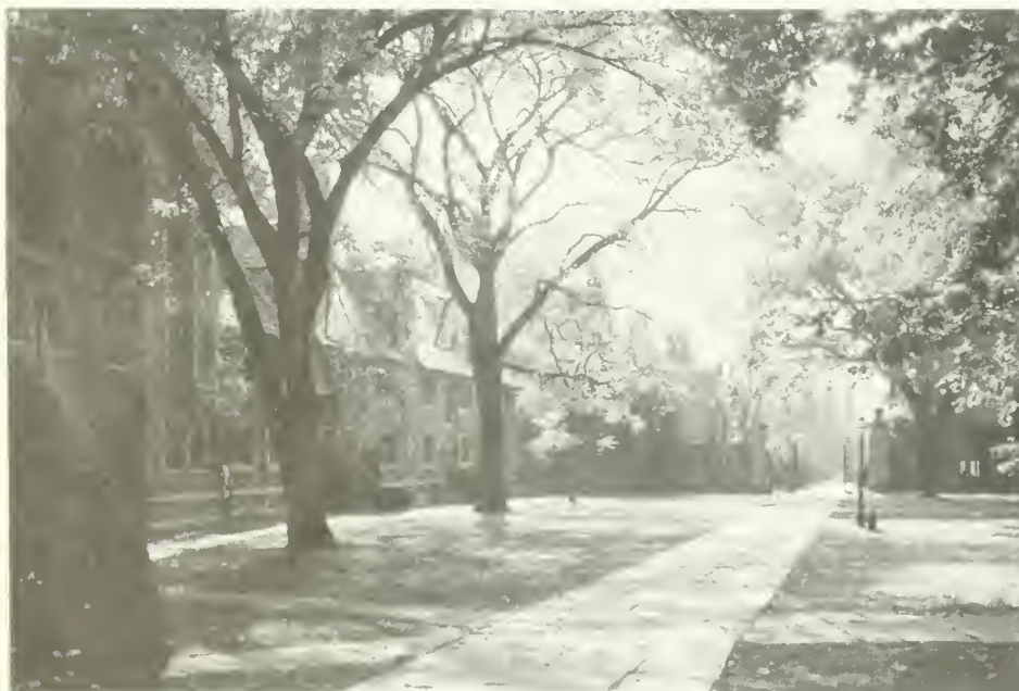
FIGURE 2: The Beatrix Farrand design for the landscape of Princeton University spanned the period from 1912 to 1943. Farrand, a significant figure not only as a major representative of the Arts and Crafts Movement in landscape architecture but also in twentieth-century campus design, has had considerable impact on campus planning and design. Using residential complexes and other buildings as walls for landscaped courtyards of trees and grass is a characteristic feature of American campuses.

has significance in social history and transportation, although its primary significance is landscape architecture.