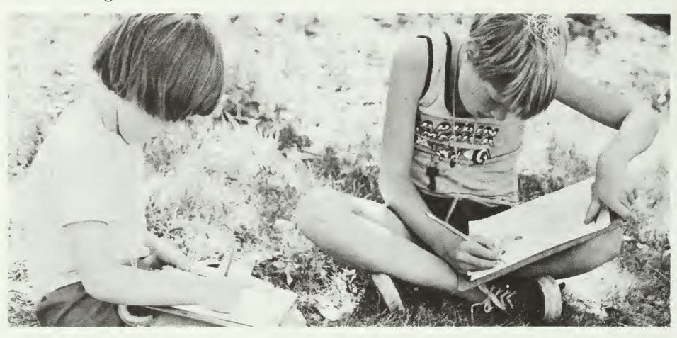
Zion: Creating memories to take home.