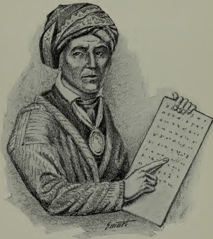
SEQUOYAH (From a pencil drawing by Samuel O. Smart based on reproductions of the original portrait).