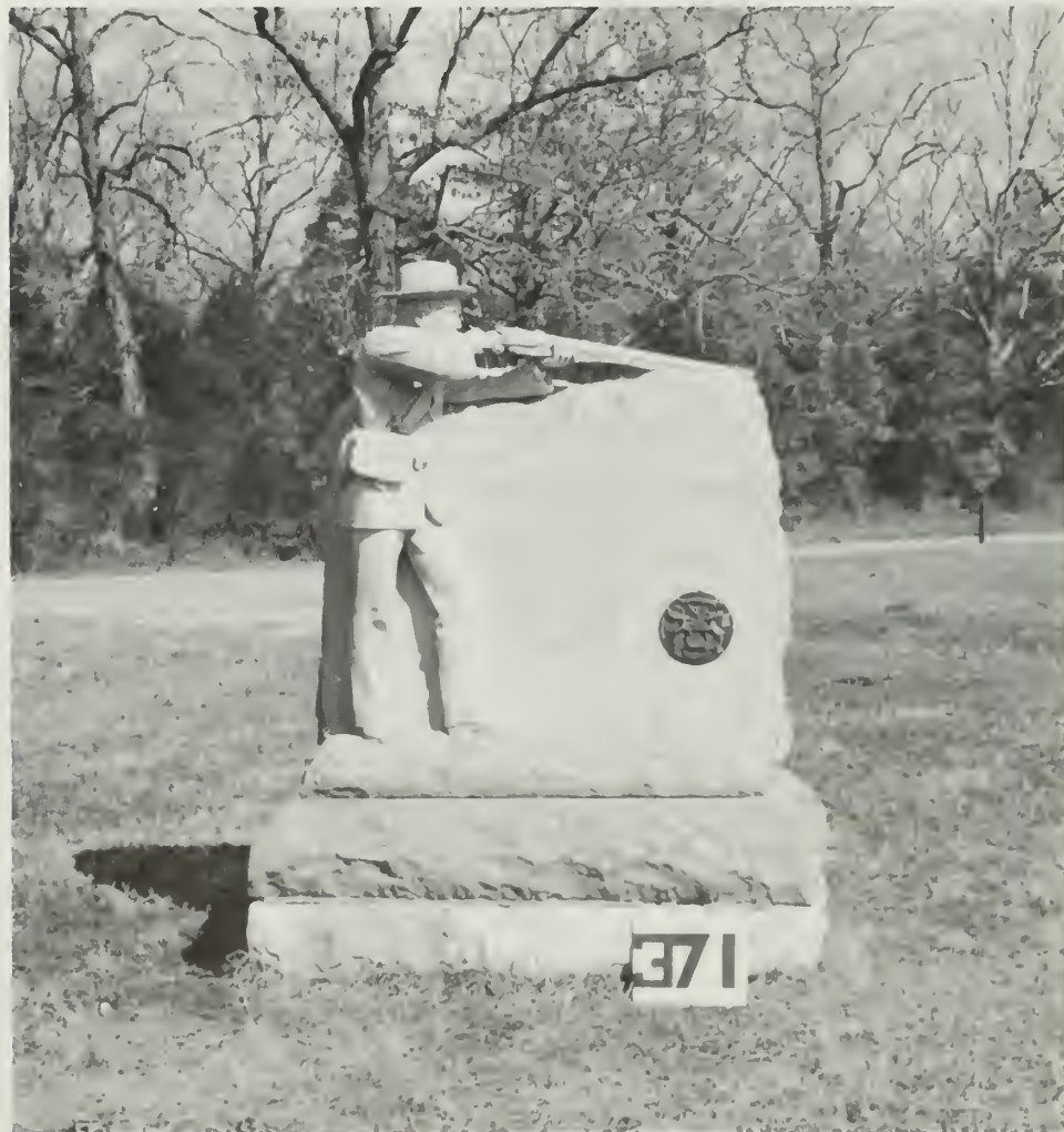
Battlefields may derive additional significance for their association with later efforts to memorialize the bravery and sacrifice of the participants. The movement to construct monuments dedicated to individual units in the 1880s gave many battlefields their current park like appearance. Illustrated here is the monument commemorating the Michigan Thirteenth Infantry Regiment's participation in the Battle of Chickamauga (September 19-20, 1863). (Photo by National Park Service).

The following is a partial list of battlefield components: