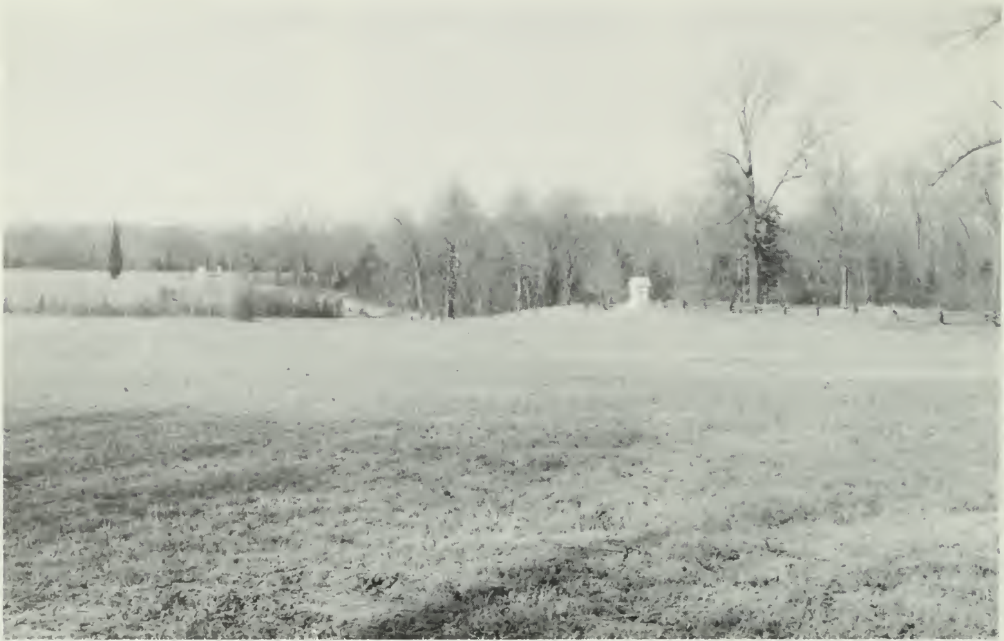
The best-preserved battlefields appear much as they did at the time of the battle, making it easy to understand how strategy and results were shaped by terrain. Participants in the Battle of Shiloh (April 6-7, 1862) would undoubtedly recognize the Sunken Road and the Hornet's Nest depicted here. This was the site of ferocious fighting as Gen. Ulysses S. Grant's men desperately held this position for six hours against eleven Confederate attacks. (Photo by National Park Service).

reflect the historic use of the land. For example, in battlefields located in rural or agricultural areas, the presence of farm related buildings dating from outside the Period of Significance generally will not destroy the battlefield's integrity. It is important that the land retain its rural or agricultural identity in order for it to convey its Period of Significance. (See following paragraphs on the impact of reforestation). The impact of modern properties on the historic battlefield is also lessened if these properties are located in a dispersed pattern. If a battlefield is characterized by rolling topography, the impact of later noncontributing properties may also be lessened. Frequently, one of the greatest changes to the historic landscape is the development of modern roadways. The changes in the roadway circulation pattern on battlefields should be evaluated for the impact on the battlefield's integrity.