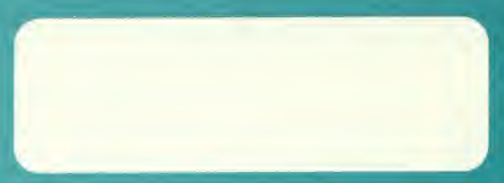
Please do not forward

First Class Mail Postage and Fees Paid NPS Permit No. G-83