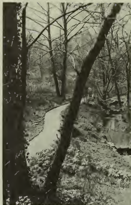
(Above) DUMBARTON OAKS PARK, WASHINGTON, D.C. This park, designed by Beatrix Jones Farrand, lies adjacent to private lands. The informal walkway and the small ponds and waterfalls created by the dams lend this historic landscape a naturalistic air typical of landscapes designed in the first part of this century.

The following proposals for standards of general treatment and use for cultural and historic landscape preservation are built upon the operational definitions offered above. They are part of the on-going process of understanding and controlling our cultural landscape, and are not intended to be an inclusive means to the preservation of these areas of national heritage. Standards for cultural landscapes apply to historic landscapes as well, except where stricter treatment is required. In those instances, an additional statement has been added for historic landscapes.