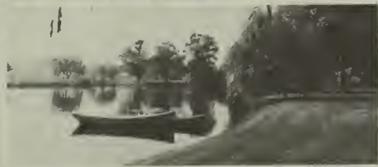
(Left) VAL-KILL POND. ELEANOR ROOSEVELT NATIONAL HISTORIC SITE, HYDE PARK, NEW YORK. This pond, created in 1926 on the site of Eleanor Roosevelt's home, is an example of a historic landscape associated with someone of national significance. The pond is part of one of the most recent additions to the National Park System.