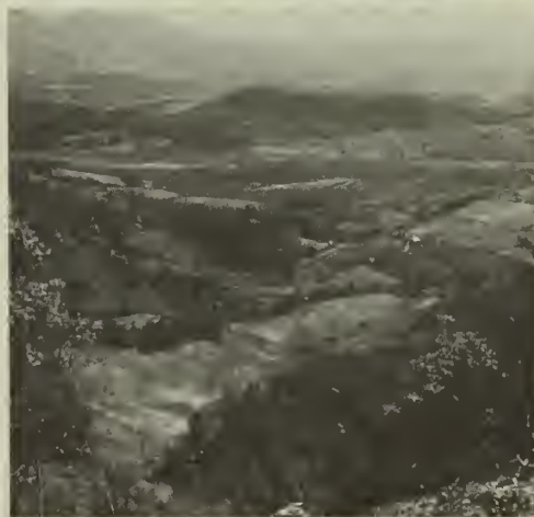
(Right) BLUE RIDGE PARKWAY, VIRGINIA. Shown is a view east from the Parkway over the Piedmont area. This parkway was designed as much for its scenic views as for its other qualities. The farming patterns of this valley contribute to the cultural landscape of the area. (1938 photo)