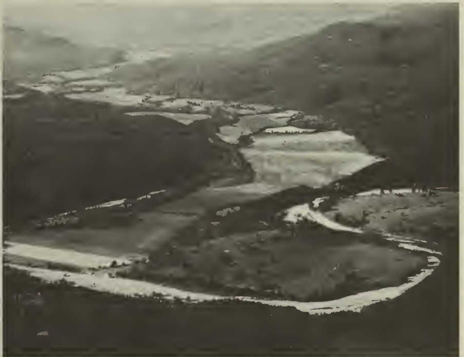
BUFFALO NATIONAL RIVER, ARKANSAS. A good example of a cultural landscape is provided by the continuum of farming seen here in Richland Valley. One proposal for this area entails the use of scenic easements to preserve the significant features of the landscape while maintaining private ownership. (NPS photo)