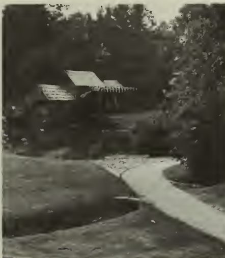
MABRY MILL. BLUE RIDGE PARKWAY, NORTH CAROLINA-VIRGINIA. This mill, in an area whose land-use patterns date to the 1700's, is a good example of a type of cultural impact upon the landscape. Also extant within this area are log cabins; all dating from the same period.

The author is a Historical Landscape Architect, presently on leave from his faculty position in the Department of Landscape Architecture, Kansas State University. He is working with the Chief Historical Architect, National Park Service, on identification and evaluation procedures for cultural and historic landscapes in the National Parks. He is also a member of the Alliance for Historic Landscape Preservation.