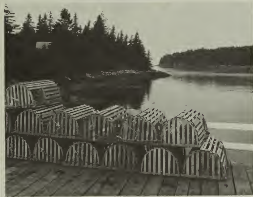
(Left) ACADIA NATIONAL PARK, MAINE. Consisting of more than 11,000 acres, Acadia National Park represents and expresses the point of interface between the natural landscape of the rocky, island coast of Maine, and the encroaching cultural landscape of the lobstering and fishing industries. The edge of the Park is interwoven with the surrounding cultural landscape, and the artifacts associated with its exhibited values and land use patterns.