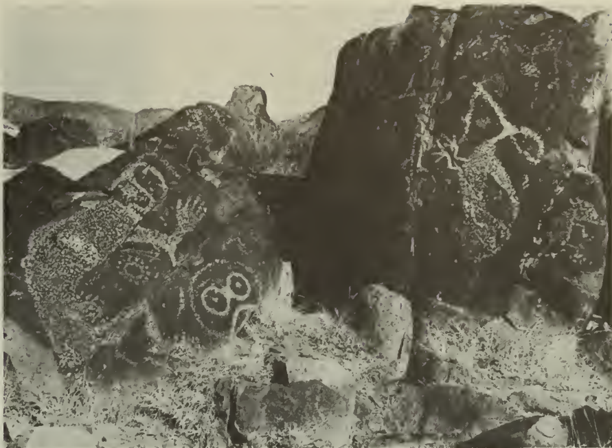
Petroglyph panels at Three Rivers State Park, New Mexico.

Interpretation efforts have also been hampered by a lack of academic agreement on the importance and meaning of the prehistoric symbols, and in some cases historic depictions, grouped under the rubric of "rock art." Some scholars regard petroglyphs and pictographs as a form of information storage, while another group views them as artistic products within a local or regional cultural tradition. Matters have been made still worse by the long-standing disinclination of professional archeologists to get involved in the study.