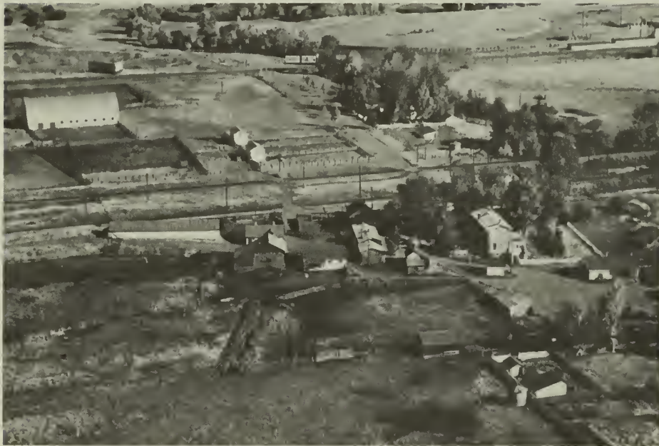
(Above) GRANT-KOHR'S RANCH NATIONAL HISTORIC SITE, MONTANA. This typical western ranchstead of the last century is owned and maintained by the Park Service in its entirety, including furnishings and farm equipment. It is a fine example of settlement and layout patterns representing a continuum of over 100 years.