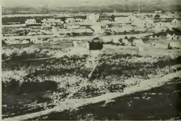
(Right) FORT LARAMIE NATIONAL HISTORIC SITE, WYOMING. These two photographs show Fort Laramie at different periods of its existence: 1868 and 1959. First as a fur-trading post and then as a military post, Fort Laramie played an important role in the settlement of the Wyoming frontier. Its stature as an important historic site is increased by its setting in the open prairie of the region. The layout of the fort and all of its related buildings and other land uses represents a significant stage of control of the western reaches of the country.