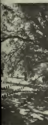
(Left) CEMETERY, VICKSBURG NATIONAL MILITARY PARK, MISSISSIPPI. This cemetery, on the site of the Civil War battle at Vicksburg, commemorates the fallen dead. It is a vernacular designed landscape of historical significance.