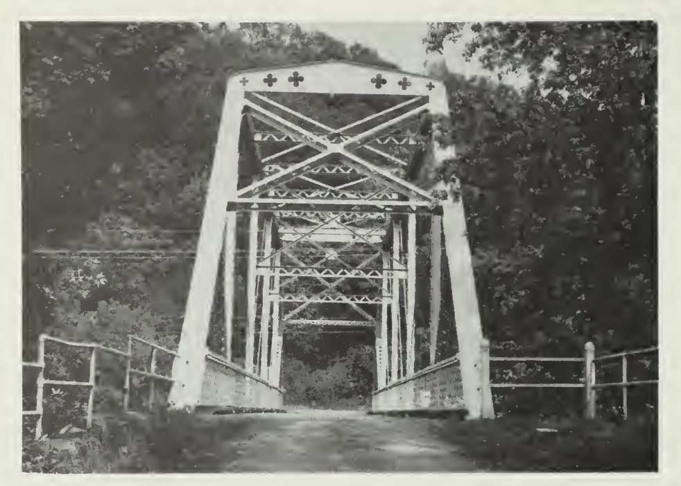
The 1898 Birmingham Bridge was nominated to the National Register of Historic Places as part of the Industrial Resources of Huntingdon County, Pennsylvania multiple property submission. Located in Birmingham, it is significant as "a fine example of one of the county's less than ten remaining pin-connected Pratt through truss bridges built in the late 1800s." (Nancy Shedd)

For properties significant under Criterion C, summarize the following: