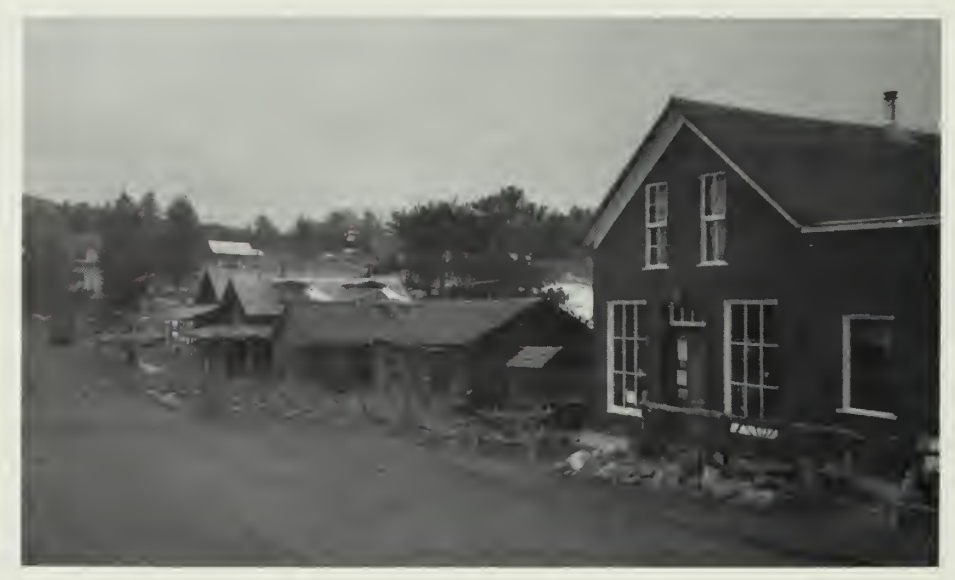
Main Street was included in the Gold Hill Historic District, a property nominated to the National Register of Historic Places as part of the Metal Mining and Tourist Era Resources of Boulder County, Colorado multiple property submission. Dating from the early 1870s, the Gold Hill Historic District is considered the most "intact representation of the early mountain communities that developed as a result of the precious metal mining in Boulder County."

Historic contexts may include those identified in the State historic preservation office comprehensive planning process. According to the Secretary of the Interior's Standards and Guidelines for Archeology and Historic Preservation, historic contexts provide information about the historical patterns and trends that produced individual properties. Historic contexts serve as the foundation for decisions about the identification, evaluation, registration, and treatment of historic properties. For further explanation of historic contexts, see discussion in section E.