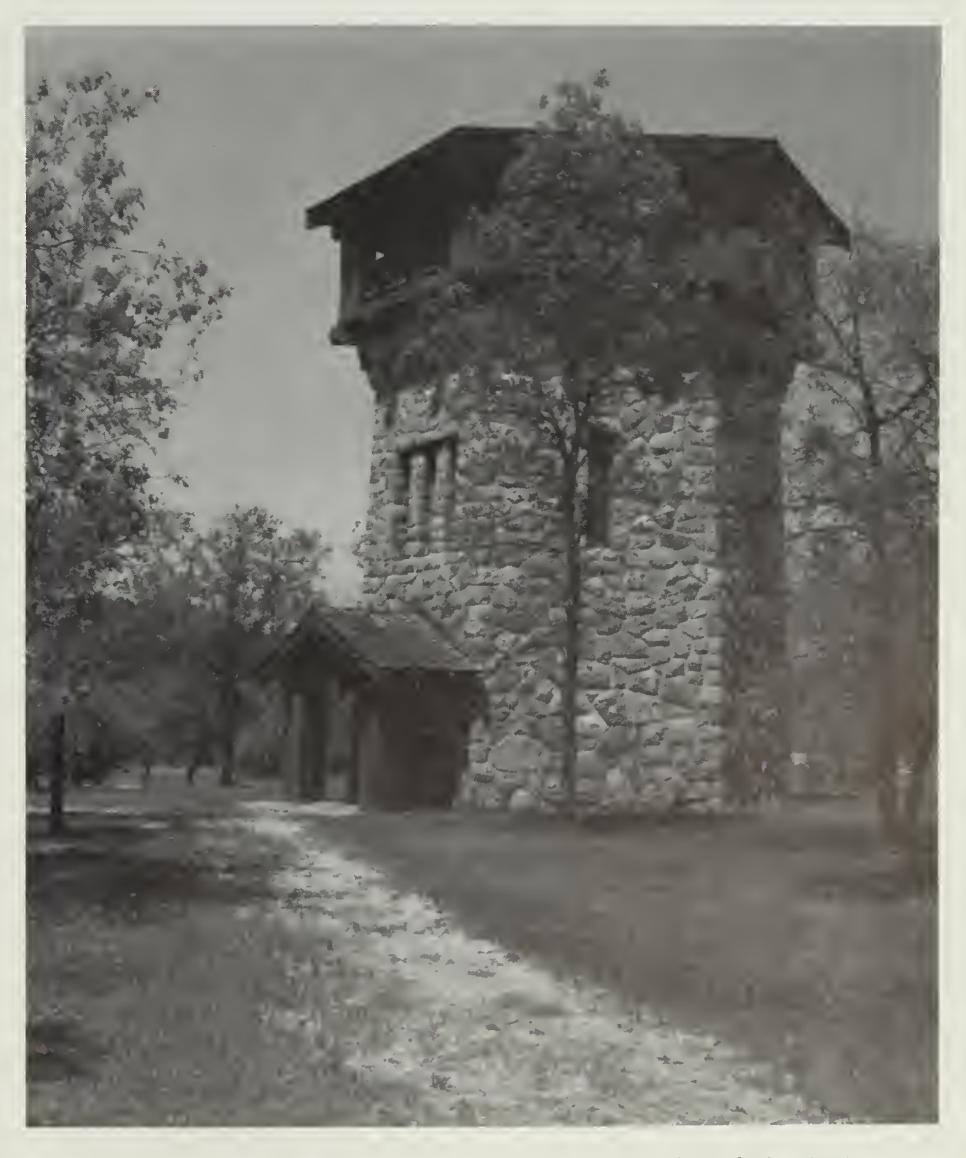
The 1939 water tower is a contributing building in the National Register of Historic Places nomination of Lake Bronson State Park in Kittson County, Minnesota. The eligibility of the park was justified for its association with the Minnesota State Park CCC/WPA/Rustic Style Historic Resources multiple property submission. The historic resources of Lake Bronson State Park are significant as "outstanding examples of rustic style split stone construction." (Rolf T. Anderson)

Enter the name, title, organization, address, and daytime telephone number of the person who compiled the information contained in the documentation form. The SHPO, the FPO, or the National Park Service may contact this person if questions arise about the form or if additional information is needed.