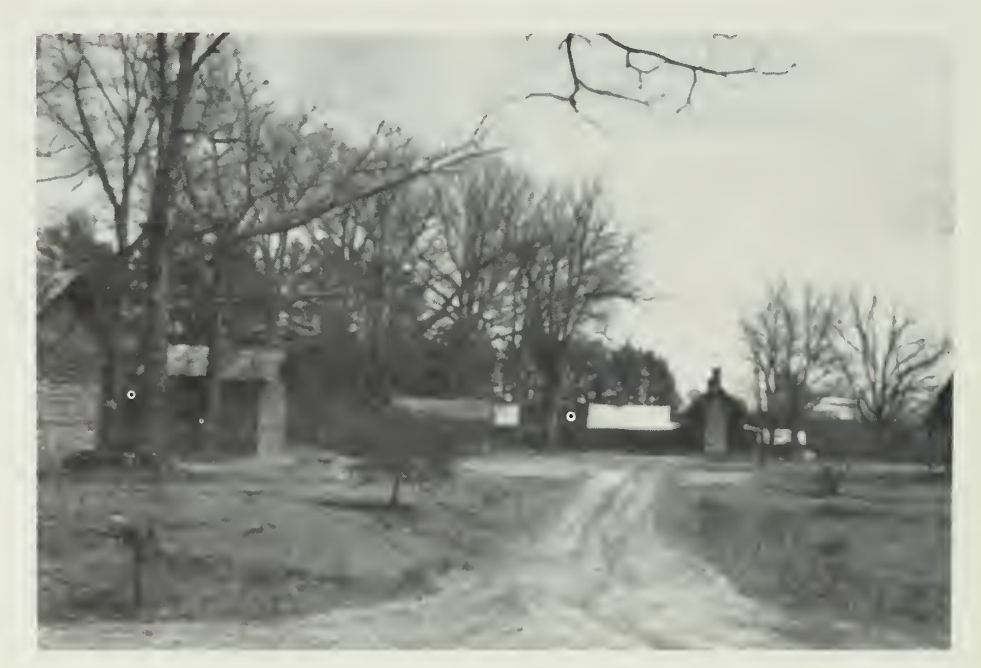
This cluster of agricultural buildings that make up the ca. 1899 Puckett Family Farm at Satterwhite, Historic and Architectural Resources of Granville County, North Carolina has been described as "one of the county's most significant bright leaf era rural properties, an intact symbol of the way most of the county's citizenry led its life from the Civil War into the 1950s." It was nominated to the National Register of Historic Places as part of the geographically-based Granville County, North Carolina multiple property submission. (Marvin A. Brown)